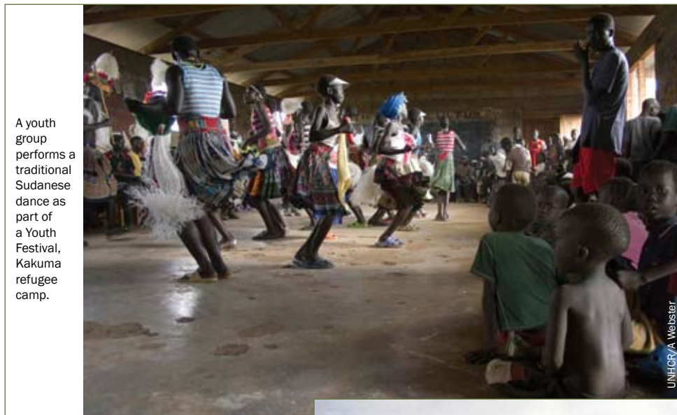
A youth group performs a traditional Sudanese dance as part of a Youth Festival, Kakuma refugee camp.

Based on this belief we decided to find ways to help our fellow refugees.