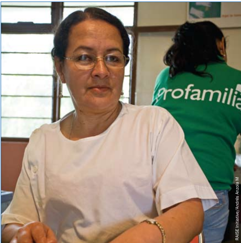
Profamilia staff providing sexual and reproductive health services to displaced communities in Colombia

In rural areas, IDPs’ health issues are exacerbated by a lack of access to services. IDPs are widely dispersed and, in the Pacific region especially, the health service infrastructure is minimal. Afro-Colombians and indigenous Colombians comprise a disproportionate number of the displaced. Recognising that these populations in particular lack economic resources and are almost entirely cut off from access