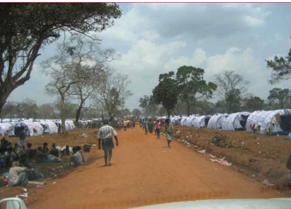
Menik Farm in Vavuniya District, Sri Lanka.

Shortages of food and water, as well as restrictions on movement between