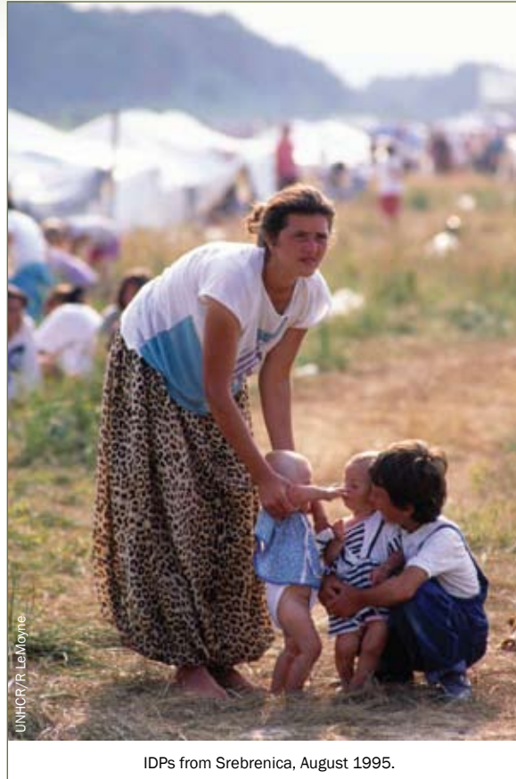
IDPs from Srebrenica, August 1995.

Supporting national efforts to resolve protracted displacement nevertheless will require a more comprehensive international effort. In BiH, UNHCR has been working intensively to