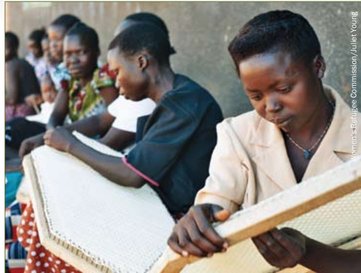
IRC training programme, Kitgum IDP camp, northern Uganda.

3. 'Youth Microenterprise and Livelihoods: State of the Field' Lessons from the 2007 Global Youth Microenterprise Conference, Making Cents International, Jan 2008. http://tinyurl.com/MakingCents08