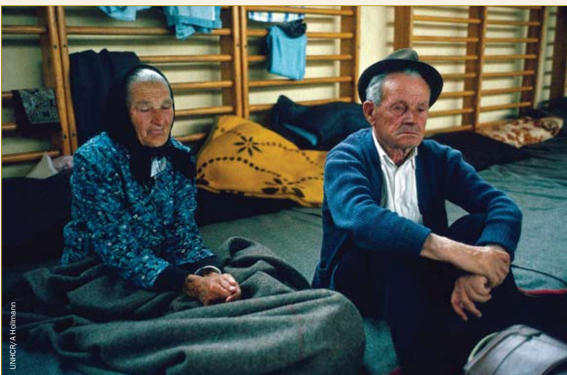
Refugees from Bosnia and Herzegovina in a sports centre in Sremska Mitrovica, Serbia.