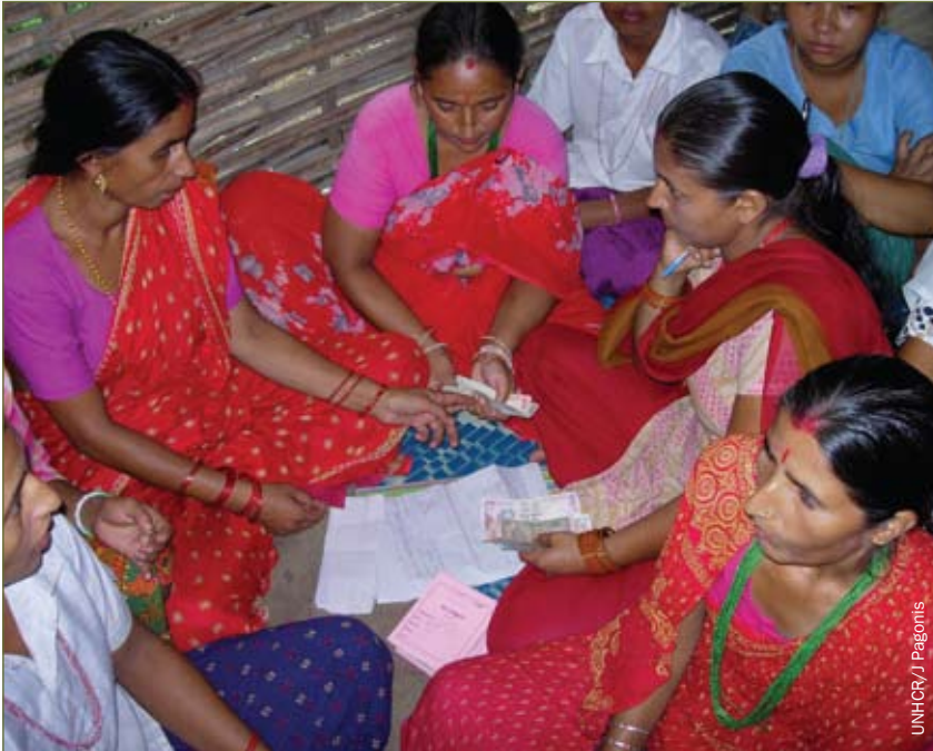
Bhutanese refugee women in Timai camp, eastern Nepal, participate in a microcredit scheme, which offers loans to start small businesses.

there are many occasions when they need sums of cash greater than they have to hand, and the only reliable way of getting hold of such sums is by finding some way to build them up from their savings.” 3 Appropriate financial services for the poor, including protracted IDPs, should therefore promote savings as a means to build wealth and to make these lump sums available when needed in a safe, convenient, flexible and affordable way.