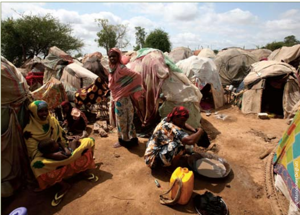
Displaced woman and children at Sheikh Omar camp in Jowhar, Somalia.

Thus, the common narratives of the situation in the country of origin as one of permanent crisis and upheaval, and the refugee situation as one of protracted stasis, which can be challenged on closer analysis, seem to have shaped international responses in important ways. Recent events in the Somali regions throw some light on this. The violence following the ousting of the Islamic Courts and the arrival of the (then) Ethiopian-backed Transitional Federal Government (TGF) in 2007 prompted a massive displacement