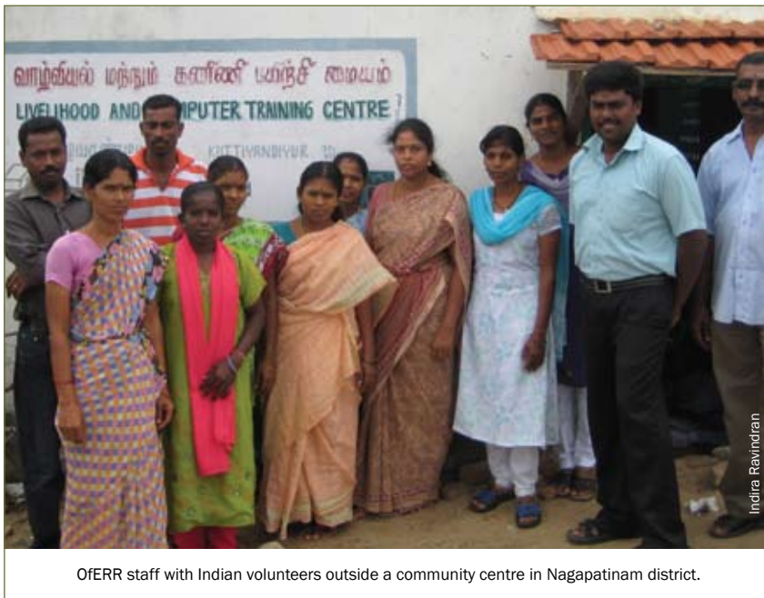
OfERR staff with Indian volunteers outside a community centre in Nagapatinam district.

disaster management, first-aid training, and legal and human rights awareness, among others.