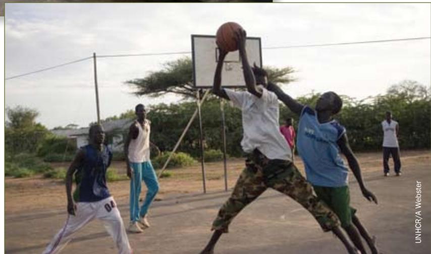
Kakuma refugee camp

At that time, it was a frequent experience to hear at night-time the cry of "Leba, leba!" (Thief, thief!) Sudanese refugee minors (the 'Lost Boys' now resettled in the US) used to raid the Ethiopian community at night. Everybody chased the thieves in the pitch darkness but those Sudanese minors were rarely caught. What amazed us were the reactions of those who had been chasing the thieves. When they returned, they would gather in small groups to exchange experiences: the one who caught the neck of his neighbour, mistaking him for a thief; the one who couldn't find the door of his own house to go out to join the chase; the one who