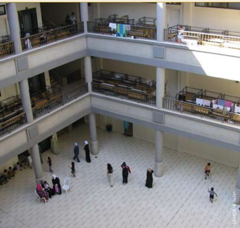
Some 500 Lebanese refugees fleeing violence sheltered in Al-Shariya High School, South Damascus, Syria.

Camp management has developed as a key concern within the humanitarian community as part of the humanitarian reform agenda, alongside the more traditional sectors in emergencies. However, most of the tools and guidelines – including the Camp Management Toolkit, UNHCR Emergency Handbook and Sphere standards 1 – assume a traditional camp setting. Although reference is made to different kinds of settlement options, a differentiated approach to them is rarely offered. Collective centres