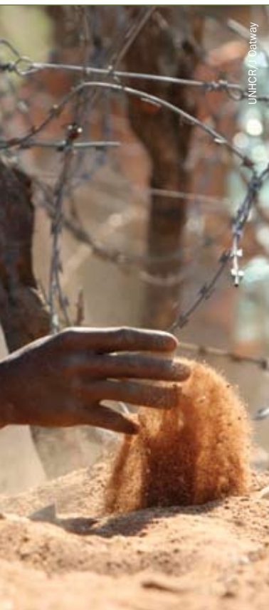
UNHCR / Datway