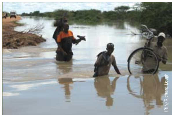
Floodwaters at Dadaab, Kenya, November 2006.

The document of 'Comments and Proposed Revisions to the Negotiating Text' prepared by the Chair of the UNFCCC Ad Hoc Working Group on Long-Term Cooperative Action is available at http://www.unhcr.org/4a408cc19.html ; the revised draft negotiation text, as of July 2009, is available at http://unfccc.int/resource/docs/2009/awglca6/eng/inf01.pdf