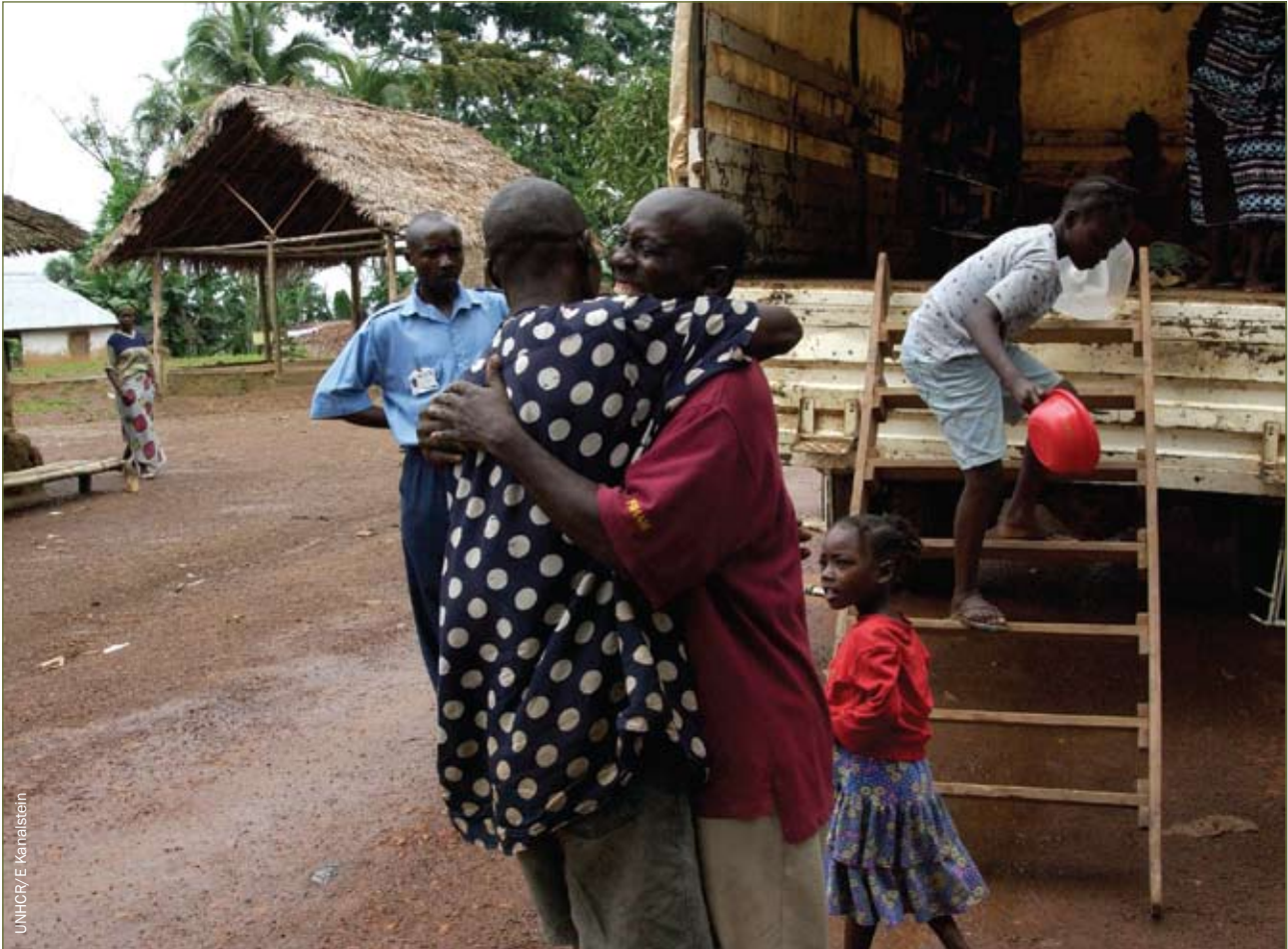
Voluntary repatriation of Sierra Leonean refugees from Liberia, July 2004.

Between 1993 and 2007 more than 9.2 million people across Africa were able to return to their country of origin. Decreases in total refugee populations are also a result of third country resettlement, with over 182,500 people resettled in the same period. Opportunities for local integration, on the other hand, which had been a solution for many refugees