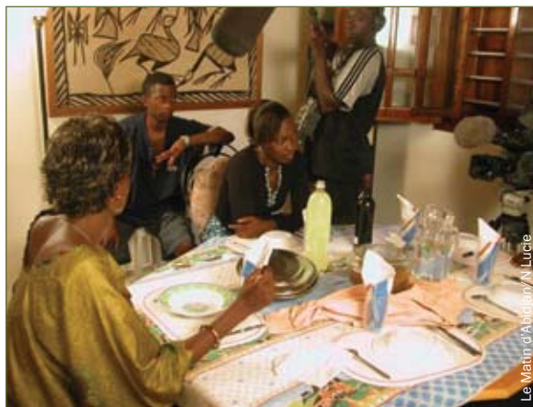
An episode of a UNHCR-produced soap opera promoting tolerance in Côte d'Ivoire won the Audience Award at the 7th Abidjan FICA film festival (Festival international du court métrage d'Abidjan) in the short features category. Directed by young Rwandan refugee Joseph Mouganga.

Liberian civil society, after years of substantial lobbying, formally participated in the 2003 peace negotiations with backing from grassroots organisations which included refugees. Their participation supported the inclusion of members of civil society in the transitional government, counterbalancing the