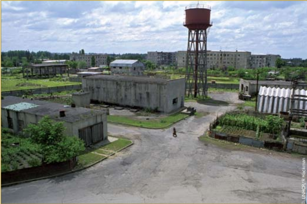
IDP accommodation near Zugdidi, Georgia.

in collective centres or to access alternative durable housing solutions. While collective centres sometimes marginalise their residents vis-à-vis the local community, it is also true especially in protracted situations of displacement that collective centre residents may have developed their own community links and support mechanisms that they wish to maintain; they should be supported to be able to remain together wherever possible.