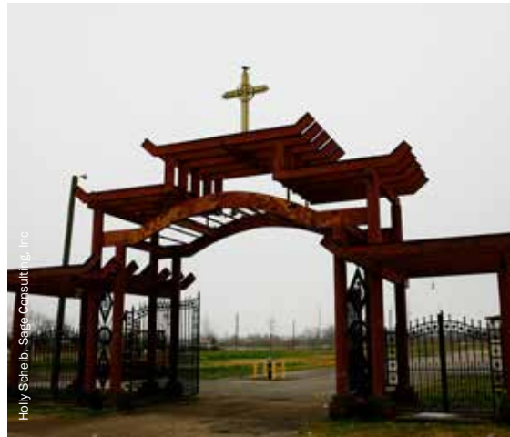
Entrance to park area opposite Mary Queen of Vietnam Catholic Church, the cultural heart of Village L'Est in New Orleans East.

effectively leaving lower-income residents without a hospital. Thereby, low-income forced disaster migrants dependent on public assistance were effectively prohibited from returning to New Orleans due to the cessation of public assistance across these key sectors. Regardless of the actual effects on people, these changes were rationalised as a means to protect the well-being of evacuees "for their own good", subsuming any question of citizen rights and recourse to justice.