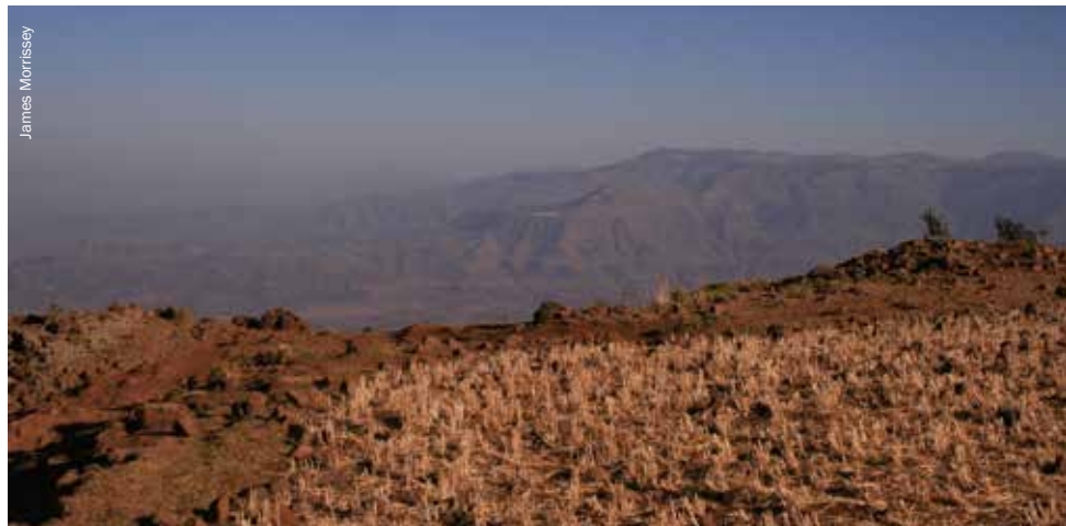
Adverse growing conditions in the Ethiopian highlands provide a context for framing development efforts exclusively in terms of material rights.

Since such strategies were principally aimed at countering the efforts of insurgent forces rather than securing livelihoods for individuals experiencing drought, the lasting impact has been to arouse popular suspicion of relocation programmes as a means to address environmental problems. As a result, the current government's approach is to focus on the provision of relief to environmentally stressed areas and on transforming livelihoods so as to reduce the imperative to move in the first place. Such efforts however have focused on the provision of material goods which have been tied to political compliance with what is, effectively, a one-party state.