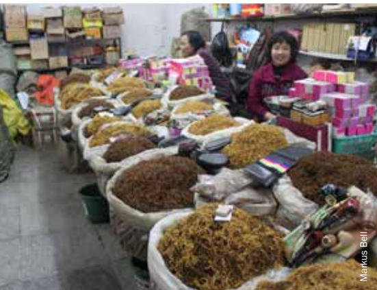
Markets offer temporary employment for North Koreans during their often slow movement south. Yanji, Jilin province, near the North Korea border.

between the powers of the region. It is high time the international community called for action, beginning with the demand that the human rights of these individuals be included on the agenda of any future discussions.