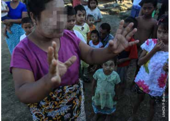
A woman vents her frustration about living conditions and life in general since being forced to flee from her home in Set Yone Su ward, Rakhine state, during the violence in October 2012. She said people bearing weapons forced everyone in her village to flee before burning their homes and looting their possessions.

In Myanmar, some have called for the Rule of Law and Tranquillity Committee (RLTC), chaired by Daw Aung San Suu Kyi,