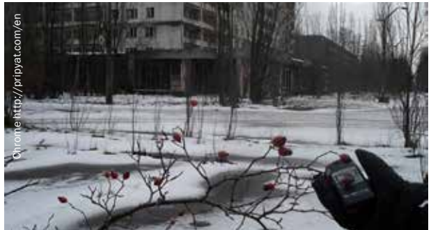
Checking ambient radioactivity levels in 2011 in the abandoned city of Pripyat, 2km from the Chernobyl nuclear power plant.

In both the Chernobyl and Fukushima cases, strong governments responded with a heavy-handed approach that proved effective, to a certain extent, in evacuating immediate areas in the short term. Interestingly, the governments of Japan and the USSR both adopted top-down governance approaches too in how they communicated to their populations in the context of humanitarian