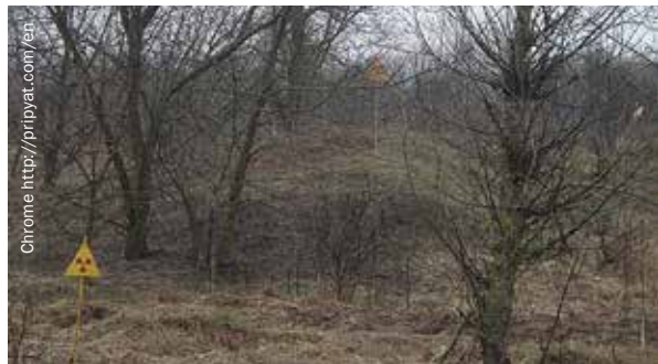
The buried village of Kopaci, located 7km from the Chernobyl nuclear power plant. After evacuation, many villages were bulldozed and buried because of high contamination levels.

while others refused to evacuate without their farm animals, tools and equipment.