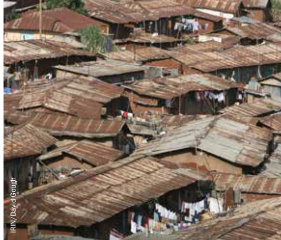
Kibera slum, Nairobi, home to thousands of IDPs.

The protection working group set up a legal aid sub-working group to explore the gaps in the law in respect of protection of IDPs and to draft key provisions of an IDP policy. Following a national stakeholders' review forum in March 2010 the policy was finalised in partnership with the Ministry of State for Special Programmes 3 . Meanwhile a Parliamentary Select Committee on