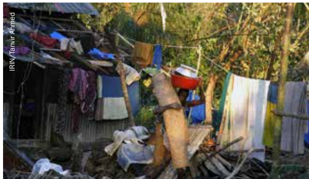
A cyclone-devastated home in southern Bangladesh, 2007.

Categorising movements related to humanitarian crises presents many dilemmas for scholars and policymakers alike. It is increasingly recognised that few migrants are wholly voluntary or wholly forced; almost all migration involves a degree of compulsion,