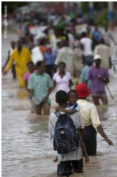
Haitians wade through the flooded streets of Gonaïves after Hurricane Hanna caused severe flooding, 2008.

There is no agreement as yet on guidelines for anticipatory or preventive resettlement (that is, resettlement in advance of significant impacts), or indeed by what criteria such resettlement might be deemed necessary. The lack of a clear internationally accepted definition of uninhabitability of a place and the likelihood