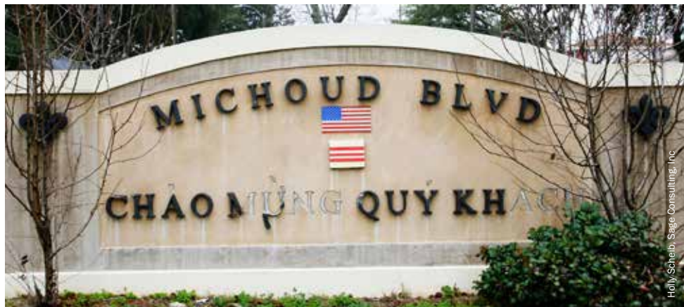
Entrance to the residential neighbourhood areas of Village L'Est, showing both US and Vietnamese flags.

In 1975, Catholic North Vietnamese who were being held in refugee camps in the US were invited by the Archbishop of New Orleans to form a community. As a result, in 1980 a new parish – called New Orleans East – was formed with approximately 6,000 Vietnamese residents. Activity centred around its central church, Mary Queen of Vietnam. Disregarding the City Council ordinance to turn New Orleans East into a non-residential green zone, the majority of Vietnamese residents returned to their homes less than five months after the hurricane. The priest of the local church, Father Vien, and his church staff displayed tenacious leadership, working tirelessly to make their way through the morass of city, state and federal bureaucracy to secure the mass of permits and funds required for rebuilding their community.