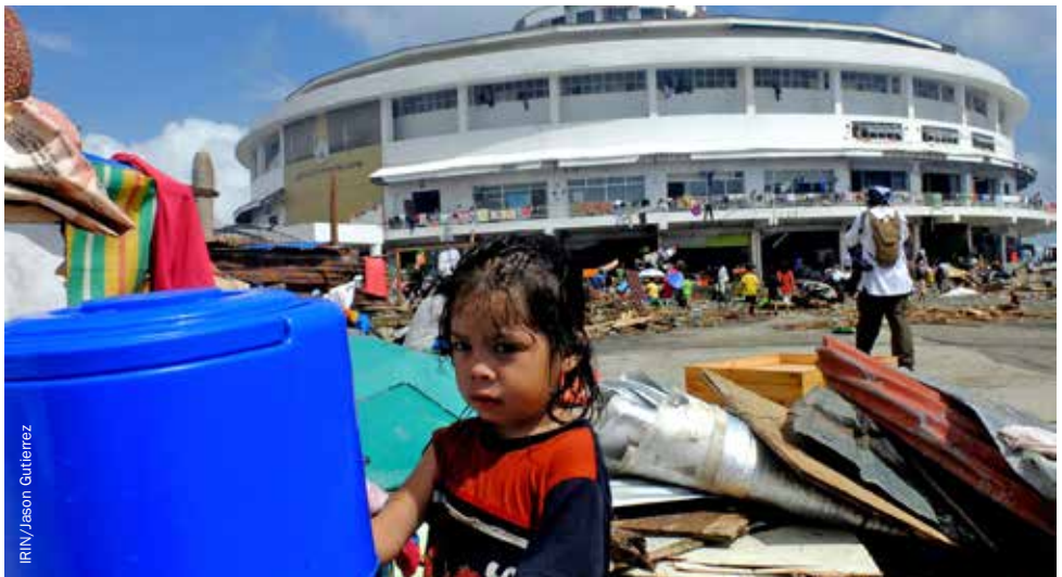
Some 8,000 displaced persons have been living in the Tacloban Astrodome, the city’s largest sports complex.

The town of Guiuan, in the province of Eastern Samar, was Typhoon Haiyan’s first point of impact in the Philippines. Even before the disaster, internet connectivity was very limited. After some initial technical issues due to high humidity and difficulty in identifying a suitable location among widespread rubble, the ETC was able to establish Wi-Fi internet