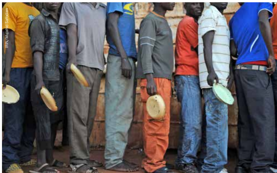
Migrants and asylum seekers at the 'I believe in Jesus Church' shelter for men in the South African border town of Musina queue up for a free hot meal, provided by UNHCR.

The protection of Zimbabweans in South Africa has fallen between the cracks of different international organisations' mandates. UNHCR has consistently regarded most Zimbabweans as not being refugees;