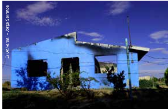
Homes abandoned by IDPs and vandalised by criminal groups in El Porvenir, Chihuahua, 2010.

People crossing borders seeking safety and security as a result of criminal violence, whether as a direct consequence of it or anticipating threats, are specifically covered by the expansive definition of a refugee in the 1984 Cartagena Declaration, which includes people who flee the threat posed by "generalized violence, ... massive violation of human rights or other circumstances which have seriously disturbed public order". 2 Under the 1951 Refugee Convention protection is available on a case-by-case basis to those who can show a well-founded fear of persecution based on one of the five grounds enumerated in the Convention.