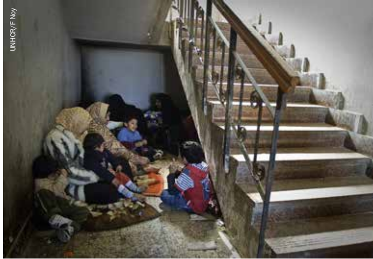
Families of migrant workers wait under a staircase in the arrivals hall at the Egyptian-Libyan border post at Sallum, awaiting clearance to enter Egypt, 2011.

Large proportions of populations affected by climate change will be forced to try to move into safer and more habitable areas but will be prevented from doing so. It seems that border security is set to continue increasing in terms