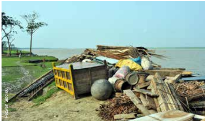
A family has gathered all its household materials in preparation for moving to a more remote island. The household head said that none of his family wanted to go as the island is frequently flooded and the threat of cyclone and storm surge is greater there.