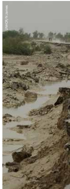
Road damaged by floods in Balochistan, Pakistan, 2010.

Given the rapid rate of return, ‘early recovery’ programmes should