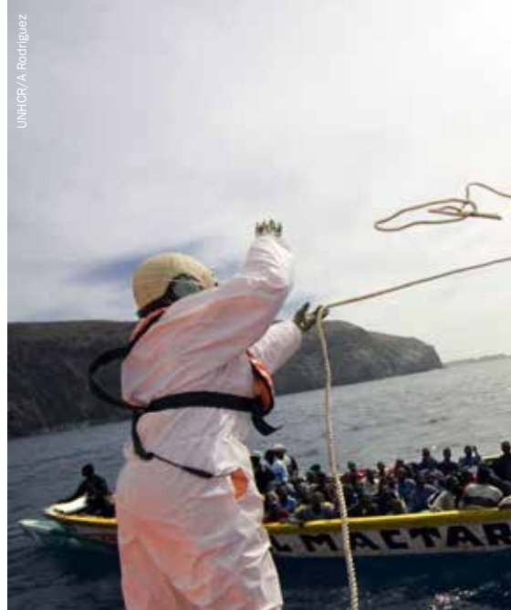
Spanish coastguards off the island of Tenerife in the Canaries intercept a fishing boat carrying African migrants.

Even in the absence of empirical evidence that the possibility of being intercepted affects