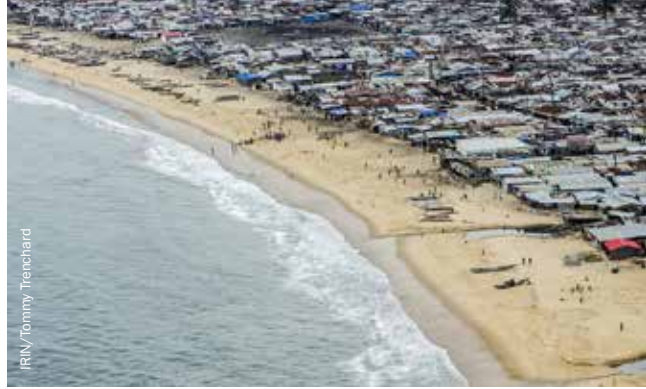
West Point slum, home to some 75,000 people, near central Monrovia, 2013.

The Liberian capital, Monrovia, is a quintessential example of conflict-driven urban growth, further exacerbated by rural deterioration and continuing ethnic tensions. During the civil conflict from 1989 to 2003, Liberians from across the country fled to Monrovia and other cities where UNHCR and several agencies provided some humanitarian assistance. After 2005 UNHCR conducted a return programme and the Liberian government ceased to categorise these people as IDPs. Nevertheless, large numbers of them remained, especially in Monrovia, for reasons related to continuing insecurity, loss of land and the lack of rural livelihoods. The population in Monrovia