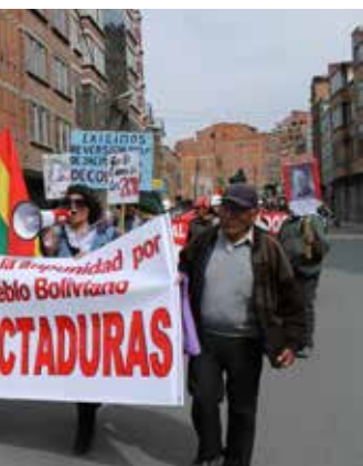
...d for Justice and Historical Memory of ... reparations promised to survivors of the ... ss to military documents from the ... human rights violations. 2012.

Under Argentine law, exile was not initially considered grounds for economic reparations but a decision by the Supreme Court in 2004 ruled in favour of extending the economic benefits of the law for the compensation of persons illegitimately deprived of their liberty to a family that had been forced into exile. That ruling encouraged thousands of exiled individuals to present claims for compensation.