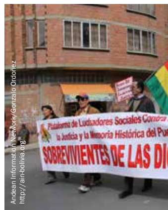
The 'Platform of Advocates Against Impunity and Bolivian Dictatorship Survivors' demands the recognition of dictatorship years, and an end to impunity for human rights abuses.

Recognition by the state of the abuses and the establishment of reparations for the victims – either monetary or in terms of assistance – were also part of the transitional justice processes implemented in these countries. These reparations have mainly been for individuals who were illegitimately deprived of their liberty and/or were tortured or were for the families of those who were assassinated or who were ‘disappeared’. Exile,