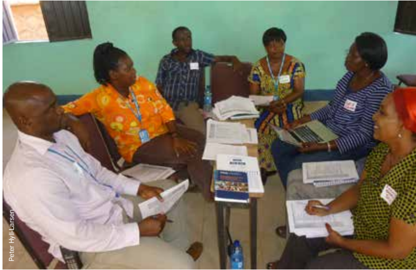
INEE contextualisation workshop in Dollo Ado, Ethiopia, 2013.

Standards Handbook over the course of two to three days. The small groups later reviewed each other's work and offered additional feedback and ideas to strengthen the content. Participants also drafted a list of practical ways that they would use the contextualised standards to inform and guide education policy and practice in their work.