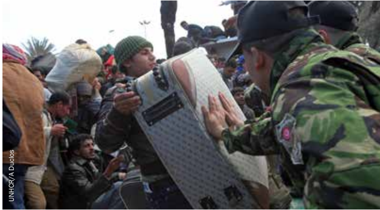
Tunisian border officials hold back the crowd at the Tunisia-Libya border in March 2011, where thousands of people anxious to leave Libya – principally migrant workers from Tunisia and Egypt – gathered in no-man's land.

should be established to ensure effective cooperation between relevant international agencies to assist and protect non-citizens displaced internally and across borders during crisis situations. Coordination between IOM and UNHCR during the Libyan crisis was a particular success but such coordination has certainly not been systematic, and it is neither predictable nor can it be guaranteed in future crises. Contingency planning should take place at a bilateral and regional level to ensure effective cooperation between states during evacuations of non-citizens from crisis situations.