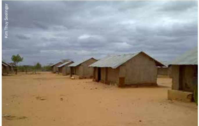
Safe Haven shelter in Dadaab refugee camp in Kenya, 2011.

Alternative purpose entities can provide important protection options on a short-