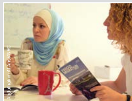
NRC staff in the Middle East

To make a donation, please visit www.fmreview.org/online-giving