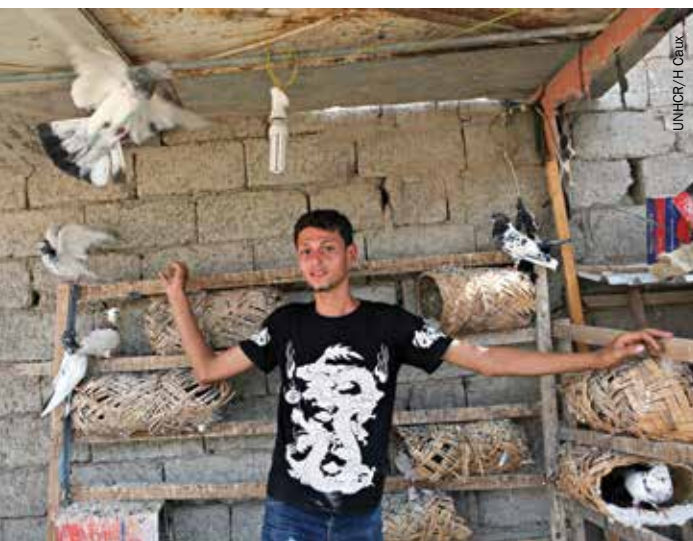
A young IDP feeds his pigeons in Resafa district of Baghdad. "I don't go to school and there is no job for me here."

Throughout their existence, both of these institutions have been subject to considerable criticism inside and outside Iraq, usually focusing on shortcomings in effectiveness,