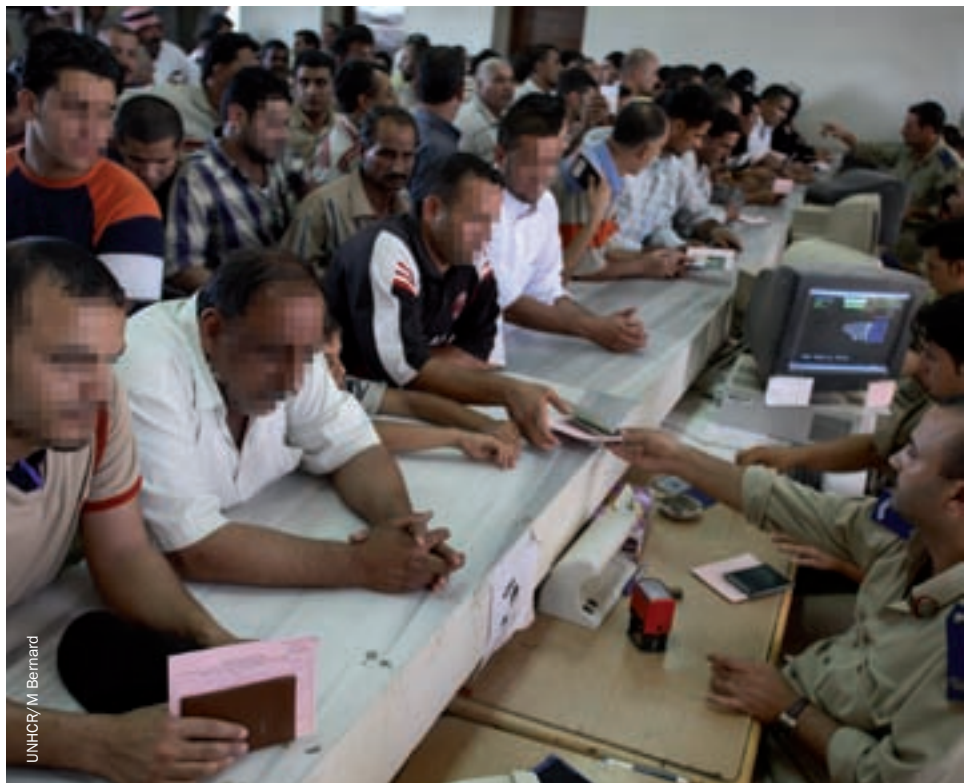
The long queue inside the immigration centre, Syria 2007.

insecure areas in Baghdad toward neighbourhoods with improved services and security, as well as to locations with family, ethno-religious or tribal links outside the city. However, movements are not purely toward homogeneous areas, due to mixed marriages and increasing formal and informal restrictions on movement which limit the options available. As Iraq's neighbours impose more restrictive entry requirements, there is likely to be more pressure on internal displacement toward the north and those governorates offering better security and basic services.