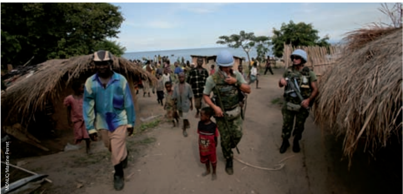
MONUC patrol (with Uruguayan soldiers) in a village in Ituri, DRC, 2006.

A major support for the cluster system in DRC is provided by common funding mechanisms – the Pooled Fund, augmented by the grant facilities of the Central Emergency Response Fund (CERF). 3 The DRC Humanitarian Action Plan (HAP) 4 – first launched in 2006 to replace the Consolidated Appeals Process (CAP) which was seen by many as a solely UN-driven document – defines the overall framework for humanitarian action. The identification of project priorities within the HAP is the task of the clusters. At the provincial level, the provincial inter-agency committees (CPIAs) are responsible for translating them into provincial packages. Clusters also need to provide guidance and analysis on