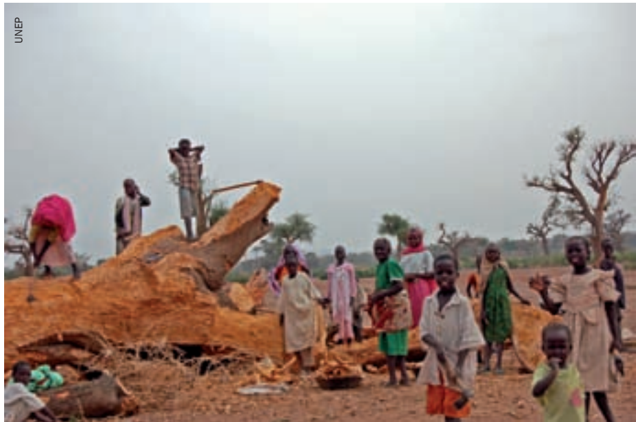
Camp residents in Western Darfur cut wood chippings from a fallen tree for cooking fuel.

of the humanitarian response extends well beyond camp boundaries, agencies need to intervene in local fuelwood resource management. To be effective, this requires both technical expertise and a participatory approach.