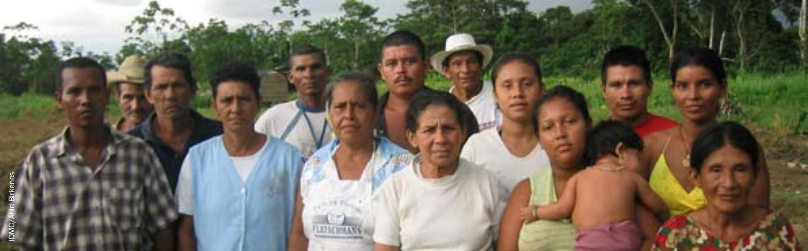
IDPs in a Humanitarian Zone in Chocó, Colombia