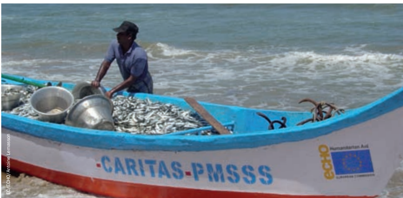
Post-tsunami assistance by the European Commission through NGOs, Tamil Nadu, India

As noted in FMR28, 13 there is a lot of talk about capacity building of national NGOs but people mean different things by the term and its