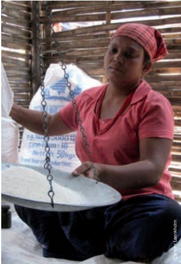
Bhutanese refugee distributing food to other refugees, Timal camp, Nepal