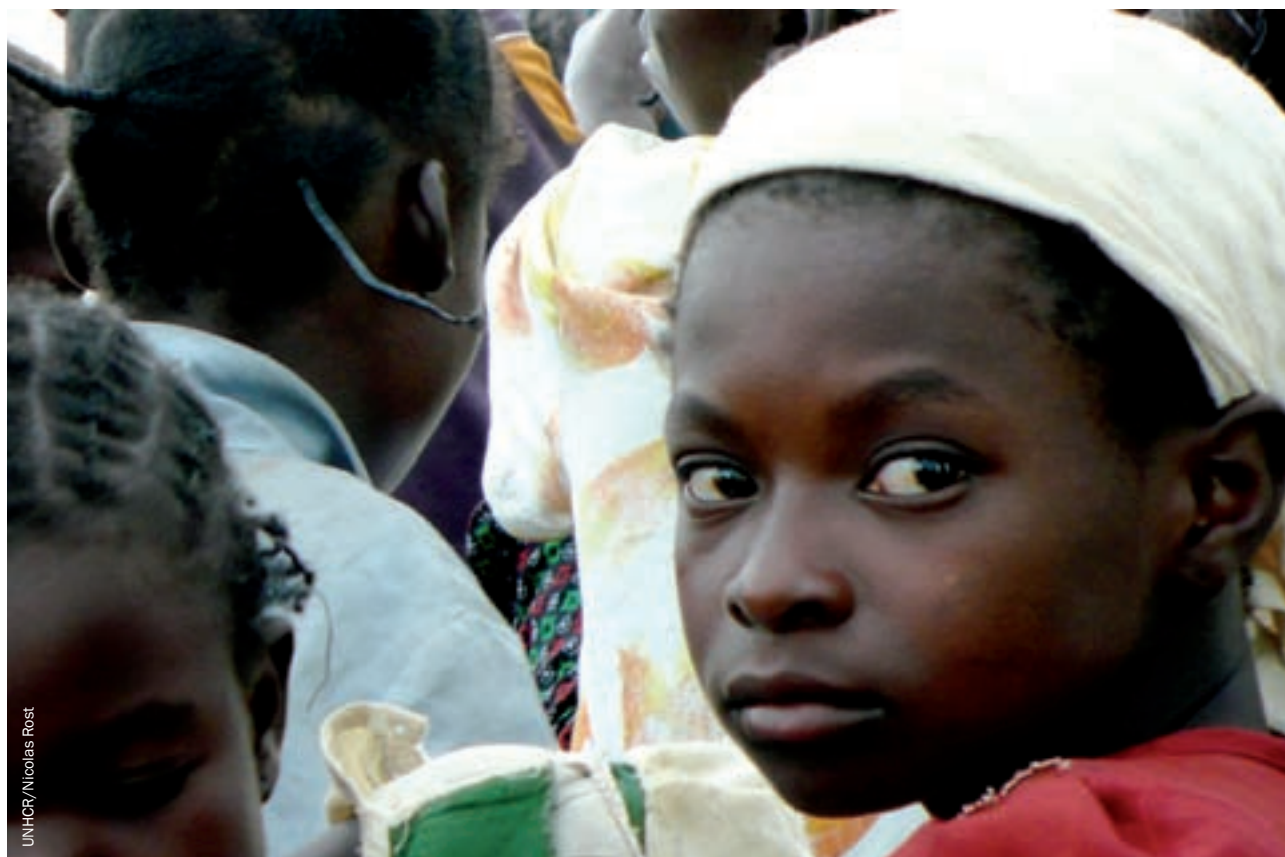
A displaced girl in a temporary school near Paoua, CAR, opened by UNICEF and COOPI (Cooperazione Internazionale) in the bush as families are too afraid to send their children back to their home villages, August 2007.

In CAR we became aware very quickly that NGOs are disadvantaged by not being able to apply to the CERF. But they can benefit. In CAR’s capital, Bangui, UNDP applied for funding on behalf of NGOs and managed its receipt and disbursement. NGOs have told me that the process is working. At the same time, we have created a specific fund, known as the Emergency Response Fund or ERF, designed to cover NGO start-up costs and to cover gaps in response. Four donors have pooled $3.5 million into the ERF, which can disburse up to $250,000 in a matter of days, based on a one-page project proposal. CERF and ERF proposals are vetted by clusters before being submitted to the Humanitarian Coordinator for approval. As such, projects have the