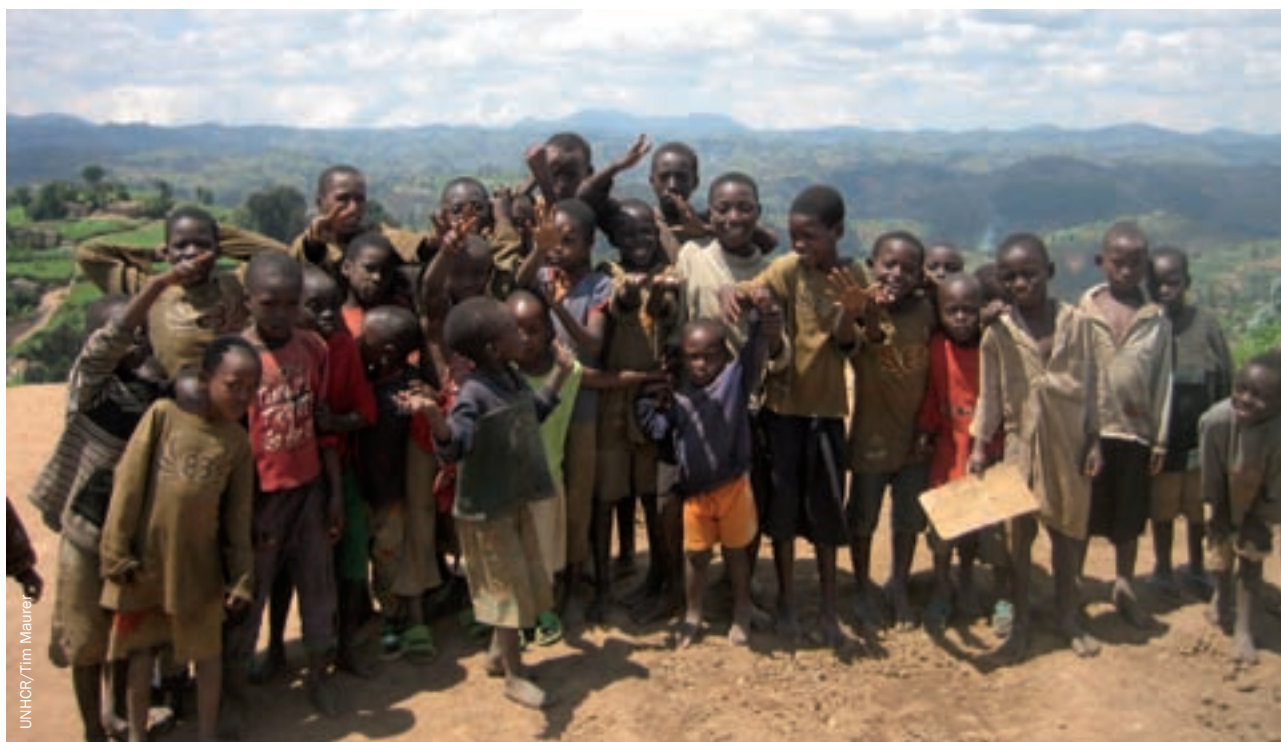
Kigeme refugee camp, Rwanda, 2006.

The UN family in Rwanda already has a common security policy. Using synergies by sharing fuel, travel, garage, office and transport facilities has been identified to further enhance effectiveness. At present, resources cannot be used jointly since the UNHCR office in Kigali is located a few kilometres away from the other UN agencies. Having joint premises and sharing resources in the capital