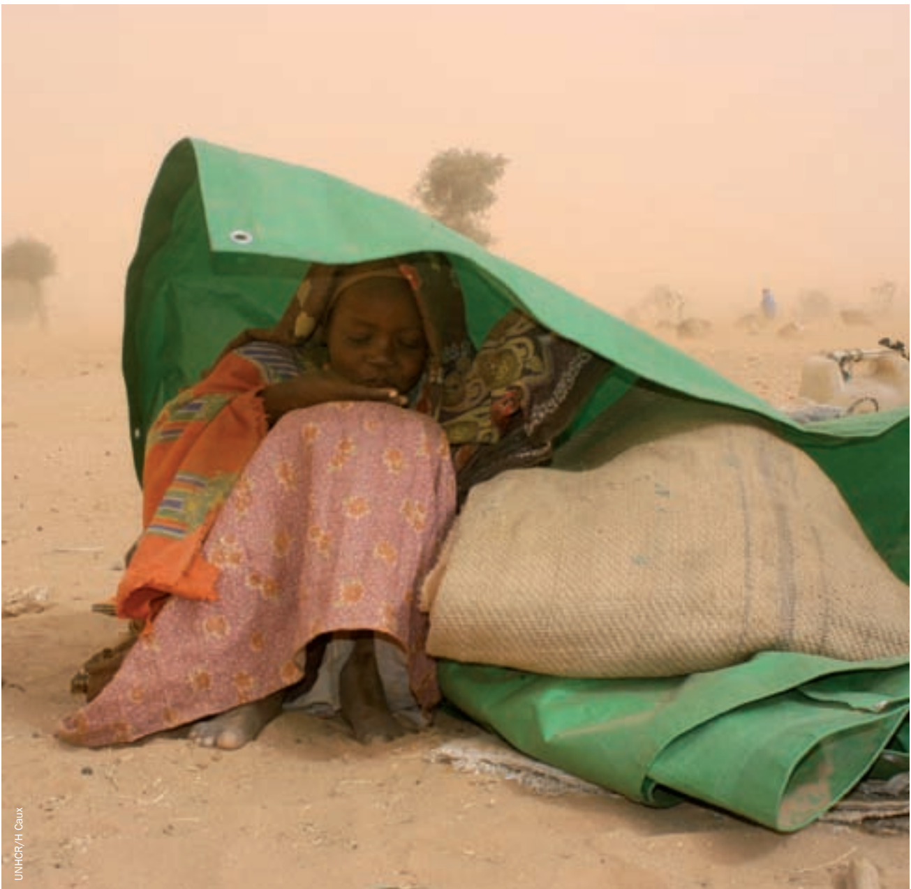
A refugee from Darfur seeks shelter from a sandstorm near the Chadian border town of Tine.