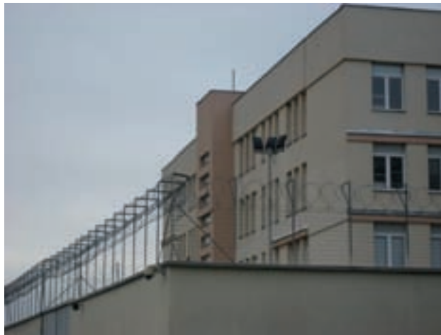
Busmanci detention centre for undocumented immigrants in Sofia.

Those relatively fortunate asylum seekers who are not detained are required to go to the State Agency for Refugees and beg for a date simply in order to begin the asylum process and receive basic and much-needed assistance and protection. Those detained for entering Bulgaria 'illegally' wait for months in detention until their applications are registered. Applications are sent regularly in the hope of receiving official attention but are not considered unless they