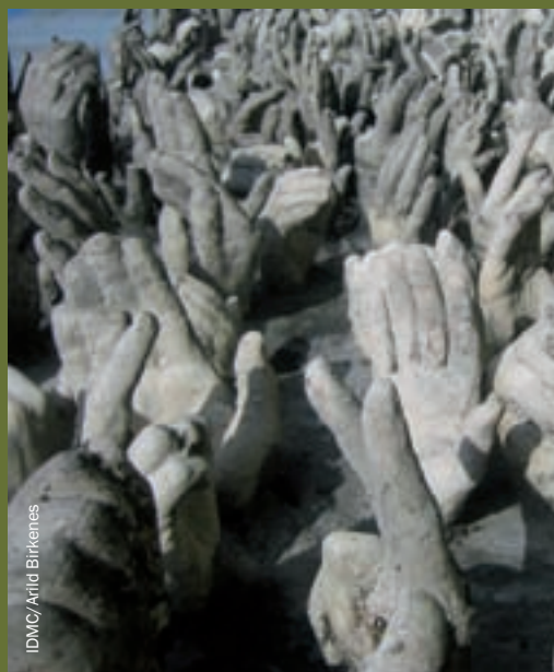
Memorial sculpture in honour of 83 community members killed or disappeared in Cacarica, Chocó, since 1997.

For more information, see the IDMC's report 'Resisting Displacement by Combatants and Developers: Humanitarian Zones in North-west Colombia', online in English and Spanish at www.internal-displacement.org/countries/colombia . To read or hear the life stories of people displaced in Colombia, visit www.idpvoices.org .