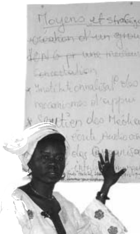
Participant at Kigali Conference

While this greatly constricts women's rights to land, property and housing during times of peace, in the post-conflict situation - upon the death of a husband or male relative - these limited land, property and housing rights are eliminated. Furthermore, though traditionally widows were permitted to stay on the matrimonial land and in the home until death or remarriage, today male heirs prefer to sell off the land and housing for