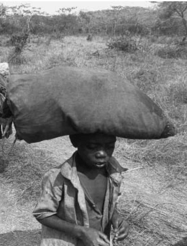
The Rwandan conflict left few families intact; many are now headed by single parents, primarily women.

There has been some follow-up since the Consultation. At the international level, human rights and women's rights groups have been lobbying since 1999 to have a resolution on women's rights to land, property and housing adopted by the UN Commission on Human Rights. Such a resolution would be the first pronouncement by this important human rights body on women's rights to land, property and housing and would reinforce resolutions on this same issue adopted by its sister body, the UN Sub-Commission on the Protection and Promotion of Human Rights. 9 According to the UN Centre for Human Settlements, at the national level, many individuals and organizations that participated in the Kigali Consultation continue to struggle to have women's rights to land, property and housing recognized and enforced. Activities have included political lobbying and advocacy, and education and training. In Colombia, for example, an open letter was written (to organizations such as NGOs, human rights institutions and other civilian bodies), encouraging the inclusion of women guerrillas in the peace dialogue. Now that the Secretariat of the Women for Peace Network has established its Secretariat in the Arias Foundation in