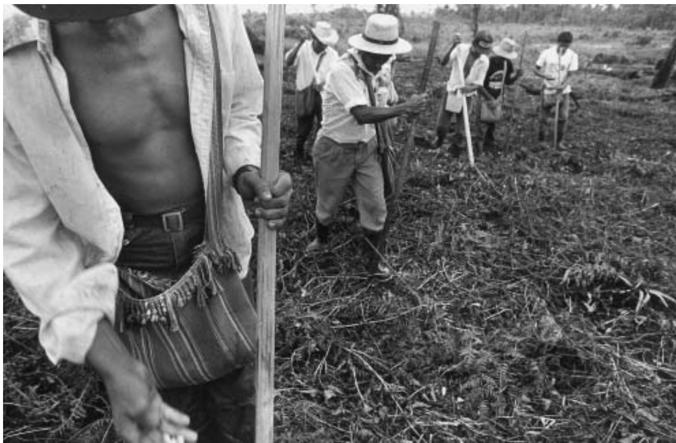
UNHCR/26209/12. 1996/IB Press

No international instrument, including the UN Guiding Principles on Internal Displacement, addresses when an IDP ceases to be such. It is curious that an