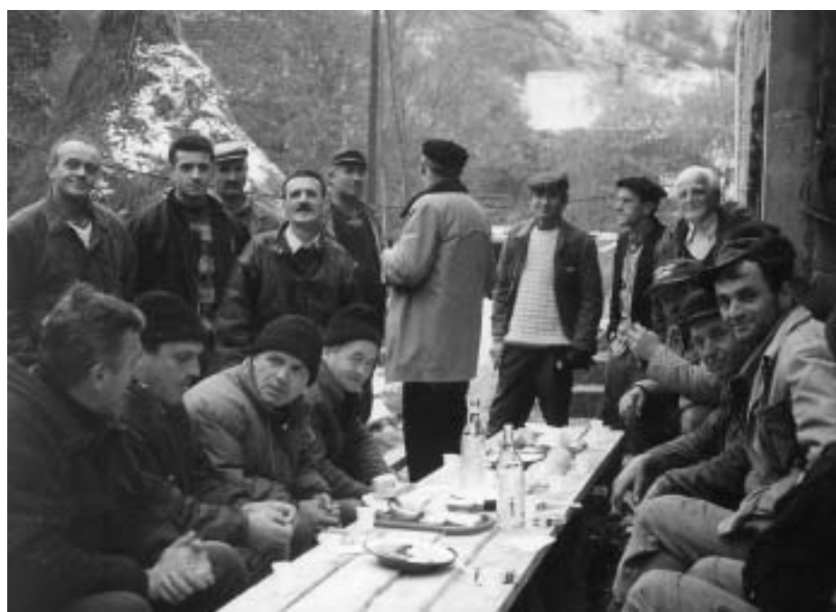
A Muslim returning family invites their Serb and returned Muslim neighbours to dinner.