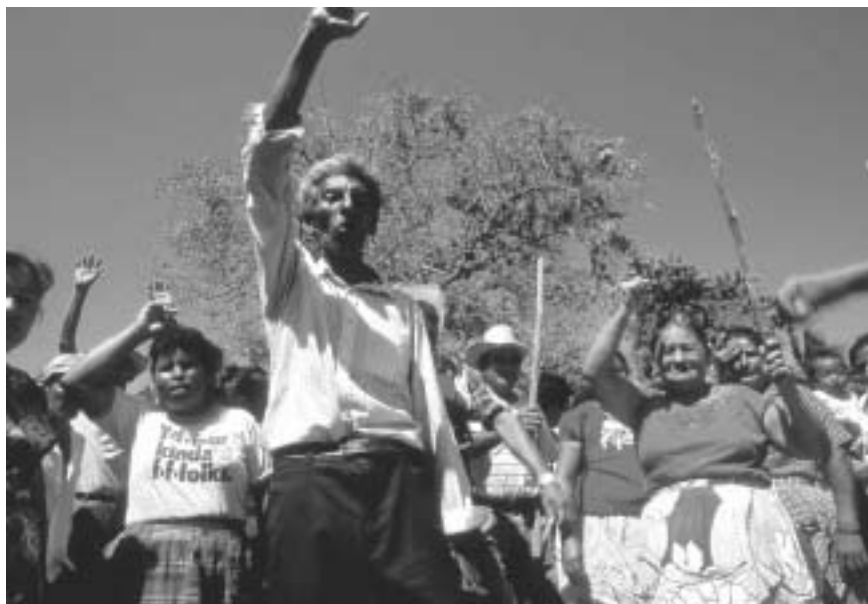
Campesinos defend occupied land against eviction by Guatemalan police.

Given that agriculture is the primary form of subsistence in Guatemala, the state's failure to respond to restitution claims by the dispossessed is a form of discrimination which may at best be categorized as promotion of impunity and at worst as a form of persecution threatening the survival of large sections of the rural population. 7