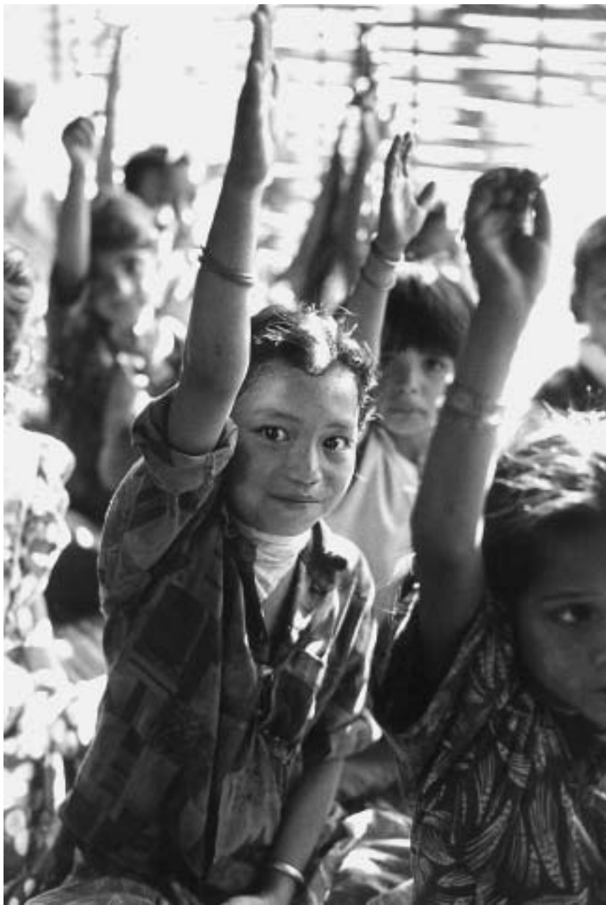
Primary school (run by refugees) in Sanischare camp, Nepal.