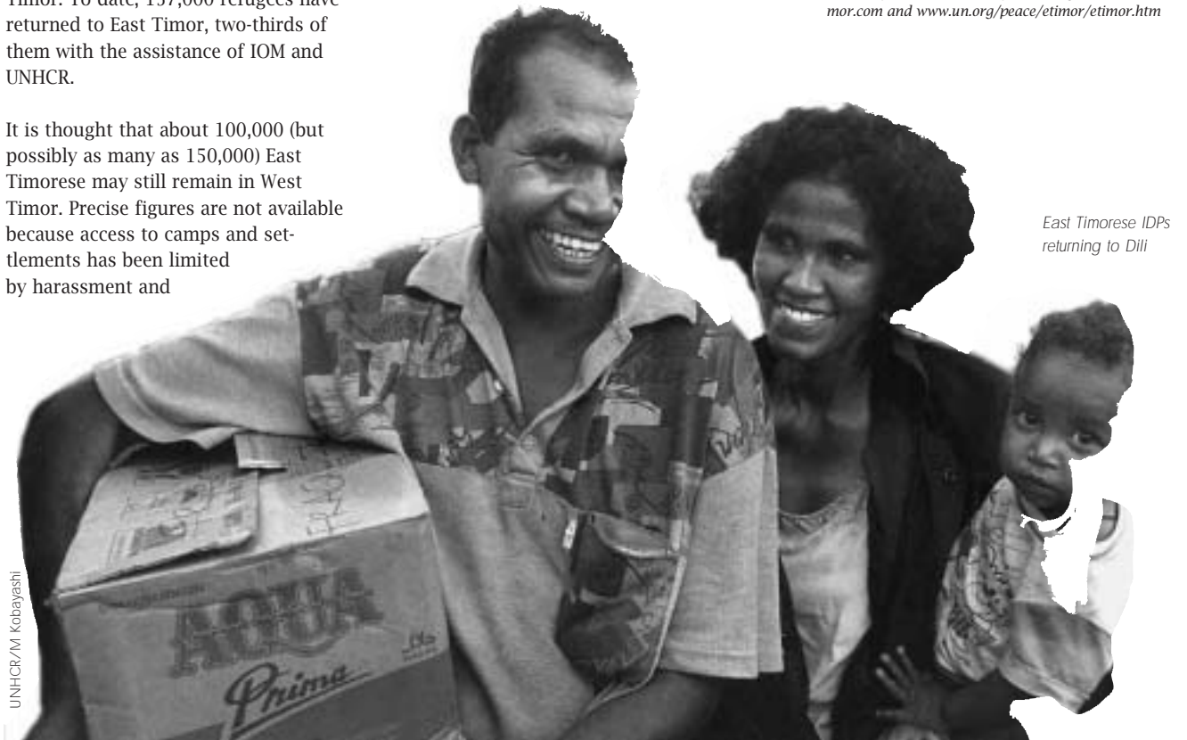
East Timorese IDPs returning to Dili

Latest information is at: http://etan.org ; www.easttimor.com and www.un.org/peace/etimor/etimor.htm