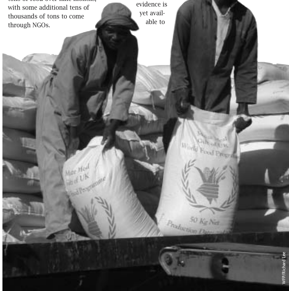
Bulawayo warehouse, Zimbabwe

As with most large-scale food interventions, the US Department of Agriculture (USDA) was to provide the majority of in-kind contributions in the form of whole maize. What they had not anticipated was the rejection of this food aid by some governments because it was genetically modified. It was difficult to distinguish political manipulation and obfuscation from genuine environmental, health and economic concerns. There were political interests on both sides of the debate. The USDA clearly did not want to create a precedent for governments to reject its food surplus exports as aid. WFP's official policy is essentially one of neutrality, stating that the acceptance or rejection of any such food donations is the prerogative of the recipient government. A UN joint statement of 27 August 2002 on the use of GM foods in southern Africa went further by indicating that no scientific evidence is yet available to