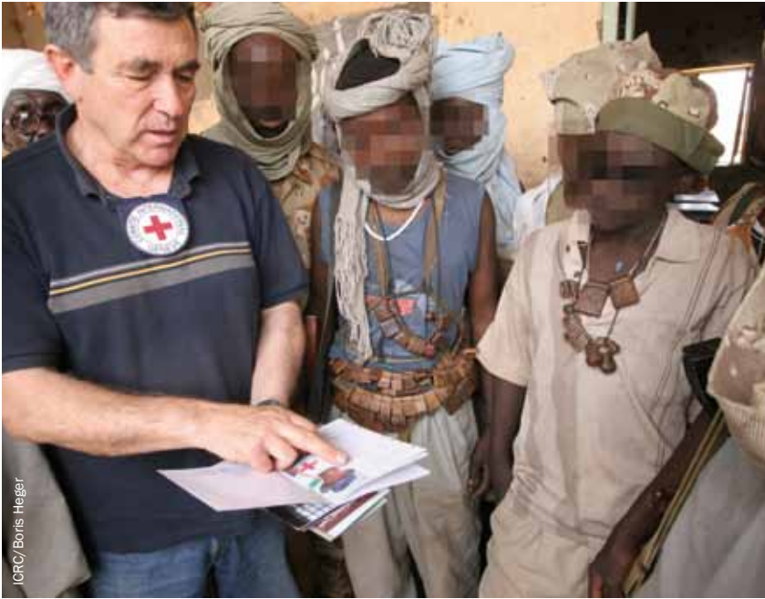
ICRC dissemination session for Sudanese Liberation Army combatants in Durum, Darfur.

more power over their fighters than any humanitarian worker has.