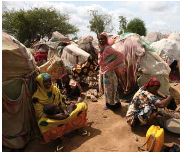
Sheikh Omar IDP camp in Jowhar, Somalia.