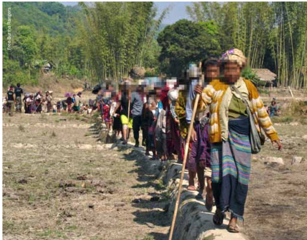
Free Burma Rangers

held in November 2010 were as corrupt as most people expected and set continued military rule in stone. However, parallel to this, many foreign donors and governments have noted the military loosening its grip on civil society, opening up an unprecedented amount of space for humanitarian support and development. In parallel with this, however, all NSAGs have been ordered to incorporate their members into the Burma Army as 'border-guard forces', triggering a new series of threats to civilian communities and little hope for reconciliation between the military and NSAGs or their civil sectors. The majority of NSAGs have refused to be incorporated into the Burma Army and now anticipate