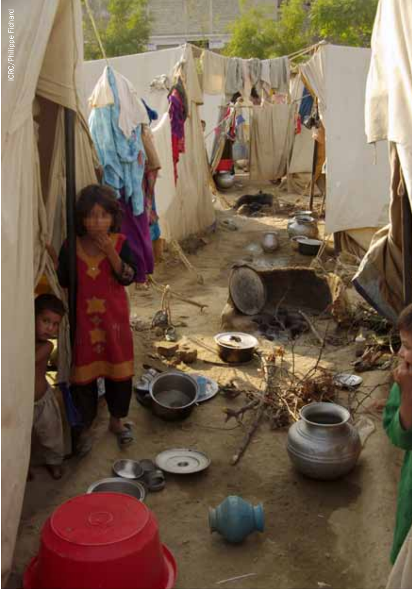
IDP camp established in a school, District of Dir, North West Frontier Province, Pakistan.

prevalent in the years leading up to the recent displacement crisis, with more than 200 schools destroyed in that district alone by the end of 2008, of which 95% were girls' schools. An estimated 50,000 students were deprived of education as a consequence. And a Save the Children UK survey of a school in Kandahar, Afghanistan, found that "only about half of the girls attend school daily due to on-going threats on their lives." 3 Attacks on schools or other facilities ordinarily used by children are prohibited by international law – yet they continue.