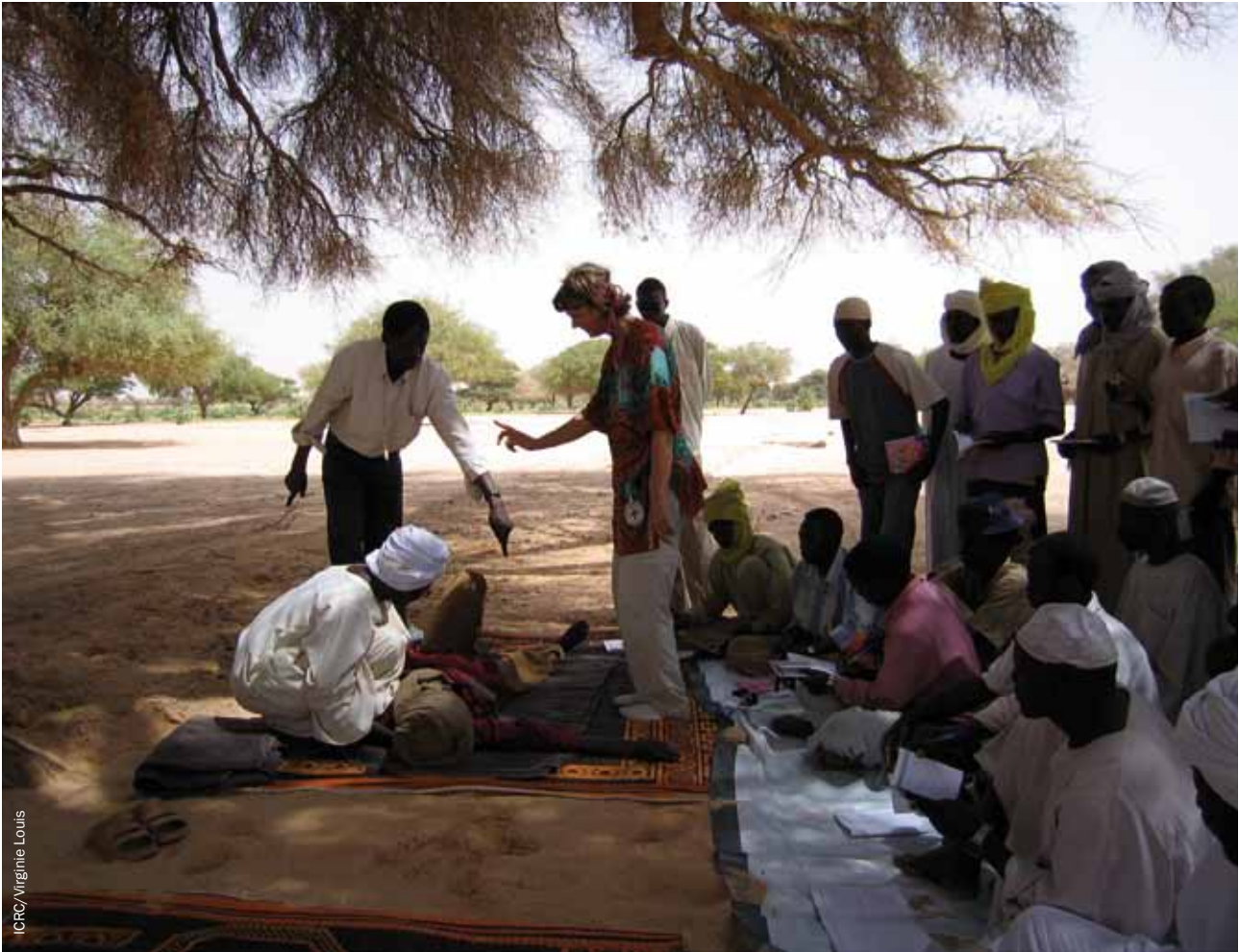
In Muzbat, northern Darfur, ICRC provides first-aid training sessions for fighters from the Sudanese Liberation Army and civilians from the village area. It is also an opportunity to talk about the law of armed conflicts and explain the basic principles of International Humanitarian Law.

fighting. Some seek to overthrow the existing government or at least to form part of a future administration. And, in certain cases, ANSAs may wish to be seen as more respectful of international norms than the state that they are fighting. 3 Finally, some armed groups are sensitive to the argument that better respect for norms applicable in armed conflicts facilitates peace efforts and strengthens the chance of a lasting peace.