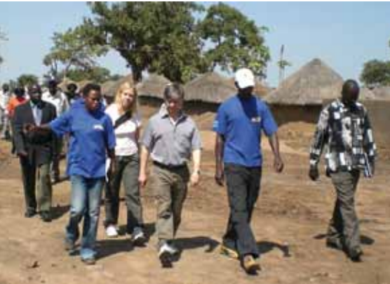
IDP camp being dismantled, Gulu, Uganda, July 2009.

Pakistan which deny that people displaced by military operations are IDPs but overall I felt a growing willingness of governments not only to discuss IDP issues but also to take at least some steps to better assist and protect them. Some countries, in particular Georgia and Azerbaijan and to some extent also Bosnia, Serbia and Colombia, have started to address their protracted displacement situations with measures to improve the living conditions of their IDPs while awaiting return or other durable solutions; however, problems remain, particularly in the area of livelihoods and for IDPs with special needs.