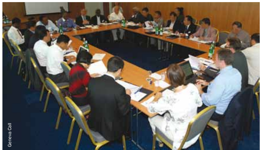
One of the working groups at the 2nd meeting of signatories to Geneva Call's Deed of Commitment on AP mines, June 2009.

Every new signature to the Deed of Commitment is preceded by a period of dialogue with