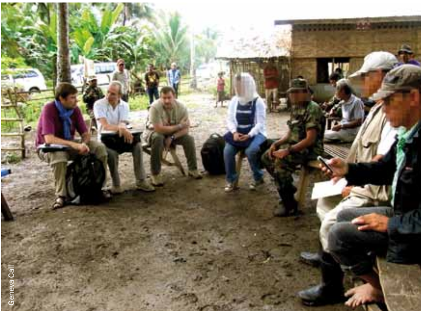
A Geneva Call fact-finding team investigating allegations of mine use in the Philippines in a meeting with representatives of the Moro Islamic Liberation Front.

Armed groups cover a wide spectrum. While some may be little more than mobs brought together by circumstances, others control tens of thousands of fighters. Many armed groups administer substantial financial resources – they can often outspend NGOs – and their leaders may be highly educated. Because armed groups are structured organisations, they are capable of taking decisions which affect the behaviour of their members, who are under pressure to conform and to follow orders. However imperfect or weak these organisations may be, they have