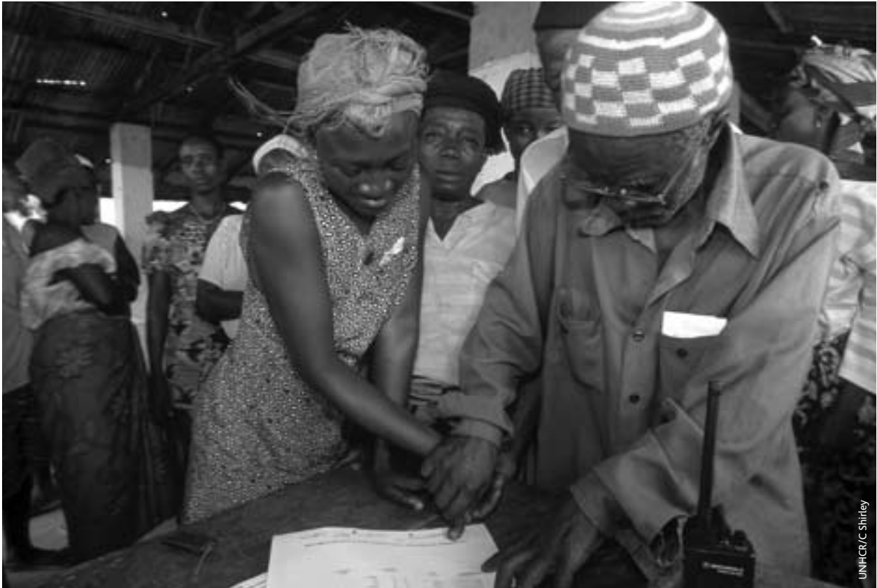
Refugees from Sierra Leone register for voluntary repatriation, BO Waterside camp, Liberia.