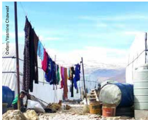
Beka'a Valley, Lebanon.

who live in tents) pay rent, at an average cost of US$189 per month. Eviction is a major fear due in large part to difficulties in affording rent. Health care is also a major expense and concern, as health insurance provided through UNHCR covers only 75% of costs (and then only for life-saving procedures and obstetrics). Cash-based humanitarian assistance meant to alleviate these financial burdens is neither sufficient nor provided to all refugee households. Over 70% cent of Syrian refugees in Lebanon live in poverty and households have on average debts totalling $857.