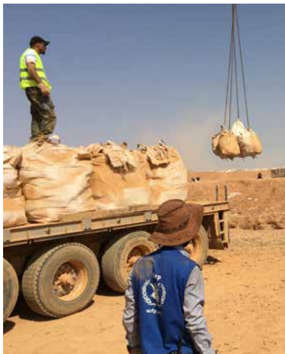
UN agencies deliver relief to Syrians stranded at Syria-Jordan border, August 2016.

Only a small minority of Berm residents can cross into Jordan, either for emergency treatment or for settlement in the Azraq refugee camp some 300km away. On average only three Berm families per week are allowed through the Bustana or Ruwayshid Transit Centres for settlement in Jordan. And, citing security concerns, of these few allowed into Azraq, only a quarter are settled with the camp's general population; most are confined to Villages 2 and 5 where they have severely restricted access to the outside world.