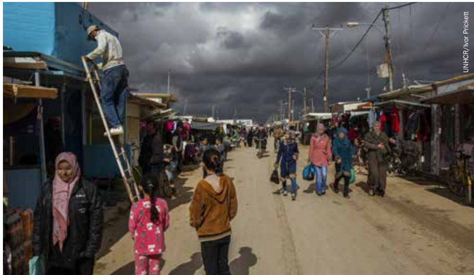
The 'Shams-Élysées', Za'atari refugee camp.

to the resilience of its entrepreneurial camp dwellers. But the camp's humanitarian governance also played a key role in this, as public spaces for refugees were allowed to form on an impromptu basis using facilities provided by non-governmental organisations (NGOs) such as schools, bread distribution centres and medical clinics. When the first arrivals took advantage of regular foot traffic along the camp's main road to open up independent shops, creating what is known as the Shams Élysées (playing on the name of the Avenue des Champs Élysées, a prestigious street in Paris, with Sham meaning Syria in Arabic), UNHCR, the UN Refugee Agency, did not shut it down but rather negotiated with shopkeepers to regulate its size and electricity usage. In fact, NGOs make constant concessions to allow a degree of camp development that can be regulated for the sake of security but that allows