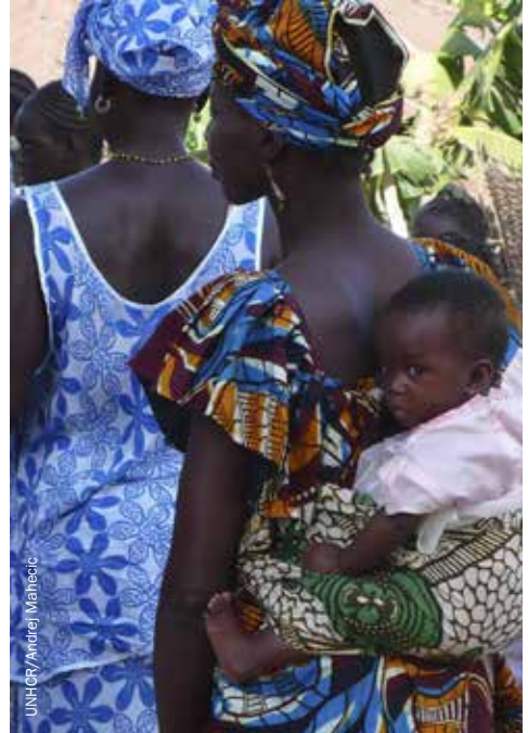
Senegalese refugees from Casamance wait for food distribution, in the Gambia.

The host communities’ own poverty and their dependence on subsistence farming, however, led non-governmental organisations (NGOs), in conjunction with UNHCR, to divide responsibility for the provision of aid for the refugees and the host communities at the time, although some provision – such as wells and communal