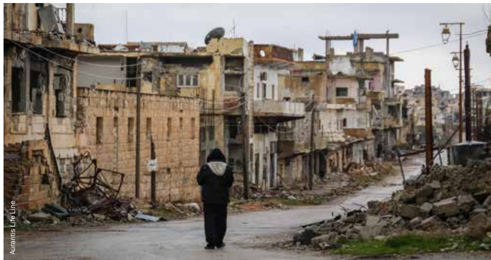
Auremis Life Line

The future return of IDPs and refugees to their communities of origin inside Syria is likely to result in a very high number of competing claims over the use and occupancy of land and property by original owners, secondary occupants and illegal occupants. Throughout the course of the conflict property transactions have continued to take place, often as private contracts or agreements between individuals that are not recorded in statutory systems. Many owners have sold property due to financial pressures. In addition, there have been forced evictions, expropriation and property transactions made under duress. Secondary occupation and land and property disputes