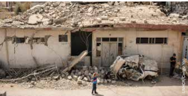
Badly damaged houses in the Al-Resala neighbourhood of west Mosul, Iraq.

coupled with the uncertainty of the process in general, opens the door to further conflict. Additionally, if there are no steps in place to ensure arbitration and appropriate restitution or compensation, a returns process may exacerbate competing claims over land rights.