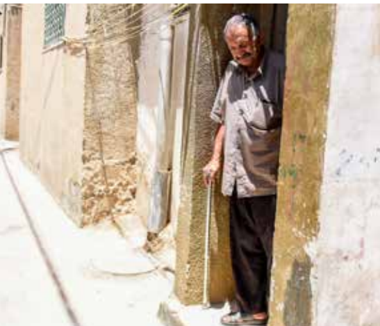
65-year-old Syrian refugee living in Jordan with his wife; both have disabilities.