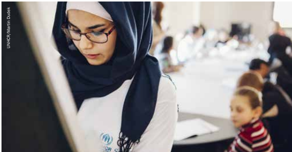
A young Syrian refugee who is an Outreach Volunteer specialised in education leads a homework support group session for refugee children in Lebanon.

as helpless victims. Several use images of a miserable Syrian child, usually in a refugee camp. This is, depressingly, despite years of campaigning in the 1980s and 90s to encourage more respectful use of images. When asked in informal discussions about the use of such images, some international humanitarian workers expressed their disagreement with their organisation's policy, while others argued that humanitarian organisations' success in raising funds arguably remains significantly dependent on portraying refugees in situations of despair and destitution and as being greatly in need of international assistance.