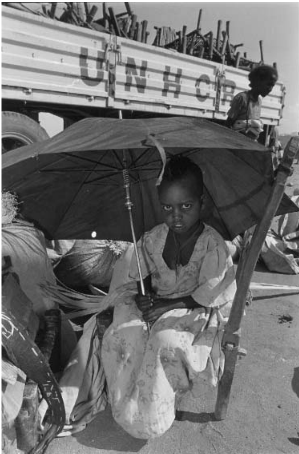
IDPs being moved from Jegga Camp (where they have lived for two years) to Shelab Camp, Eitrea.

The overall response to a problem of enormous magnitude is woefully inadequate. Serious gaps in the UN and agency operational response to the needs of IDPs – including their protection - and continuing funding difficulties have plagued the international response.