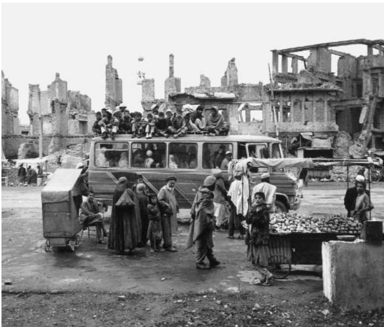
IDPs and returnees in Kabul, Afghanistan.