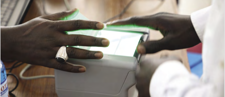
Taking fingerprints as part of a UNHCR organised registration process for refugees living in Senegal, March 2022.

This issue of FMR aims to explore the double-sided nature of digital technologies and their implications for displaced people across the globe. Submission deadline – 15 October 2023 Publication date – April/May 2024 • www.fmreview.org/digital-disruption