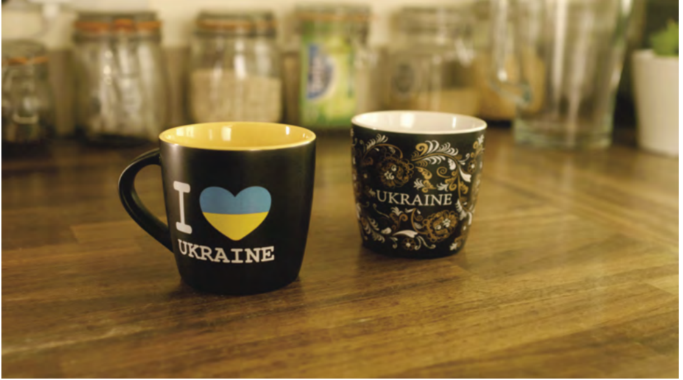
Gifts brought by Ukrainian refugees for their hosts in the UK.