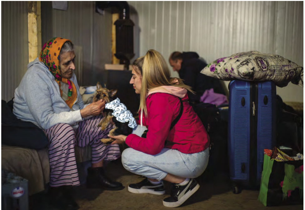
Ukrainian Refugees waiting at the Ukrainian-Romanian border checkpoint Porubne-Siret, March 2022.

www.fmreview.org/ukraine/bratanovavanharten