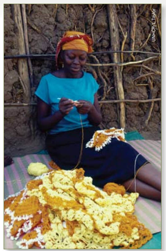
Member of a women's group crocheting, Kakuma camp

thought and that enabled refugees to reflect on their refugee life and even gave them the opportunity to laugh at their misfortunes.