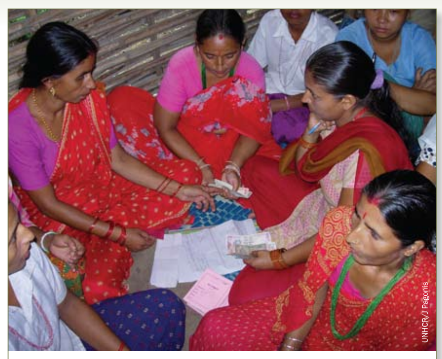
Bhutanese refugee women in Timai camp, eastern Nepal, participate in a microcredit scheme, which offers loans to start small businesses.

there are many occasions when they need sums of cash greater than they have to hand, and the only reliable way of getting hold of such sums is by finding some way to build them up from their savings."<sup>3</sup> Appropriate financial services for the poor, including protracted IDPs, should therefore promote savings as a means to build wealth and to make these lump sums available when needed in a safe, convenient, flexible and affordable way.