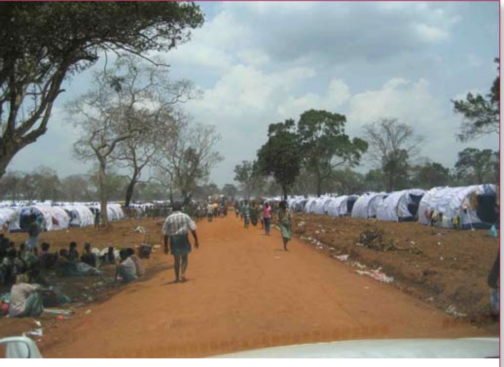
Menik Farm in Vavuniya District, Sri Lanka.

As of mid-July 2009, there were 30 IDP camps, run and guarded by the military, in the districts of Vavuniya,