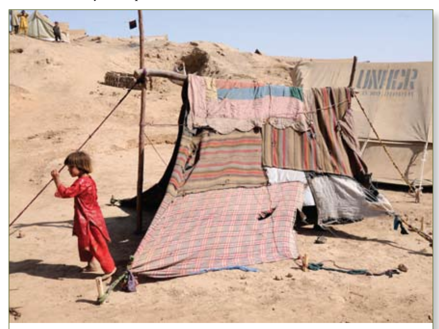
After 23 years of exile in Pakistan, in October 2008 Qayum and his family returned home to northern Afghanistan after negotiating to buy land in Sholgara district. When a local tribe refused to let Qayum and his neighbours unload their trucks, the provincial authorities moved them to their current site at Mohajir Qeshlaq. The government has promised them land but until individual plots can be demarcated and distributed, nobody can build. This means that all the returnees – some 150 families – had to spend the Afghan winter living under canvas.

It is necessary to understand, differentiate and disaggregate the needs of Afghan refugees depending on the reasons for and circumstances of displacement, the length of time they have been displaced and the reasons why most refugees in both Pakistan and Iran (and further afield) do not show a strong desire to return home. Refugees are rational actors, deciding to return only after a careful calculation of costs and benefits, including not simply the situation at home but also their experience abroad (the latter often overlooked). For example, the notion of 'home' is often transformed during long-term displacement. It is important for both refugees and humanitarian actors to distinguish between a nostalgic longing for what once was home and a more rational attachment to more than one country.