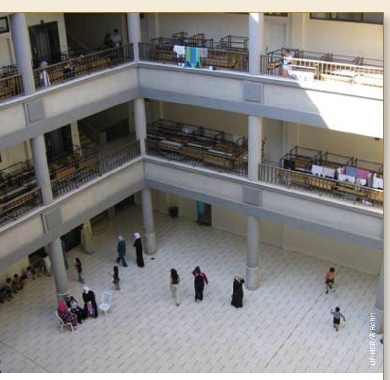
Some 500 Lebanese refugees fleeing violence sheltered in Al-Shariya High School, South Damascus, Syria.

Camp management has developed as a key concern within the humanitarian community as part of the humanitarian reform agenda, alongside the more traditional sectors in emergencies. However, most of the tools and guidelines – including the Camp Management Toolkit, UNHCR Emergency Handbook and Sphere standards<sup>1</sup> – assume a traditional camp setting. Although reference is made to different kinds of settlement options, a differentiated approach to them is rarely offered. Collective centres