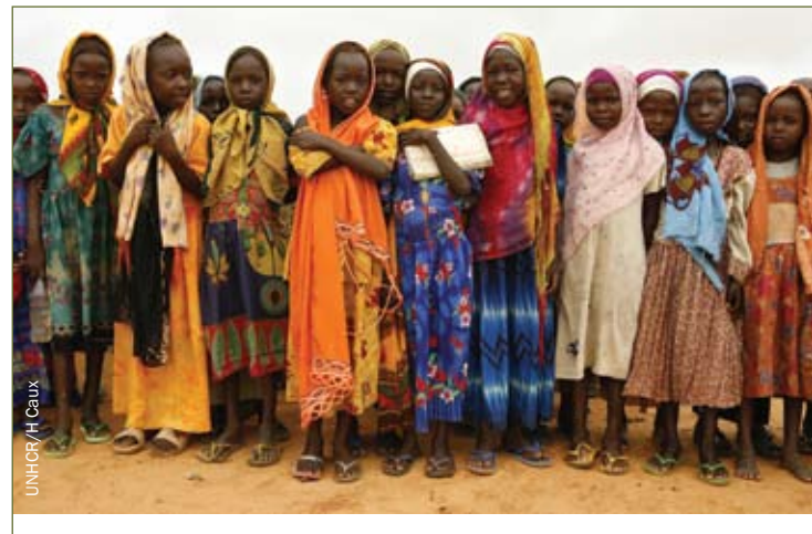
Young Darfuri refugees gather in Djabal camp, Chad, to register for the next school year.

Networks and structures have changed to the point that confidence about the future is not assured and 'warehousing' – "the practice of keeping refugees in protracted