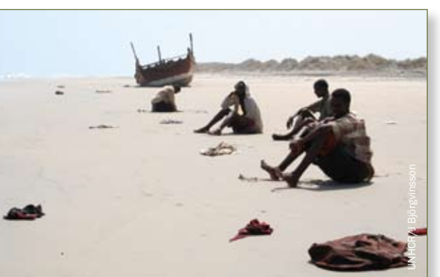
Exhausted survivors of smuggler-organised crossings of the Gulf of Aden wait for help on a beach in Yemen.

Asylum and migration are currently considered as separate policy areas. Refugees are seen as lacking agency, mostly not doing but being done to; they are forcibly displaced and in need of protection. Migrants are seen as voluntarily migrating and