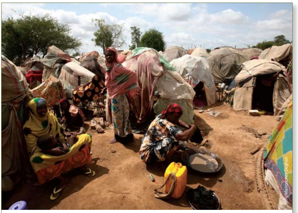
Displaced woman and children at Sheikh Omar camp in Jowhar, Somalia.

However, the international response to the problems faced by Somali refugees did stagnate, dominated by strategies for containment which stifle the life chances of large numbers of people in limbo for nearly two decades. The lack of political will from Kenya and other members of the international community has been a key reason for the failure of initiatives such as the Comprehensive Plan of Action for Somali Refugees<sup>3</sup> in the mid 2000s.