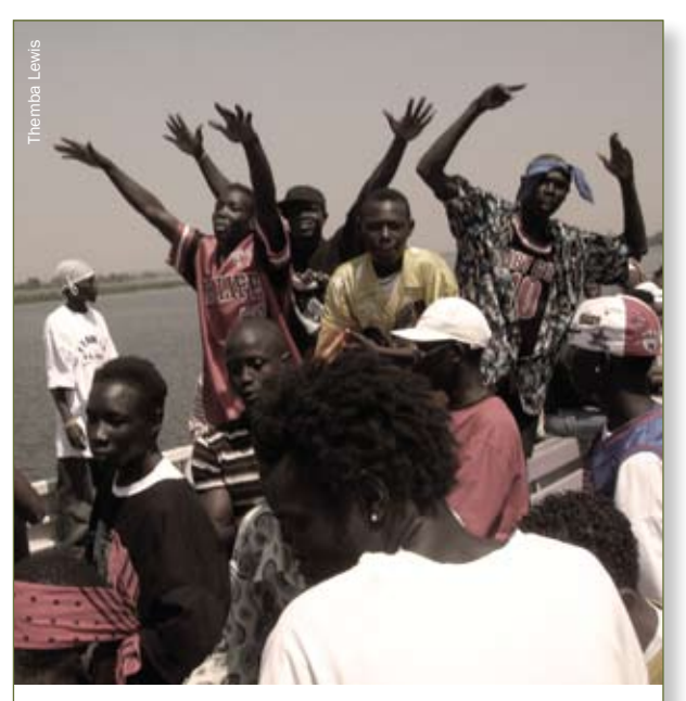
Sudanese refugee youth party in Cairo.

to affect their circumstances positively. As various efforts to change this have repeatedly failed, disenfranchisement has become entrenched and intractable. This may encourage the embrace of opposition as lifestyle. In a very real sense, gang membership in Cairo represents an assertion of control and pride in the face of circumstances of displacement that often suggest the opposite. Gangs provide an