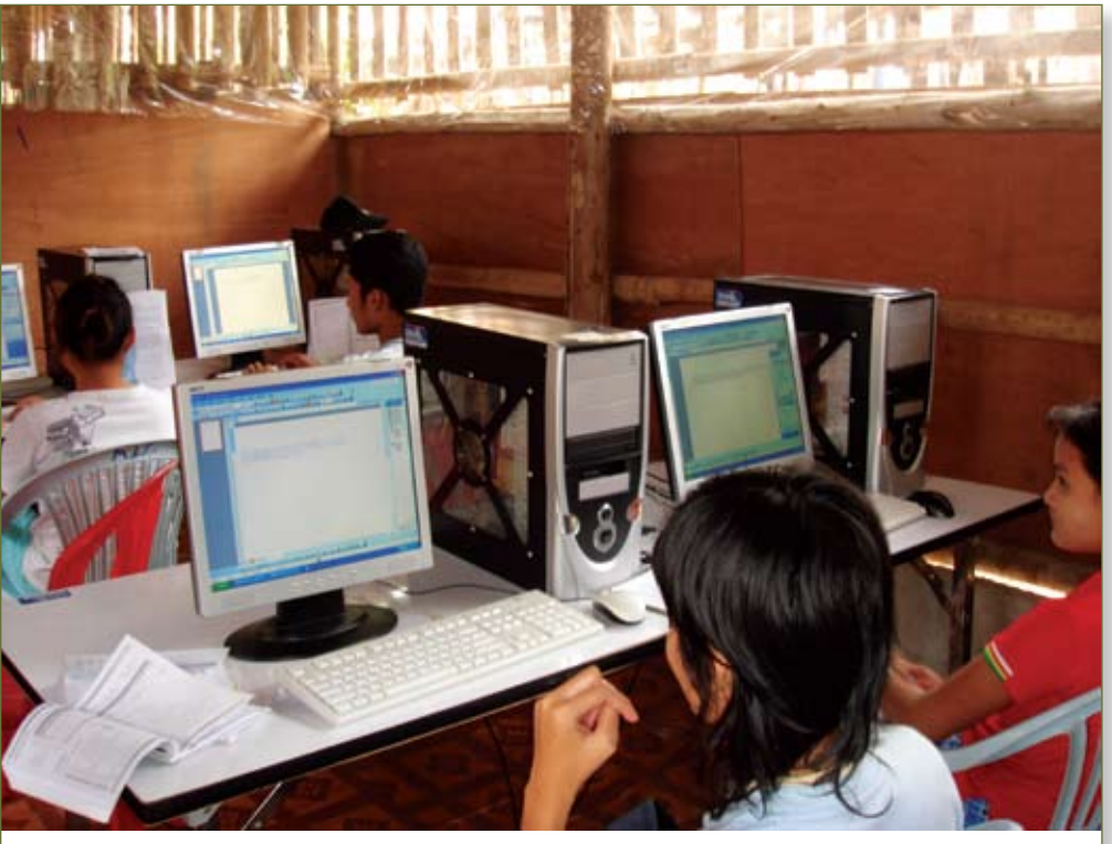
ZOA computer class, Mae La Camp, Mae Sot, Thailand. May 2008.

If they are to earn income for their families, support community