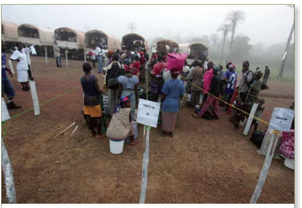
Voluntary repatriation of Liberian refugees from Sierra Leone, December 2004.

secure legal status (i.e. a status other than refuge status including residency and permission to work)