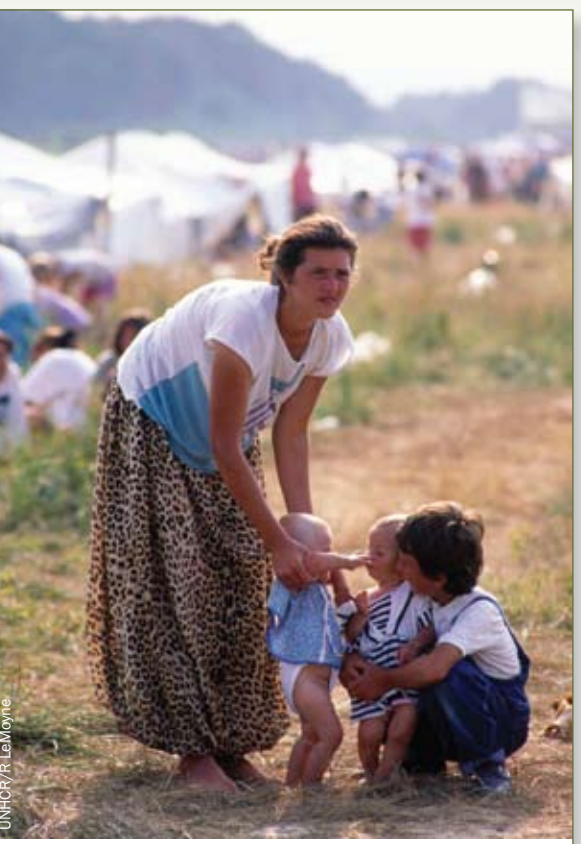
IDPs from Srebrenica, August 1995.

Supporting national efforts to resolve protracted displacement nevertheless will require a more comprehensive international effort. In BiH, UNHCR has been working intensively to