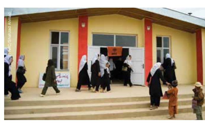
Returnee, IDP and local girls attending classes in a school built by the Norwegian Refugee Council in Maymana, Faryab Province, Afghanistan.

To date, an over-reliance on humanitarian interventions has characterised the response to the Afghan refugee situation and has compromised efforts to secure lasting and sustainable solutions. Increasing international interest in the situation of protracted Afghan refugees and the challenges surrounding return therefore remains of key importance and requires a renewed level of focus. Such approaches should be anchored in bottom-up programming principles and seek to distance themselves from any overt promotion of specific durable solutions. Instead, regional programming and advocacy in relation to