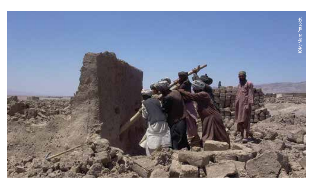
Dismantling shelters in Maslakh IDP camp, Herat City, western Afghanistan.

sites in their places of origin rather than in the cities where they are currently living.