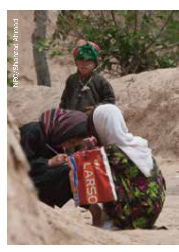
Returnee refugee girls doing homework. Maymana, Faryab Province, Afghanistan.

Drawing on qualitative research conducted with young Afghan women in Canada,<sup>2</sup> my opinion is that their return is not contingent on peace but