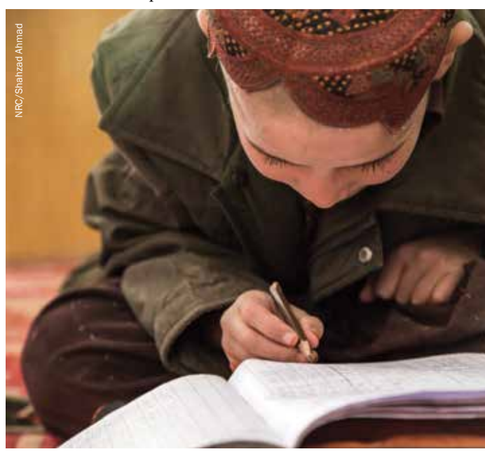
Afghan refugee child in a writing lesson at an Accelerated Learning Programme Centre, Quetta, Pakistan.

The voluntary nature of repatriation remains at the heart of Pakistan's new National Refugee Policy, reflecting a sense of realism among policymakers and an awareness that Afghanistan's poor law and order situation and shortage of livelihood opportunities remain two very significant hurdles to repatriation and sustainable reintegration inside Afghanistan. For Afghans to repatriate and reintegrate on a sustainable basis, the development of a conducive environment inside Afghanistan is imperative. The proposed development of 48 reintegration sites for returnees should therefore be given top priority by Afghanistan and the international community but so far very little progress on these has been made. Pakistan's new national policy stresses the importance of effective information-