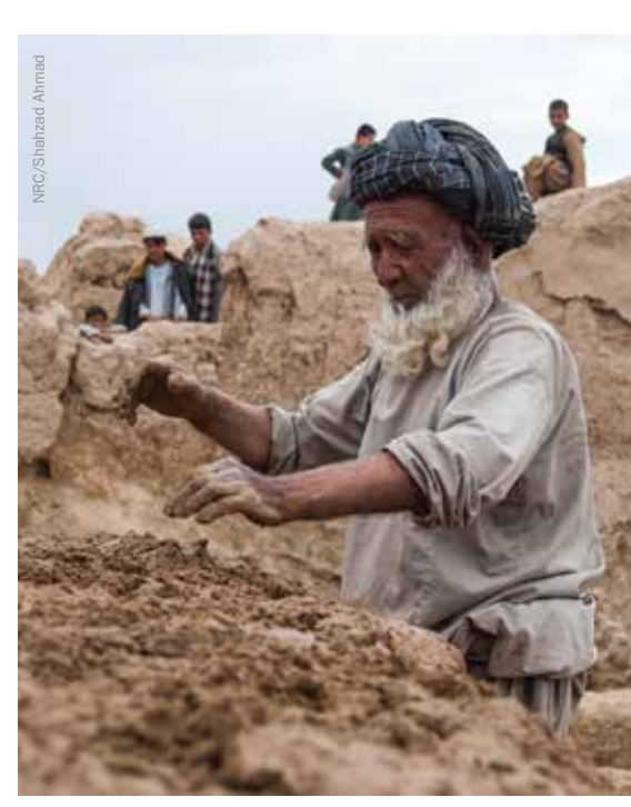
A returnee refugee re-builds his damaged house after years away. Maymana, Afghanistan.

Under the Tokyo Mutual Accountability Framework, donors promised US$16 billion in development assistance for Afghanistan from 2012 to 2016.<sup>4</sup> But the realisation of these aid pledges is conditional on Afghan progress in the context of a number of still unattained development benchmarks. This, coupled with shrinking aid budgets in the western world, means that Afghanistan faces significant decline in external assistance – in a context where by 2013 foreign aid represented 70%