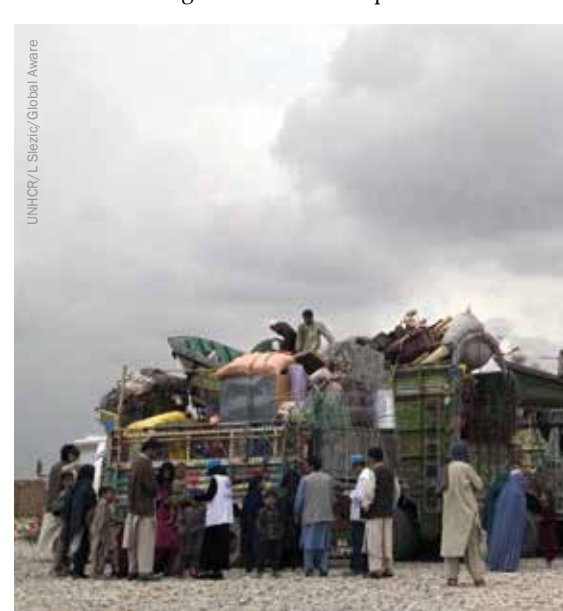
Afghan refugees returning to Afghanistan in 2004.

Further analysis shows that the reasons for the initial migration have an impact