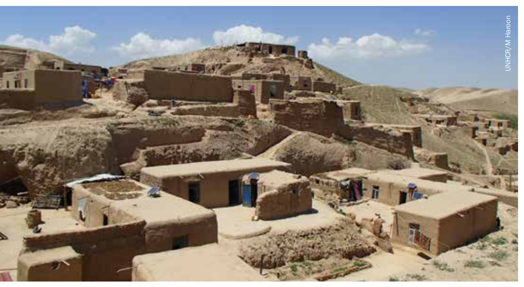
The village of Mahajer Qeslaq, in Balkh Province, built for returning refugees from Pakistan and including solar lighting.