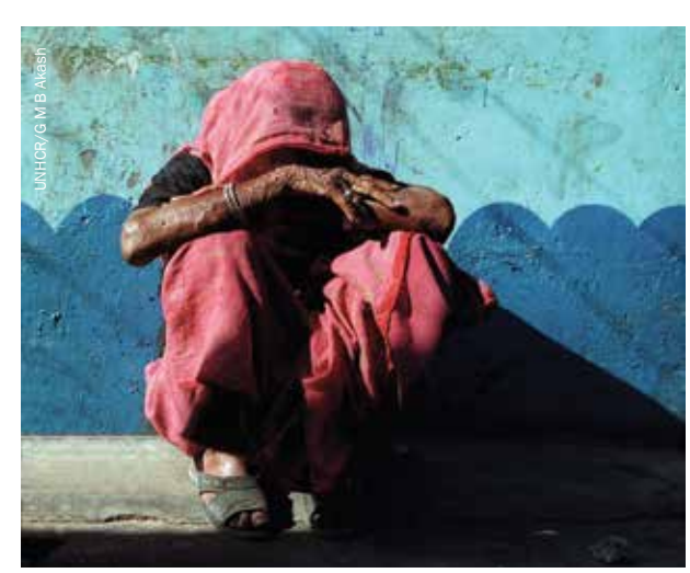
After confirmation of their citizenship, Biharis in Bangladesh can now have hope of leading a normal life after decades of exclusion.

Meanwhile, civil society engagement is expanding geographically and growing increasingly sophisticated. National and regional lobbying efforts are feeding an emerging global advocacy campaign to end all discrimination in nationality laws. Organisations concerned with promoting women's rights, fighting discrimination and addressing statelessness are joining forces to pursue the common goal of raising awareness of the impact of gendered nationality laws and pushing for their universal abolition.6 The women and their families who are affected by these laws worldwide are now being heard. Lessons are being drawn from the successes achieved to date and the agenda for change is clear.