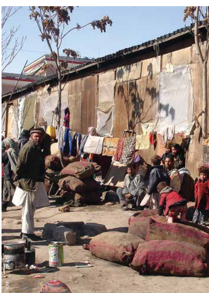
IDP camp in Kabul.

introduce measures to provide legal security of tenure to vulnerable urban IDPs, returnees and others with no legal access to land and housing: Presidential Decree 104 needs to be revised to better address beneficiaries' needs, focusing on adequate site selection, reduction or exclusion of land fees, and broader eligibility criteria inclusive of IDPs and refugee returnees living outside their province of origin. In the meantime, there should be a moratorium on forced evictions and an expansion of programmes to upgrade and legalise informal settlements.