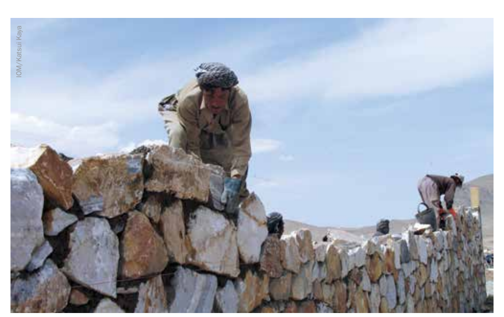
Construction work begins on a new hospital in Ghazni, Afghanistan.

capacity and building investor confidence. The same is true for displacement; while 2014 may bring further displacement, this is no reason not to deal with the dimensions of the crisis that already exist.