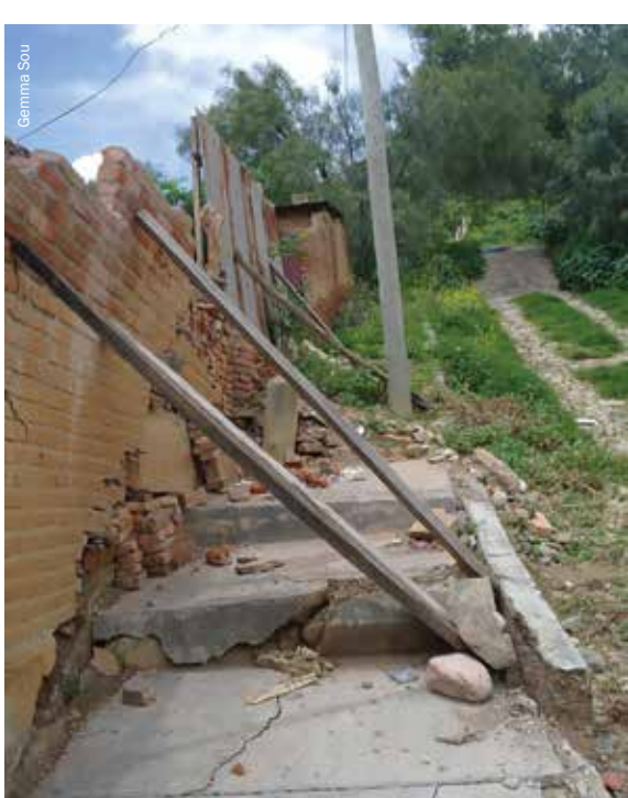
Walls propped up, post-landslide, Cochabamba.

"I made this house, how could I sell it? ...My mother does not want to sell either because of the memories, because we grew up here, they brought us up here, they don't want to move." (Resident)