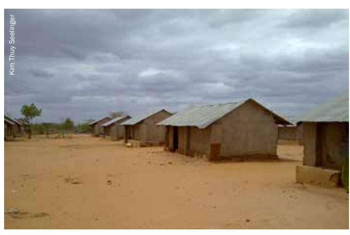
Safe Haven shelter in Dadaab refugee camp in Kenya, 2011.

Alternative purpose entities can provide important protection options on a short-