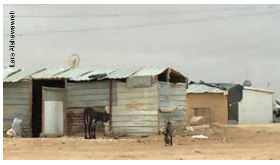
Donkey shelter built by Za'atari camp residents.

One of the few examples of livestock shelters provided by an external organisation comes from the Pakistan emergency response following the 2005 earthquake. The surviving livestock were put in communal shelters after being vaccinated to prevent spread of disease.