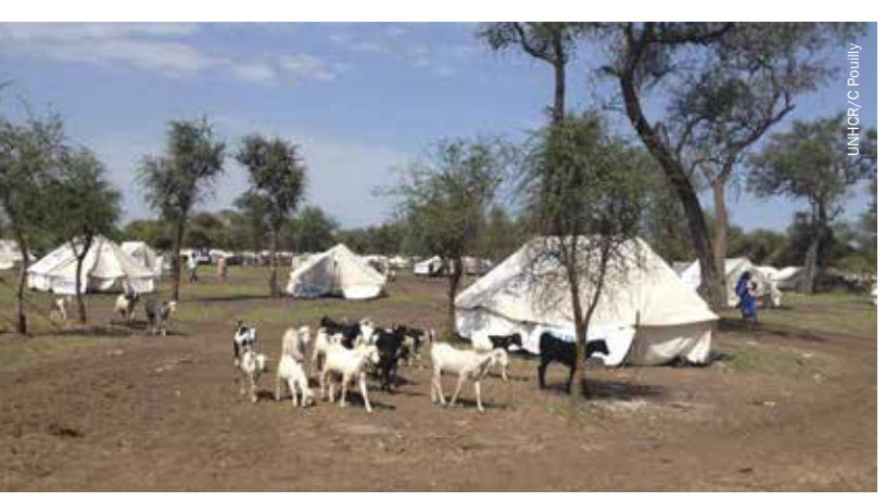
Gendrassa refugee camp, South Sudan.

with livestock playing an important role in the conflicts. Through efforts involving State and local government and both refugee and local communities, however, United Nations (UN) agencies and nongovernmental organisations (NGOs) were able to forge agreements between the various groups to reduce tensions.