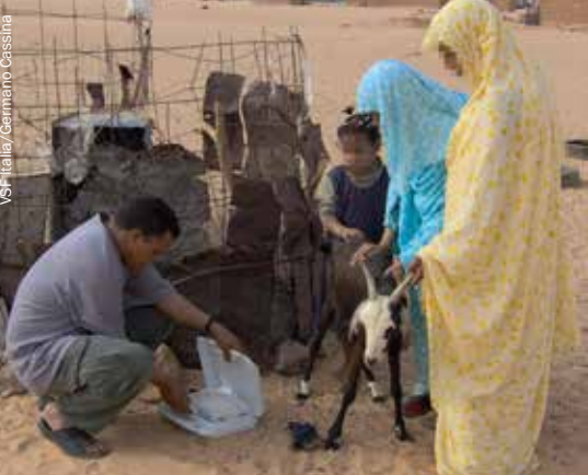
A veterinary clinical visit, Saharawi refugee camp.

insecure funding which can lead to diminished rations and inadequate supplies of interventions such as High Energy Biscuits.3 Furthermore, the results of UNHCR's March 2018 assessment, which found there to be a population of over 170,000 far higher than the 90,000 given in official statistics also suggests that