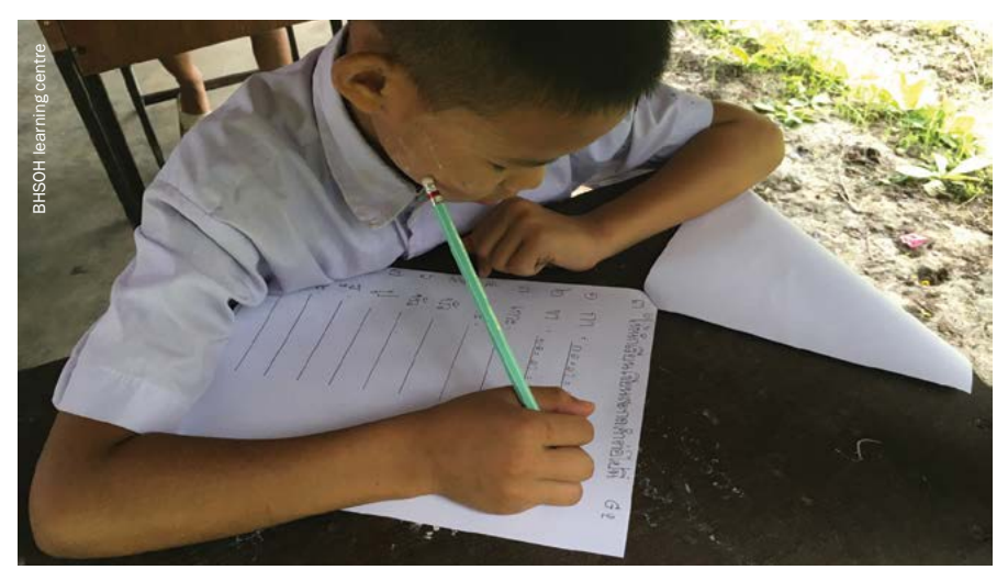
Sitting a Thai language test at a migrant learning centre which has an active catch-up programme.