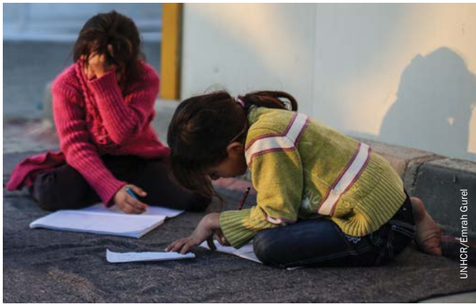
Syrian refugee children in Turkey, doing their homework.

community parents. This supported families in addressing their own trauma as well as that experienced by their children. The programme was adapted over time but faced two major challenges: consistency of attendance and securing the participation of fathers. The introduction of incentives and the wider use of mobile technology might help in addressing these challenges.