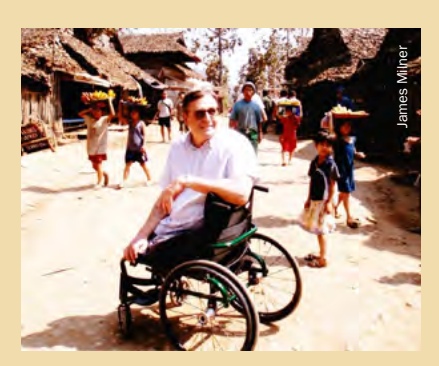
Gil in Thailand, 2006.

On 27 May 2021, viewers from 27 countries attended the virtual launch for Refugees: A Very Short Introduction . The book offers a concise and compelling introduction to the causes and impact of contemporary refugee responses. By drawing on Gil Loescher's 40-year legacy as an authority on UNHCR and global refugee issues, the book offers a critical insight into the impact of today's responses to refugee movements for States, global order and refugees themselves. The book also draws on more recent developments to call for a new approach that engages with the root causes of displacement and the politicisation of refugee responses, and for an enhanced role for civil society actors and refugee-led responses.