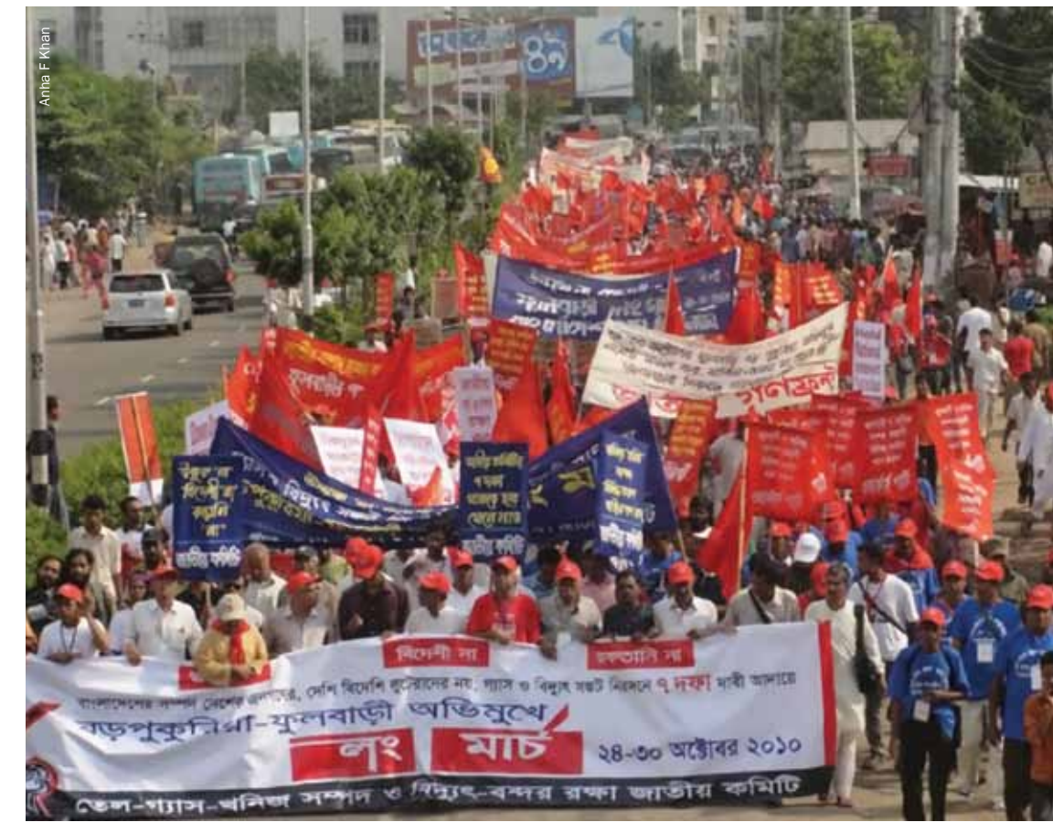
Local people against the Phulbari Coal Project on a seven-day, 250-mile protest march, October 2010.

The number of people the project would evict is disputed. GCM's draft Resettlement Plan states that it intends to displace nearly 50,000 people. In contrast, an Expert Committee commissioned by the Government of Bangladesh concluded that the project would immediately affect nearly 130,000 people and ultimately displace as many as 220,000 people, as mining operations drain their wells and irrigation canals. Bangladesh's National