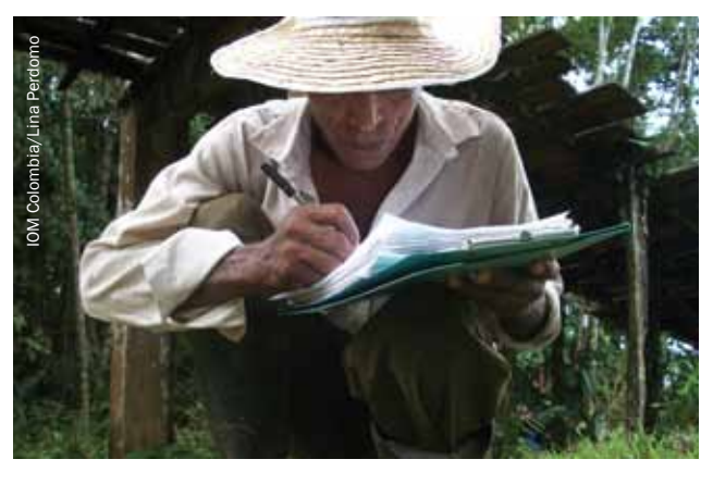
Beneficiary signs an agreement allowing him to receive materials in order to establish a cocoa and plantain productive unit, as part of a project addressed towards forced displacement prevention in Currillo, Caquetá.

The Law was the result of a national consensus among various stakeholders such as the government, Congress, political parties, human rights organisations and victims' organisations. It promotes a model that aims to break the cycle of victimisation and start a process of empowerment instead. The solutions envisioned under the law include promoting the active participation of victims in the design and implementation of the law, accompanying and assisting victims in establishing livelihoods, and supporting victim networks and initiatives. According to the law, respect for the dignity of the victims, their aspirations and stories should prevail in the process of participation – which in turn contributes to empowerment and confidence building. While the process is still