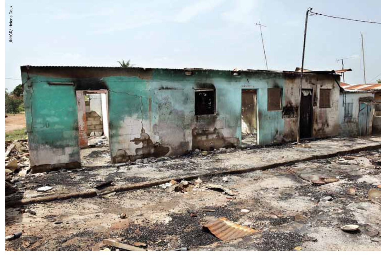
The remains of a torched house in western Côte d'Ivoire, 2011.

Another methodology to specifically prevent the repetition of forced displacement is the 'Dealing-With-the-Past Approach'. In case of a potential recurrence of forced displacement, national prevention strategies should abstain from treating IDPs separately but rather include the specific effort to prevent further forced displacement in a more general approach applicable to all victims of past human rights abuses. The Dealing-With-the-Past Approach, which brings together the rights of victims and societies and the duties of states in the field of truth, justice, reparation and guarantee of non-recurrence, is useful for states wishing to develop a national strategy to deal with past human rights abuses. Through its Task Force Dealing with the Past and Prevention of Atrocities Switzerland advises states on how to integrate the aspects of dealing with the past into their policies and strategies. It has also contributed to specific studies on the link between internal displacement and transitional justice. The Task Force will furthermore seek to strengthen the linkages and collaborations between the mandates of the Special Rapporteur on the Human Rights of IDPs and the Special Rapporteur on Truth, Justice, Reparations and Guarantees of Non-Recurrence.