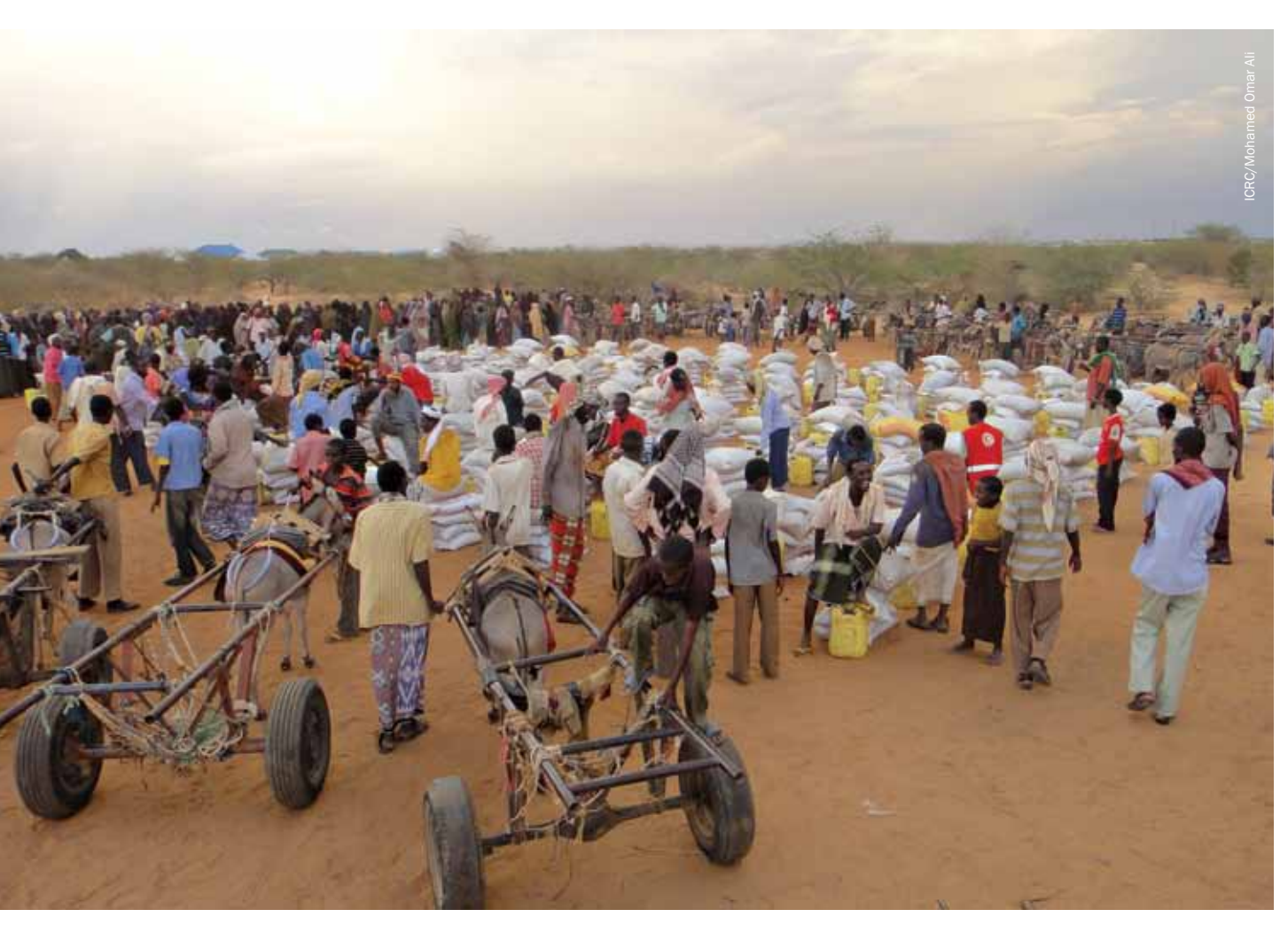
While food distributions in Somalia can help relieve immediate suffering, the ICRC also provided seed and fertilizer for 240,000 farmers ahead of the planting season to give the population the means to sustain their own livelihoods.

Humanitarian aid often aims to meet needs stemming from an immediate humanitarian crisis without meeting the needs arising from a crisis of under-development. Although this extremely complex dilemma requires solutions that stretch far beyond the humanitarian sphere, actions taken to counter the 'pull effect' of humanitarian aid - particularly IDP camps - should nevertheless be considered within the design of a project. Although humanitarian actors tend now to be more aware of the potential pull effect of their assistance, there may be security reasons, logistical challenges or political decisions that prevent their access to affected communities. Relief centres are therefore set up in more accessible areas. However, it is essential to provide assistance as close as possible to affected populations' region of origin and, if possible, to support them with relief that is flexible enough to facilitate return and restart economic activities. Restoring access to basic services such as water, electricity, schooling and medical care may also prevent long-term displacement.