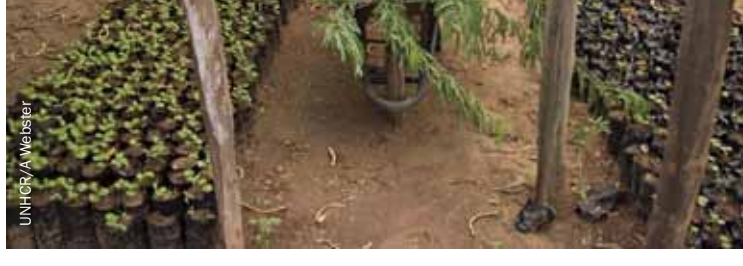
Nurseries and forestation programmes in Kakuma refugee camp, Kenya, were set up by GTZ and UNHCR to help prevent further degradation of the local environment.

A general obligation to protect the environment underlies the duty imposed on national governments to take necessary measures to prevent the occurrence of environmental risks likely to result in displacement. At the same time as governments are being forced to introduce adaptation programmes to slow down the effects of climate change and prevent displacement, the preventive principle – as well as the precautionary principle – has acquired a certain degree of authority at an international level. Numerous international laws