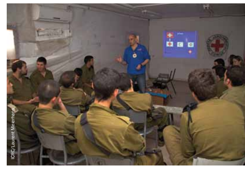
Dissemination session on international humanitarian law for the Israeli Defense Forces, in Nablus

Beyond the 'push factors' described above, an important cause of internal displacement in crises is the 'pull factor' created by the local concentration of services provided by humanitarian organisations – in places such as camps – at a level that is significantly higher than in the surrounding area. This is particularly common in underdeveloped regions, where a severe absence of economic opportunities and services characterises environments in which armed violence occurs. The basic standard of living, even of those who are not directly affected by violence, is often dismally low. Aid provided to people suffering the effects of violence in accordance with internationally accepted standards often far exceeds what is available to much of the resident population and, as a result, IDP camps typically create a significant pull factor.