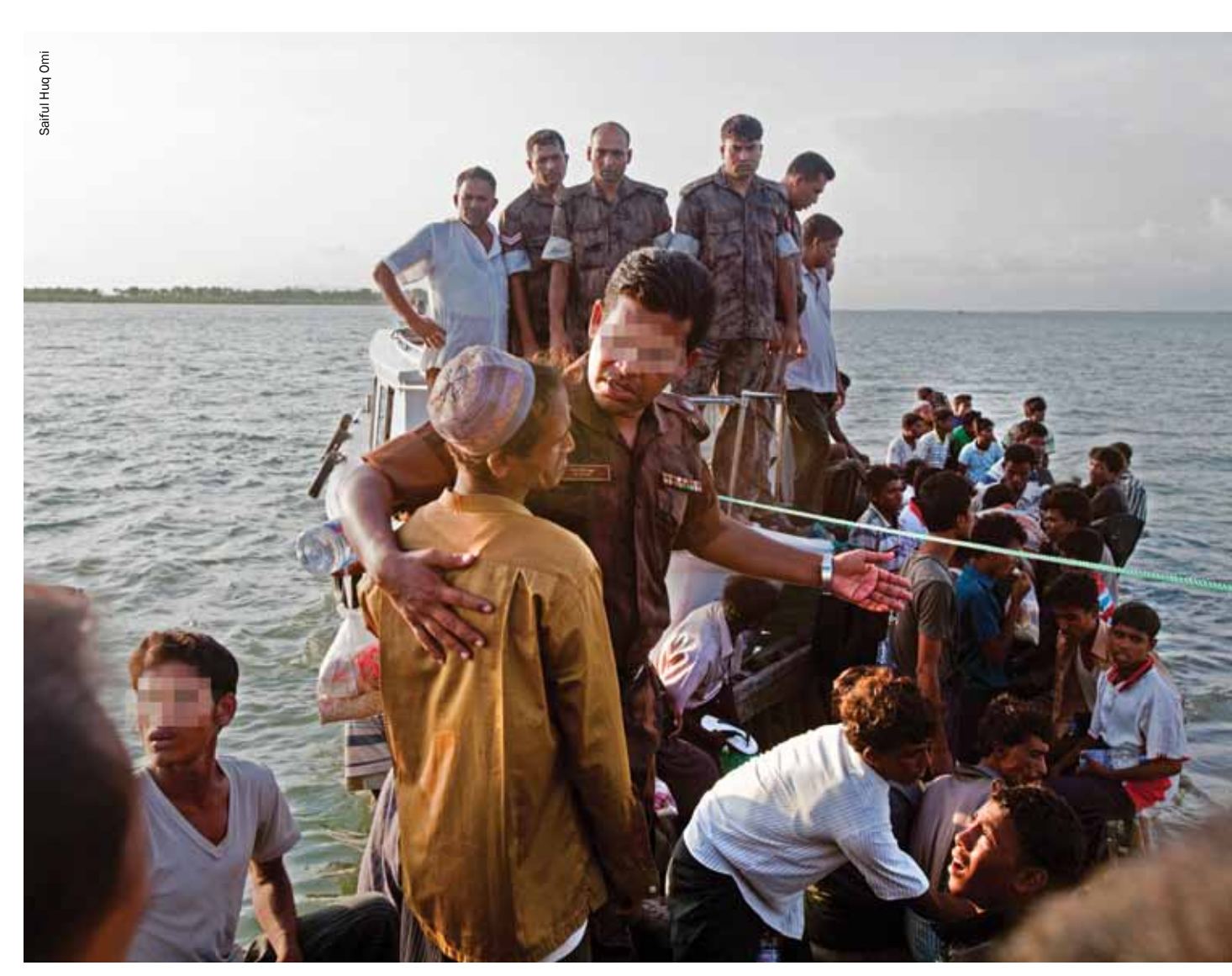
Pushback from Bangladesh, 18th June 2012

they will be either allowed or assisted to return to their home communities or to resume their lives as before.