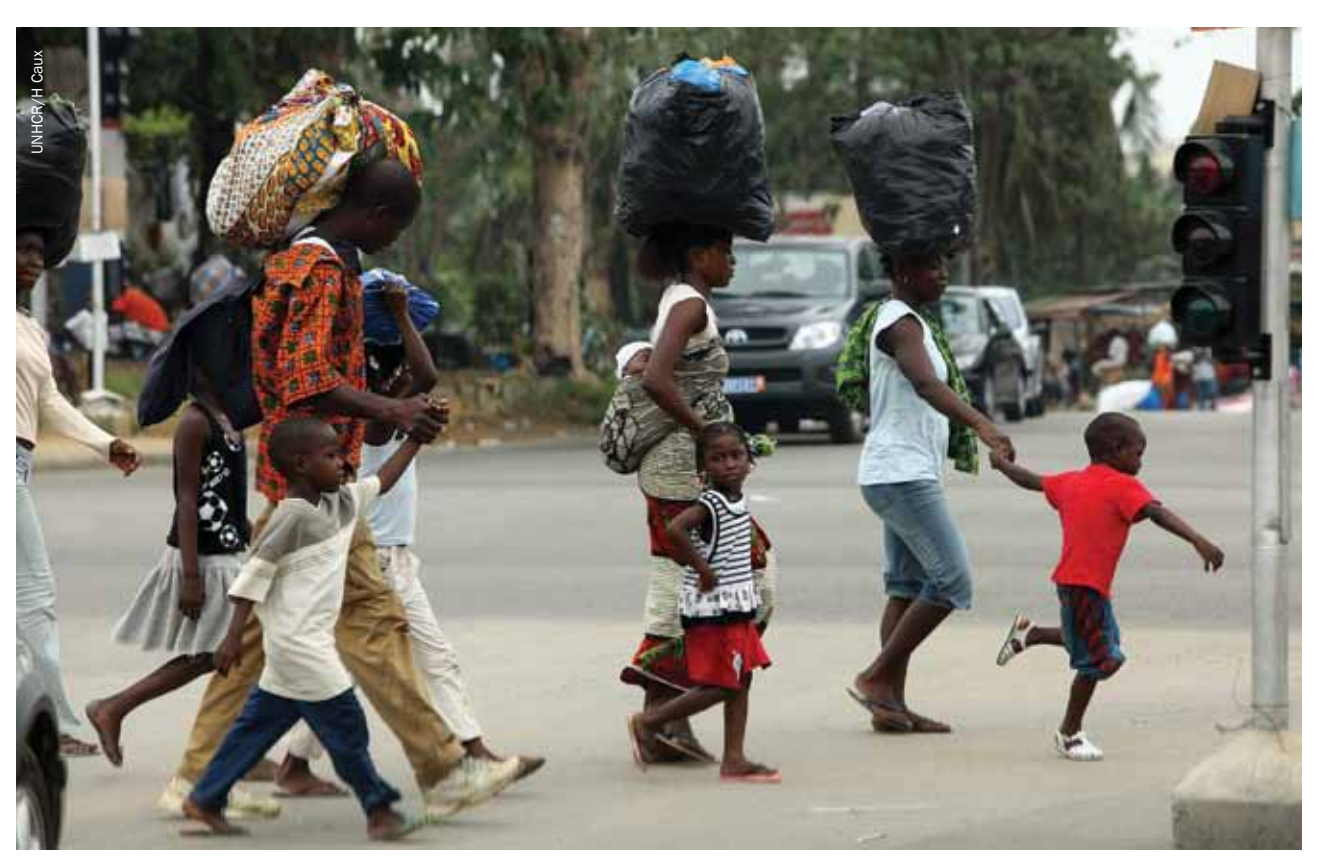
A family hurries away from the Abobo neighbourhood in search of safety during political unrest in Abidjan, Côte d'Ivoire, 2011.

right not to be displaced.<sup>3</sup> Five years later, the Special Rapporteur on Housing and Property Restitution, Paulo Sérgio Pinheiro, articulated the UN Principles on Housing and Property Restitution for Refugees and Displaced Persons (commonly known as the Pinheiro Principles). Principle 5(1) explicitly recognises the right not to be arbitrarily displaced, almost exactly copying the Guiding Principles. Although these instruments are not legally binding, they are evidence of the widespread acceptance of Principles 5 to 9.