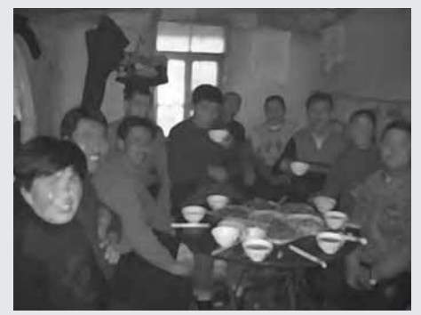
Many North Korean women live with Chinese men and sometimes become integrated into Chinese local communities.