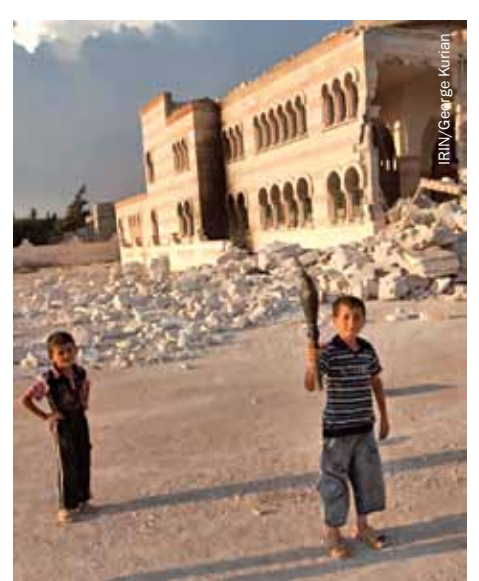
Children in Assas, Syria, playing with casings and unexploded shells, 2012.