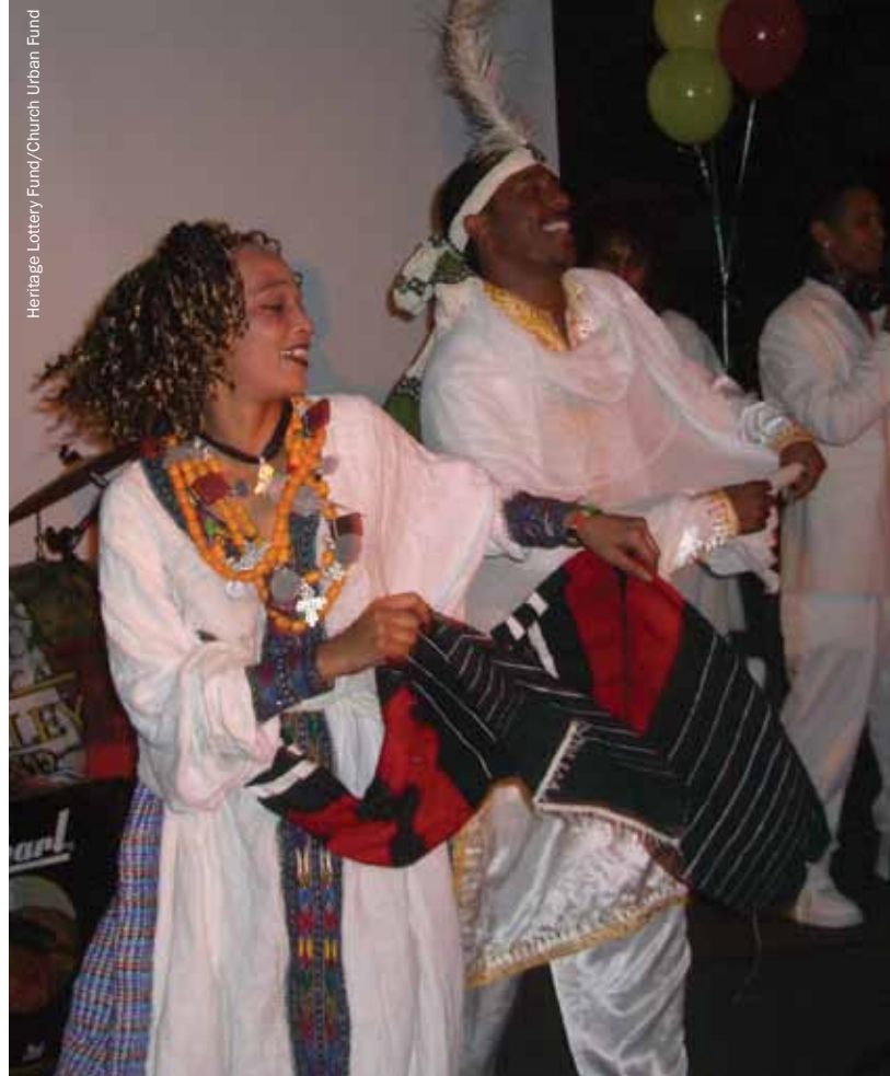
As part of a project to encourage inter-community integration, many representatives of the local community took part in a party to celebrate the

This discussion, however, would be incomplete without touching on the effects of the current global economic climate. Inevitably, the economic slowdown is affecting these refugees, not least because they find it hard to keep or find scarce jobs during the cuts. Once again, they are resorting to their resilience and resourcefulness. With regard to cutting the sky-rocketing cost of energy bills, for example, the words of advice I have overheard might be relevant to others like myself living