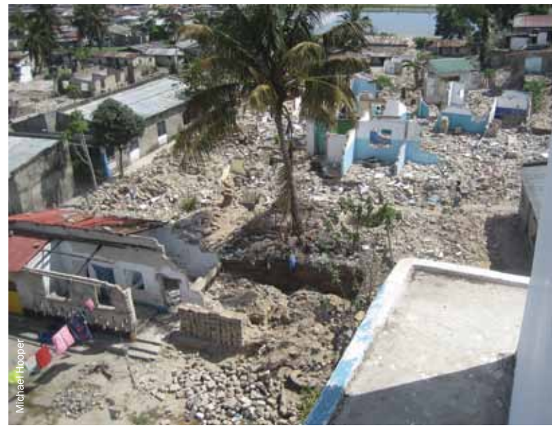
Demolished homes following evictions in Dar es Salaam's Kurasini Ward.

experience more negative outcomes with respect to employment. These evictees either had to commute long distances to jobs near their former homes or find new forms of livelihood in their new places of residence.