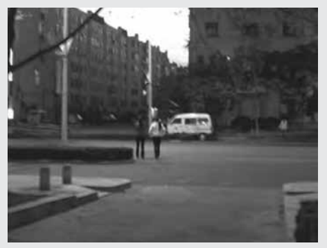
Two North Korean women working as sex workers in Qingdao leave after having interviews with a research team.