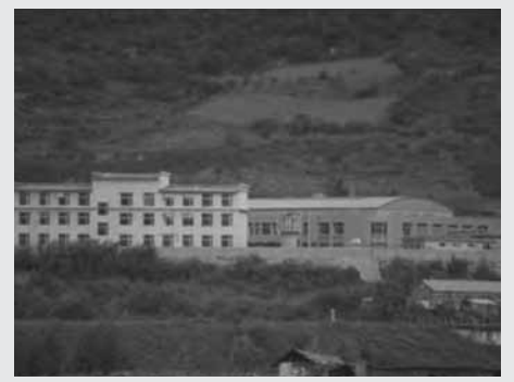
China's high-security Tumen Detention Centre where many women being sent back to North Korea are held pending their repatriation.

The reports of the UN Secretary-General and of the Special Rapporteur on human rights in North Korea as well as the resolutions of the General Assembly, adopted by more than 100 states, have called upon North Korea's neighbouring states to cease the deportation of North Koreans.<sup>7</sup>