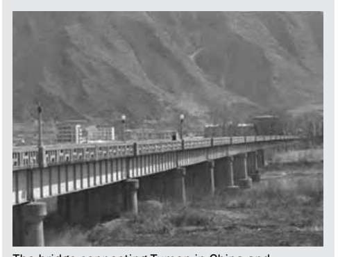
The bridge connecting Tumen in China and Namyang in North Korea, over the Tumen river.

www.hrnk.org/uploads/pdfs/Lives_for_Sale.pdf