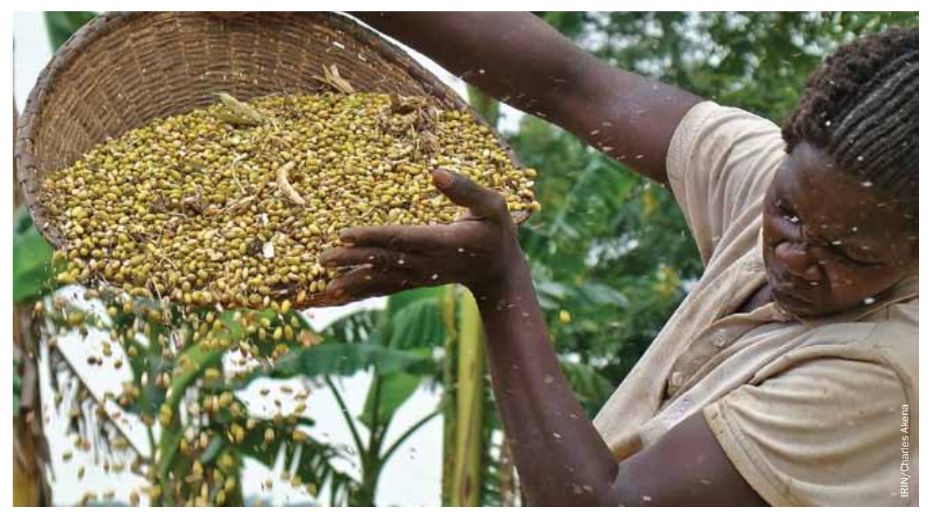
A farmer winnows her bean harvest in Nwoya district, Uganda.

Recurrences of conflict and re-displacement are becoming a common feature of the Great Lakes region. The land