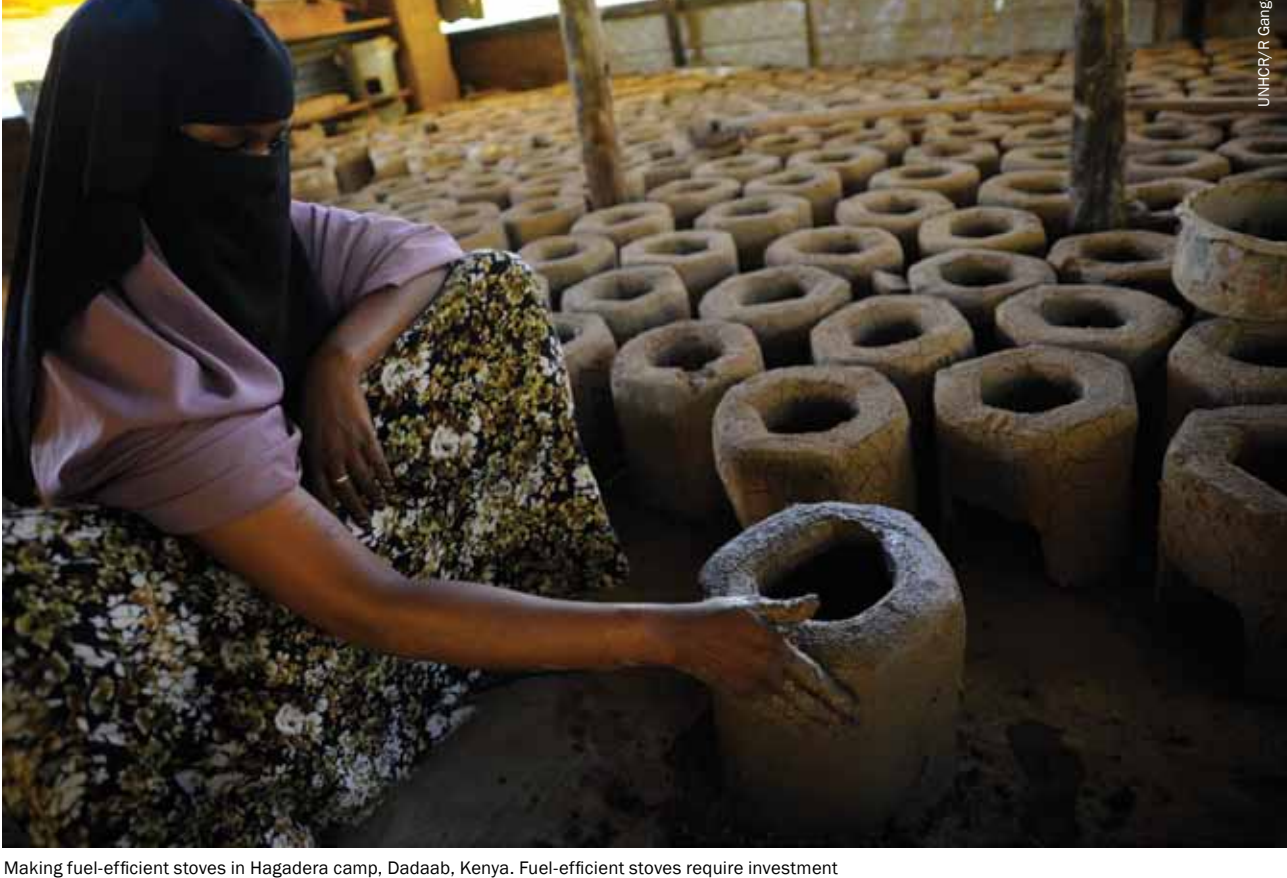
Making fuel-efficient stoves in Hagadera camp, Dadaab, Kenya. Fuel-efficient stoves require investment by assistance organisations but reduce the impact on the local environment.

Finally, while the methodology's focus is on livelihoods and micro-economic impacts and costs, assessing the impacts at the macro-economic level is an equally important dimension of the analysis. Refugees increase