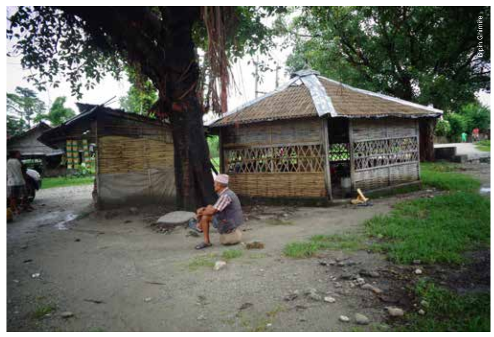
Older Bhutanese refugee in one of the refugee camps in Nepal.

well for resettlement anyway. To counter the high dropout rate, the schools in the camps have school counsellors to motivate the children. Drop-in-centres and 'youthfriendly' centres have been established to help dropouts to rejoin school and to prevent them from becoming involved in gambling, drug supply and abuse, thieving or fighting. The activities of drop-in centres have no doubt changed some young people but are not able to make a significant change to the overall camp situation.