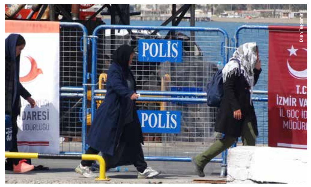
First readmissions to Turkey under the EU-Turkey deal arrive at Dikili port in Izmir province, 4th April 2016.