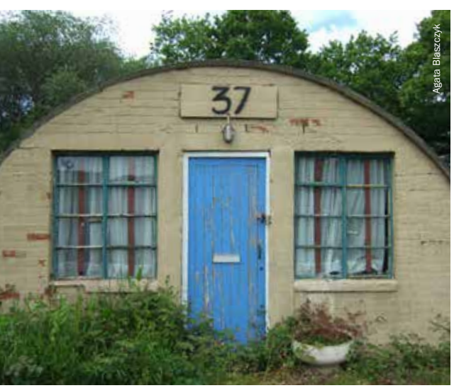
Nissen hut in Northwick Park Camp, originally built in 1943 as an American field hospital and used from 1947 by the Polish Resettlement Corps.

The Act enabled Poles to integrate in the UK and thus contribute to providing the labour force needed by the British economy in recovering from the war. By the end of 1949, 150,000 Polish soldiers and their dependents had settled in the UK and their descendants continue to make up a large part of the UK's Polish community as it exists today. In due course, the Poles emerged as dedicated contributors to the reconstruction of the UK economy, and Polish refugees became one of the most prosperous immigrant groups in the UK.