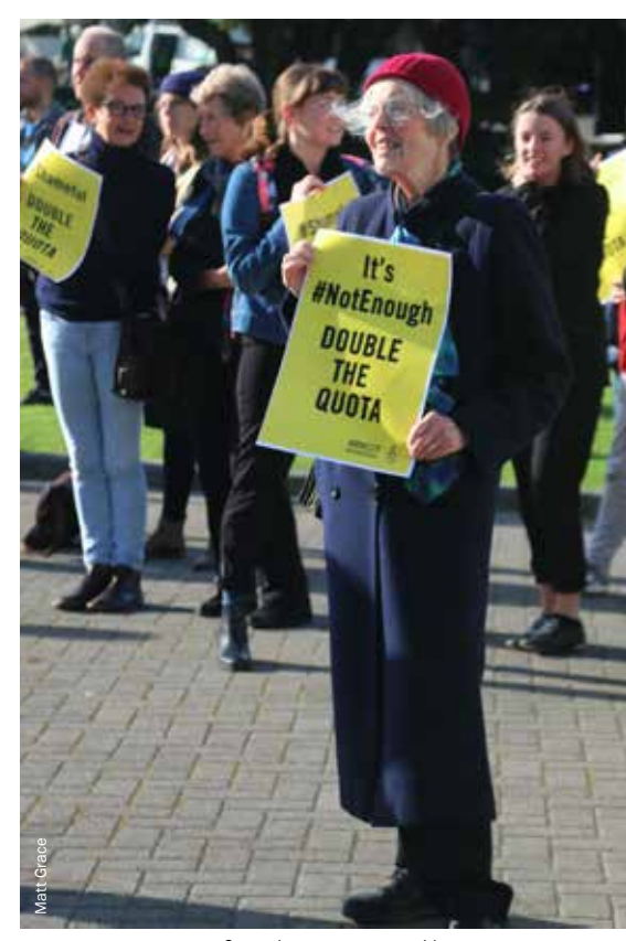
Campaigners protest outside government buildings, Wellington, New Zealand.

By February 2015 other advocacy groups also were campaigning to double the quota. In time we also drew in celebrity endorsements and the support of mayors and