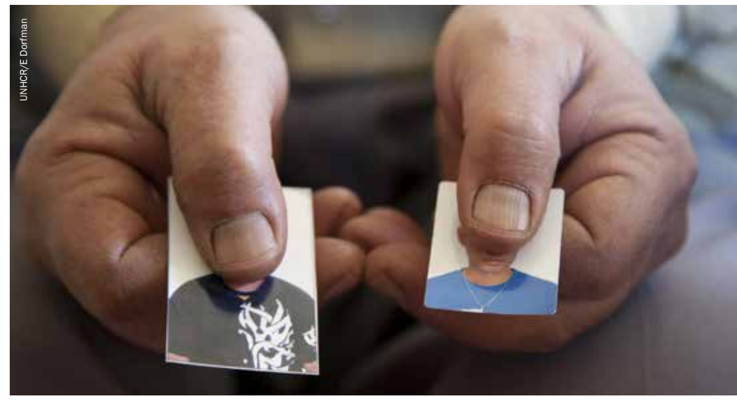
A Syrian refugee, now living with his family in Lebanon, holds photos of his sons. He covers their faces to avoid recognition. Like other young Syrian men who have fled Syria, they fear they will be punished by the Syrian government or made to join the army should they be found.

This assumption ignores the conditions of vulnerability and insecurity that Syrian men face.<sup>2</sup> Single Syrian men in particular are often rendered vulnerable by their circumstances. For example, in Lebanon many single Syrian men live in fear for their safety, predominantly due to threats