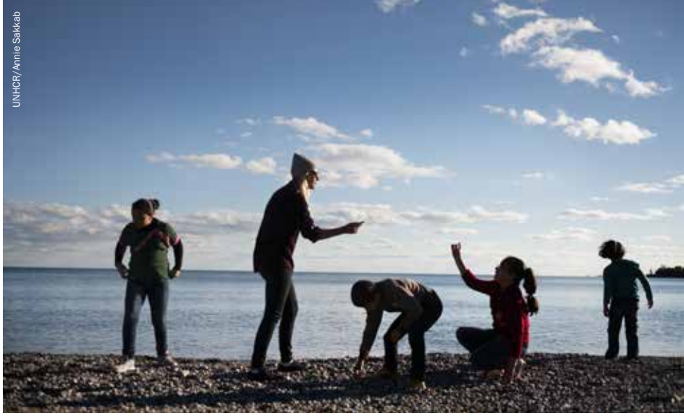
A Canadian sponsor plays with Syrian refugee children who have been resettled in Toronto under the Private Sponsorship of Refugees Program.

Using prima facie refugee status determination rather than the more onerous individual refugee status determination for eligibility for private sponsorship has made