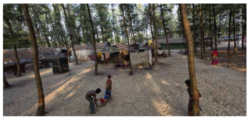
People displaced by the effects of climate change have moved to Cox's Bazar, making temporary shelters on the government-owned beaches.

displaced persons with enhanced security of tenure.