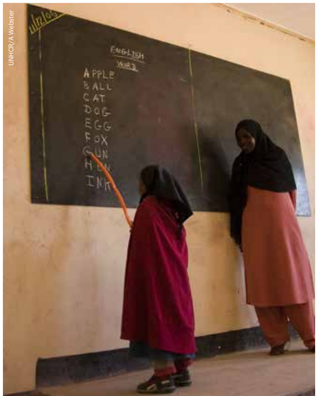
Ethiopian refugees in Hargeisa, Somalia, attend English language classes in preparation for resettlement to Canada.

is written in that box matters. It matters to the family, of course, and it matters to Canada, which tends to measure the success of resettlement by how quickly refugees become productive members of society.