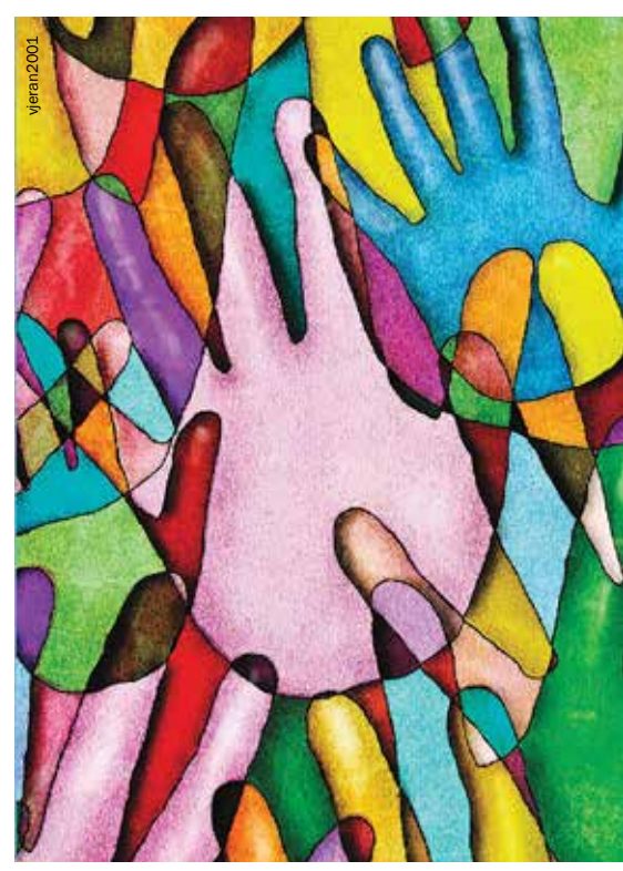
Cover image from Mayo Multilingual Support Services Booklet http://bit.ly/MIApdf

With its preoccupation with border protection concerns, the Programme missed the opportunity to formulate a comprehensive and fair response to inward migration, and particularly to the reception conditions of people seeking protection in Ireland. The Programme acknowledged the negative impact of the Direct Provision system on the family life of asylum seekers but did not recognise that Direct Provision