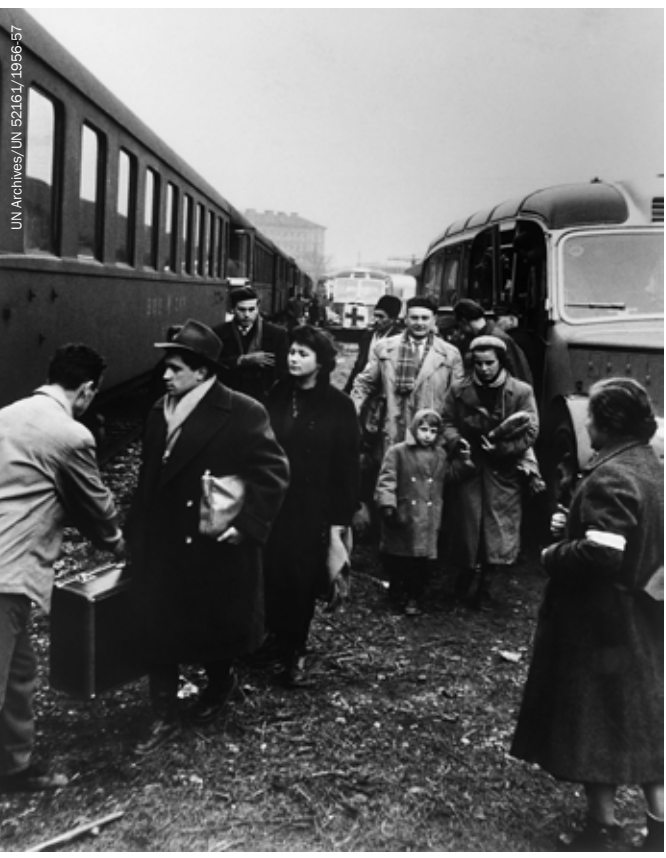
Hungarian refugees in Austria taking a train to Switzerland, their new country of asylum, in 1956.

By 6<sup>th</sup> November, the decision to resettle Hungarian refugees was made by Sweden's Minister of Aid and Immigration, Ulla Lindström. On the following day, camps in Austria were contacted to coordinate selection, and a Swedish delegation was sent. The Labour Board began planning the selection process as well as the process for reception of those resettled. On 12<sup>th</sup> November, 73 children and 30