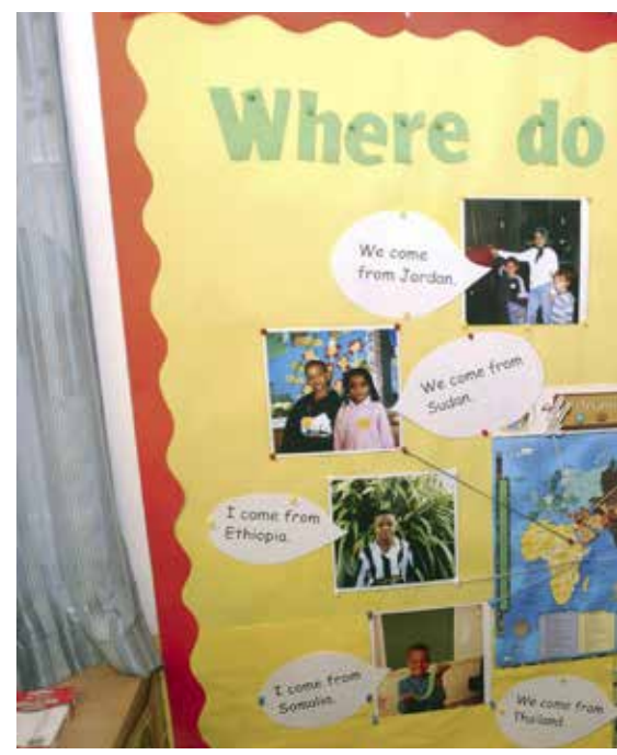
Where do you come from? Resettled refugee children in New Zealand share pictures of themselves and use a map of the world to show where they have come from. Mangere Refugee Resettlement Centre, Auckland, New Zealand.

Globally, nearly 100,000 – or slightly less than 1% – of all refugee and asylum-seeking children are separated from their families. While these children are highly vulnerable without their usual parent or caregiver to support them, refugee children within family units can also face a variety of acute and sometimes life-threatening risks. As well