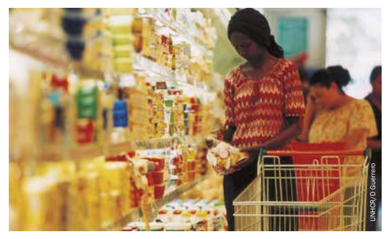
Rwandan refugee resettled in Santiago, Chile

to increase resettlement commitments over time. Ultimately, over 100,000 Bhutanese were resettled.<sup>1</sup> The BCG member states issued a communiqué announcing their collective resettlement commitments and called on Nepal and Bhutan to join them in the pursuit of other durable solutions.<sup>2</sup>