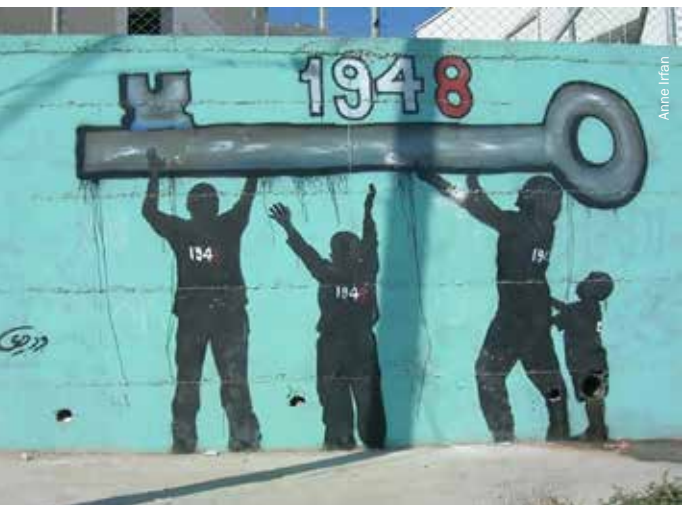
Mural in a Palestinian refugee camp in the West Bank, calling for the right of return.

Such plans were overwhelmingly opposed and rejected by the Palestinian refugees themselves. Observing that the Works schemes presupposed their futures outside Palestine, the refugees largely declined to enrol and participate. Their intransigence, combined with the costly nature of the schemes, led UNWRA to eventually abandon the programme, switching its emphasis in the late 1950s to education. Yet the