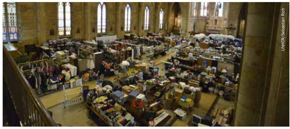
A distribution centre run by Catholic charities to help newly arriving refugees in Louisville, Kentucky, in 2013.

whereabouts of anybody they know who is currently living in the US. Additionally they agree not to move within the first 90 days of their arrival in the US under penalty of forfeiting their right to core services. This policy aims to change the incentives by rewarding refugees who share information but could penalise refugees who do not possess the information they might need in order to communicate what their geographic preferences will be once they arrive in the US.