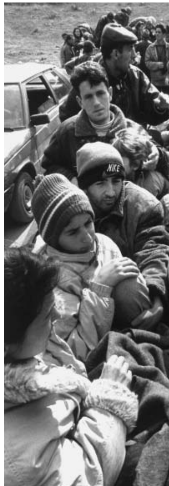
Many refugees from Kosovo were forced to leave their homes within minutes, often with little more than the clothes they wore.

societies. Upon return, she may be haunted by the events that occurred and the likelihood of re-traumatisation in such cases may be very real. In addition, in some circumstances, she may know or be known to the perpetrators and her physical safety could be threatened if returned. One or more of these circumstances provides a sound basis upon which a resettlement case could be brought. Determining that a refugee is unable to remain in the country of refuge in the long term recognises the fact that many refuge countries may not be able to offer the level of refugee protection required.