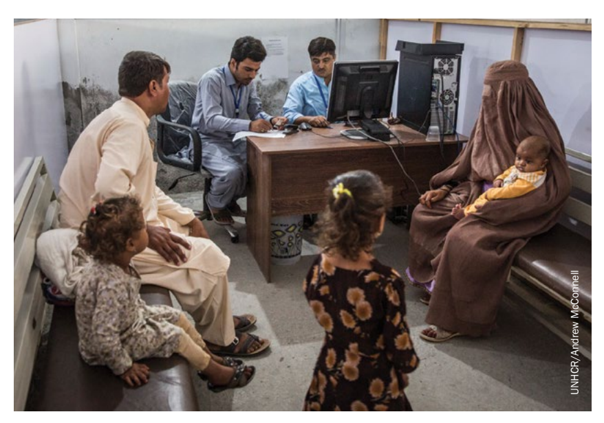
Afghan refugees at a UNHCR repatriation centre in Nowshera, near Peshawar, Pakistan, in 2018.