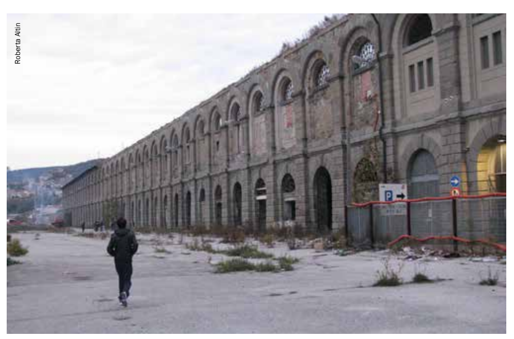
Silos, in Trieste, Italy.

information centre for newly arrived asylum seekers, and a daytime social centre also for refugees hosted in the SPRAR system who still suffer from the loneliness peculiar to and shared by migrants. Silos is at once a central place and one of transit, close to public transport and the port and just a short walk from the soup kitchen, the hospital and the social services of various NGOs. It works as a sort of informal hub – situated in the heart of the city but not overly visible.