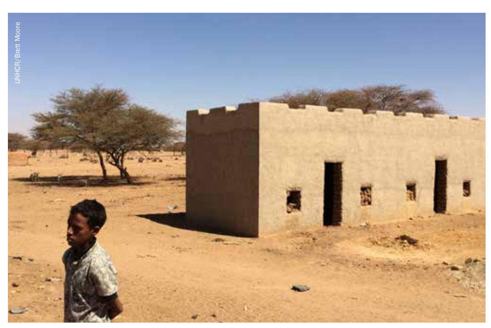
An example of vernacular architecture - local mud-brick buildings - that would be used as a prototype for upgrading M'Bera camp.

As the longer-term needs of M'Bera become clearer, the potential for spatial rearrangement is critical; the increasing formalisation of the settlement will inevitably require some movement of shelters, roads and infrastructure, and re-thinking of the relationship of some critical elements. In this sense, the current shelter design and the overall settlement have the capacity to undergo a rearrangement more suitable to longer-term needs. This material and spatial flexibility also requires a strategic shift from a humanitarian approach to a phased developmental approach. The refugees have indicated that even if a reasonable degree of peace and stability could be achieved in Mali in the near future, a number of them would not return but would remain in M'Bera. In any case, the consensus is that the security situation in Mali will remain unchanged in the medium term and refugees have a realistic understanding that they will remain in M'Bera for several years to come.