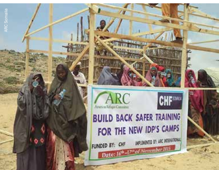
Somalia Humanitarian Fund shelter project, Somalia.

the rest opted for the larger corrugated iron sheet house, with adequate space and privacy being the main determining factors for their selection. It would be useful to do further research to better understand the choices that the beneficiaries made.