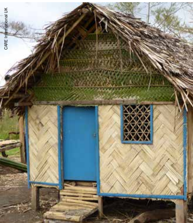
Self-recovery in Vanuatu.

The Philippines after Typhoon Haiyan highlights many of the advantages, and some of the pitfalls, of a self-recovery programme. First among the positives is the control, agency and choice exercised by the family. The most striking visual evidence of the sense of ownership stimulated by self-recovery is the delightfully designed woven bamboo screens and the bewildering array of potted plants that adorn the front of every house. A self-recovery approach