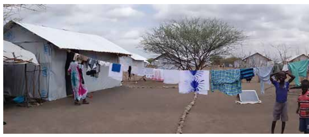
Recently arrived refugees, Kalobeyei New Settlement, Turkana, Kenya.

Under this agreement, 1,500 hectares of land were allocated in Kalobeyei, 15km to the west of Kakuma camp, for a new refugee settlement. UNHCR and its partners agreed to develop the site as an integrated settlement for 60,000 people - refugees and members of the host community – underpinned by social and physical infrastructure and a diversity of economic opportunities. Given its expertise in spatial planning, UN-Habitat was invited to partner in the settlement development process. The county government of Turkana would be fully involved in planning, construction, monitoring and evaluation of the settlement and would take over its management in the medium to long term, administering it as an urban settlement and providing basic services. The new settlement could then, over time, generate tax revenue to pay for services.