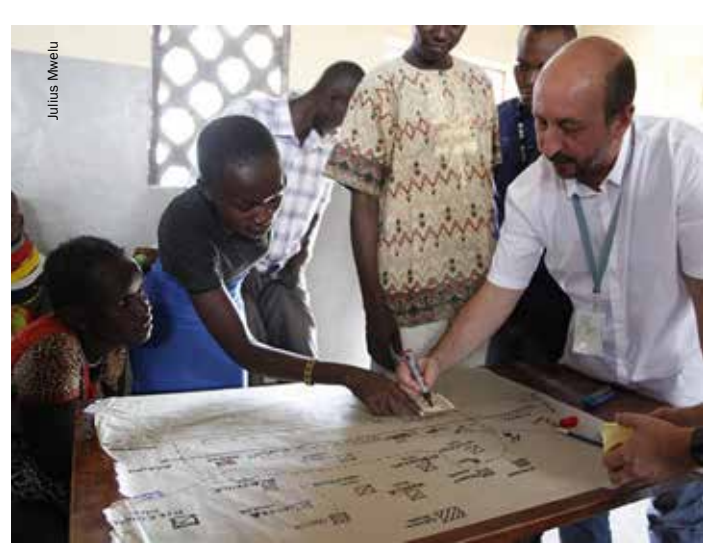
UN-Habitat planner mapping out wants and needs for Kalobeyei with local host community settlement development group.

stakeholders with an interest in the new settlement's development. For example, the Turkana County government and UNHCR co-lead together with UN-Habitat the thematic group on spatial planning and infrastructure development. This structure of engagement has on the whole been effective in building the confidence of the communities in the authenticity of the process. The involvement of the county government of Turkana, which initiated the idea of integration, has been crucial to enhancing compliance of the resultant spatial plan with existing laws and regulations. Once the spatial plan is approved, the county government will have direct responsibility for monitoring its implementation.