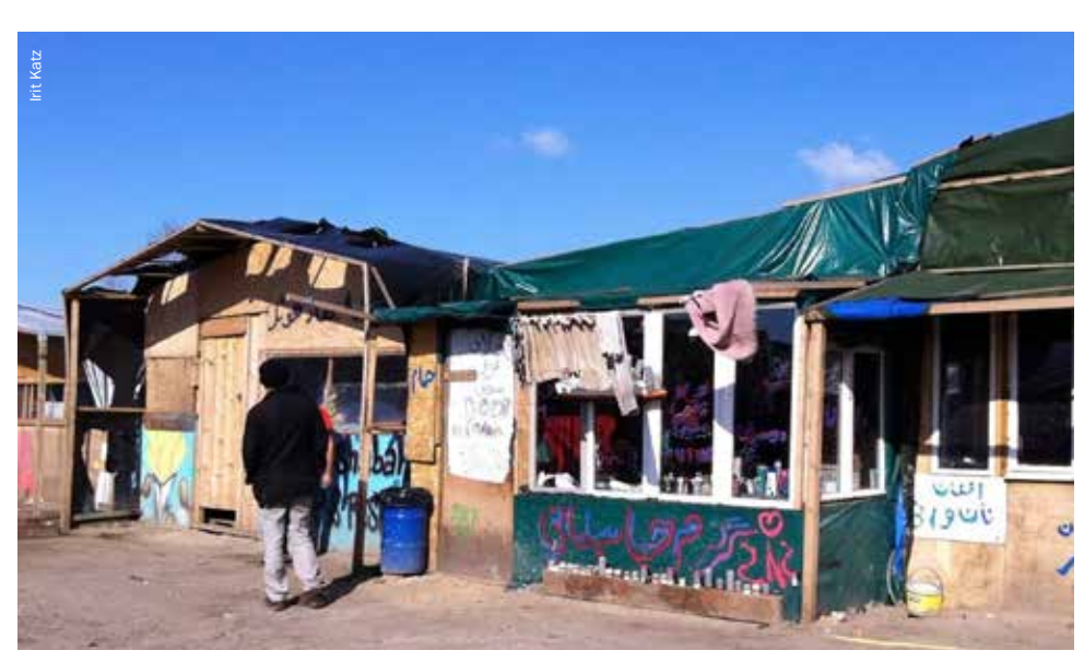
The 'high street' in the Calais Jungle, April 2016.

into the immigration regime. The decision to dismantle the Jungle and relocate its inhabitants to alternative accommodation in shipping containers and reception centres across France was primarily a political act, not a humanitarian one.