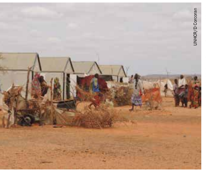
RHU shelters are being used and tested in the field by Somali refugees living in Hilaweyn refugee camp, Dollo Ado, Ethiopia.

While technical testing in different climates is vital in our case, we also depend on subjective information from the individuals