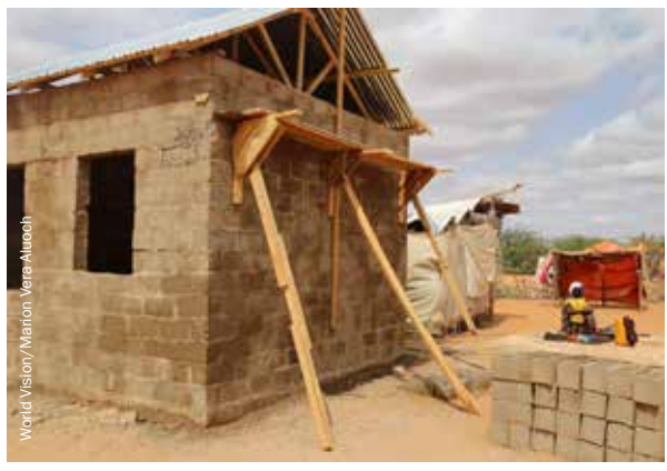
An IDP family with their new shelter in Dollow, Somalia. "I selected the cement-block house because the size is good for my family and it is cool inside."

In one programme run by an SSC member, prototypes of shelters of different types were constructed to similar budgets and the beneficiaries were given the information on the different aspects of each type. They were then allowed to choose a shelter type based on their needs and preferences. The three different prototypes were made of cement blocks, stabilised soil blocks and corrugated iron sheets. Less than 20% of the beneficiaries opted for the cement house;