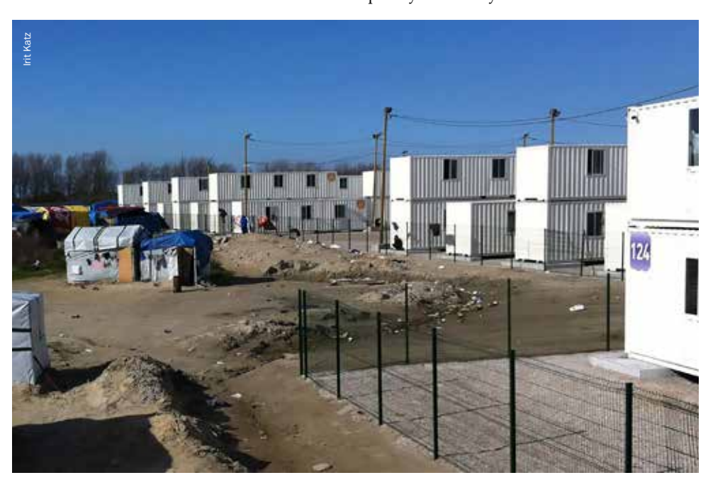
The container camp and part of the Calais Jungle, April 2016.

While these pre-fab shelters are sometimes 'state of the art' building technology, they are designed to answer general needs in no particular location and for no particular people. The materials used are often suitable to some climates better than to others: their methods of construction often resist alteration and appropriation by their users and cannot be easily adjusted to particular human needs and habits; and their deployment on site in large numbers, often in a grid which is easy to create, control and manage, usually produces repetitive and low-quality spaces which serve a particular purpose but are alienating to their inhabitants. The idea that these pre-fab shelters could be folded back into their original kits and be reused as the perfect sustainable solution for displacement is also erroneous; they are damaged quite quickly when they are lived in and cannot