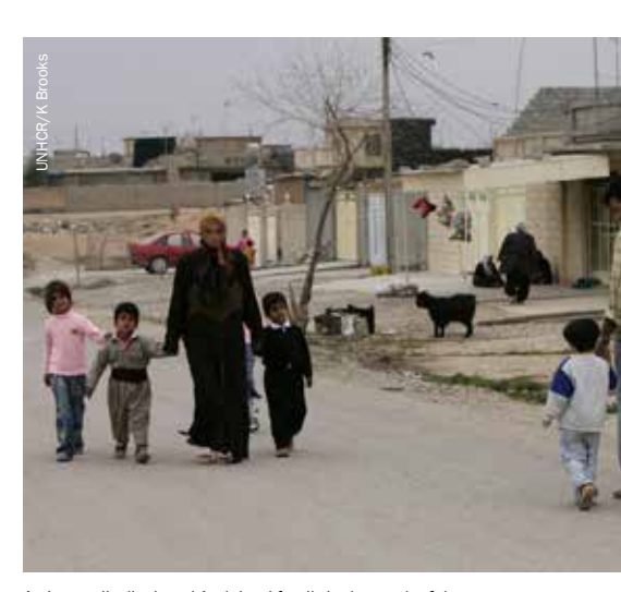
An internally displaced Arab Iraqi family in the north of the country walks through the Kurdish neighbourhood where they now live.

Outside conflict situations, CTP is often implemented as one component of more complex programmes. CTP on its own can, even under challenging circumstances, rapidly bring temporary relief to households and individuals, where volatile security conditions and short timeframes for implementation may initially complicate complementary measures. At a later stage of a protracted crisis, however, cash transfers should be linked to additional support measures - such as acquiring qualifications and accessing training, or enabling access to financial services such as small business grants or savings products - in order to achieve lasting effects that go beyond initial stabilisation. Such measures may be challenging but are particularly relevant in northern Iraq, since a succession of crises has seriously limited the absorptive capacities of the local labour market,