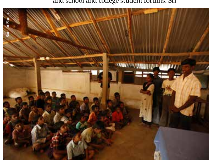
A student-led forum for school children in a Sri Lankan refugee camp in Tamil Nadu, India.

A variety of programmes were organised by OfERR to promote education among the Sri Lanka Tamils: nursery education, primary and secondary schooling, evening classes, higher education, computer training, and school and college student forums. Sri