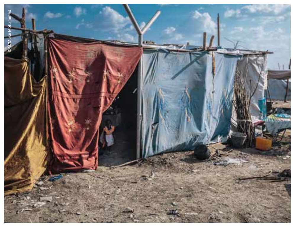
A makeshift shelter in the Malakal Protection of Civilians site, South Sudan.

First, given the spatial and temporal nature of conflicts, shelter specialists and other humanitarian actors are forced to merge rights-based approaches with material needs-based approaches and, in