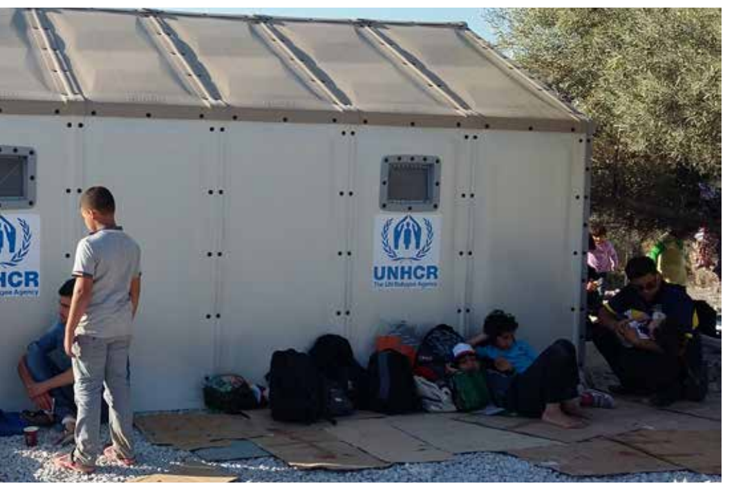
Refugee Housing Unit, Kare Tepe, Lesbos, Greece.