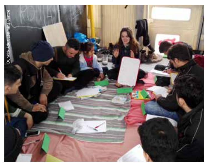
'Learning for unity and understanding' at Adult Learning Centre, Dunkirk.

The temporary structures that are generally used do not meet the multiple programmatic, cultural and environmental needs that exist in displacement situations and unfortunately the majority of settlements that are set up as temporary settlements end up becoming permanent. In the best case, the solution for these more permanent settlements is to replace the tents with metal containers which are costly, difficult to transport and install, and require additional equipment and facilities in order to provide a minimum quality of life. We found that there is no comprehensive solution for