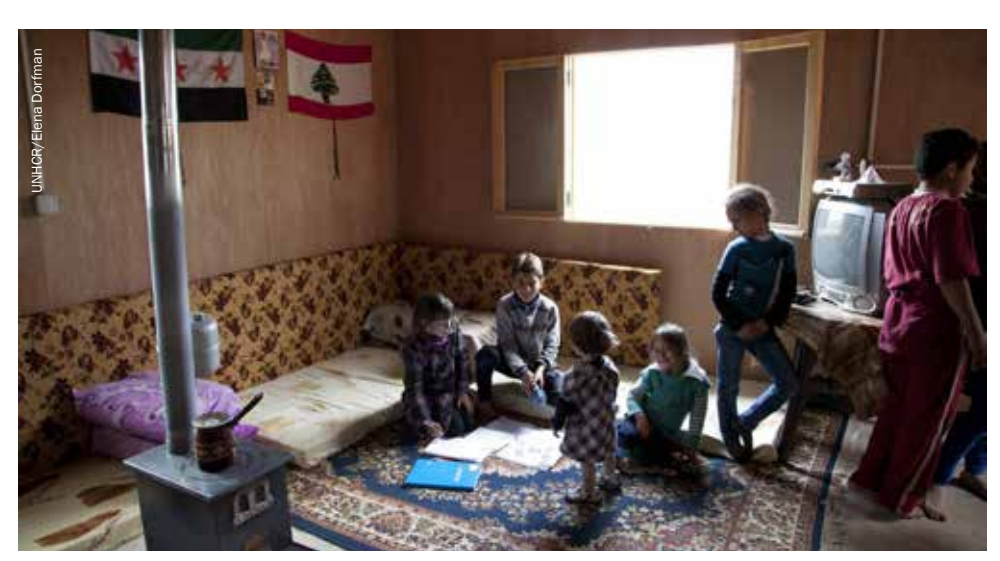
Syrian refugee children who are being hosted by a Lebanese family do their homework and play together.

for a duration of one to three years. Other guidelines suggest a four-party agreement between host, hosted, implementing agency and local authority. Yet no independent research has been conducted that shows the extent to which an agreed-upon end date reduces anxiety, and its influence on the quality or experience of hosting.