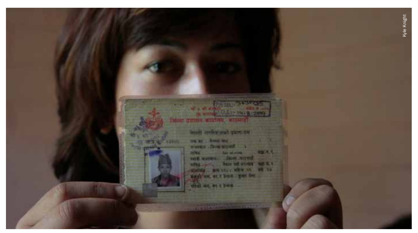
A Nepali transgender woman holds up her citizenship certificate, which identifies her as male. She has struggled to access services as a result of the discrepancy between the document and her current appearance.

Forced Migration Review (FMR) provides a forum for the regular exchange of practical experience, information and ideas between researchers, refugees and internally displaced people, and those who work with them.