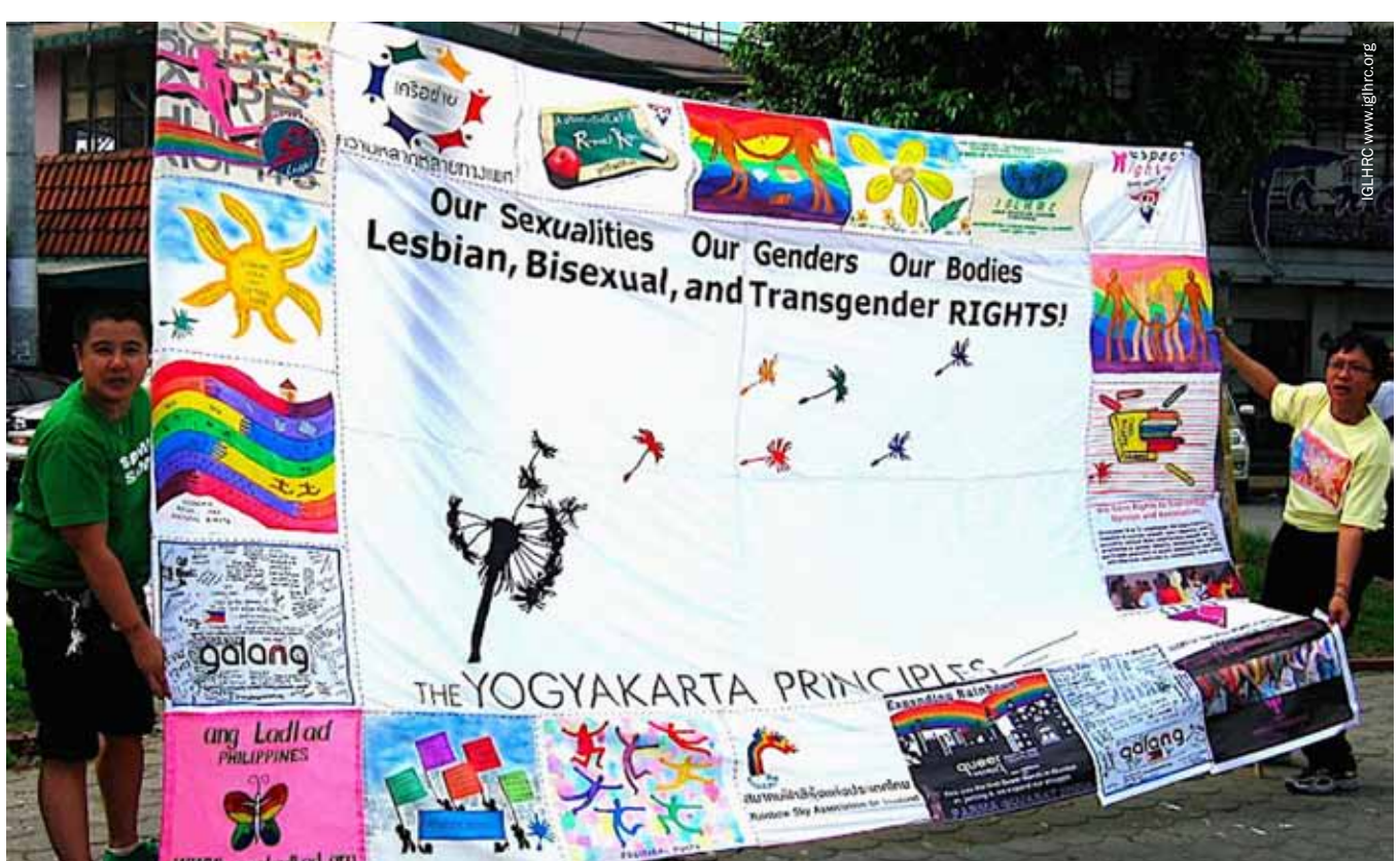
2008 Manila (Philippines) Pride March and launch of Yogyakarta Principles in the country.