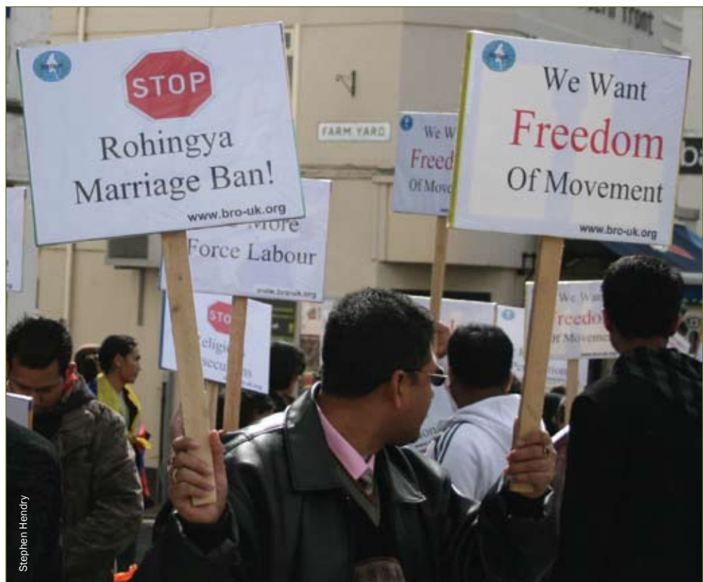
Peace Walk for Rohingyas

In 1989, colour-coded Citizens Scrutiny Cards (CRCs) were introduced: pink cards for full citizens, blue for associate citizens and green for naturalised citizens. The Rohingya were not issued with any cards. In 1995, in response to UNHCR's intensive advocacy efforts to document the Rohingyas, the Burmese authorities started issuing them with a Temporary Registration Card (TRC), a white card, pursuant to the 1949 Residents of Burma Registration Act. The TRC does not mention the bearer's place of birth and cannot be used to claim citizenship. The family list, which every family residing in Burma possesses, only records family members and their date of birth. It