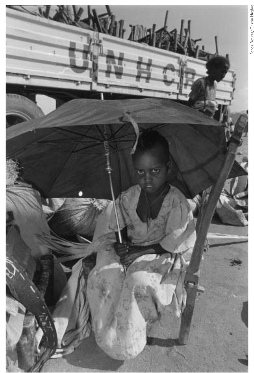
IDPs being moved from Jegga Camp (where they have lived for two years) to Shelab Camp, Eitrea.

the World Food Programme, UNHCR, UNICEF and numerous NGOs have long been involved in protecting and assisting displaced populations. In 1997, the UN Secretary-General charged the Emergency Relief Coordinator (ERC) of the Office for the Coordination of Humanitarian Affairs (OCHA) with responsibility to be the focal point within the UN system for any IDP-related