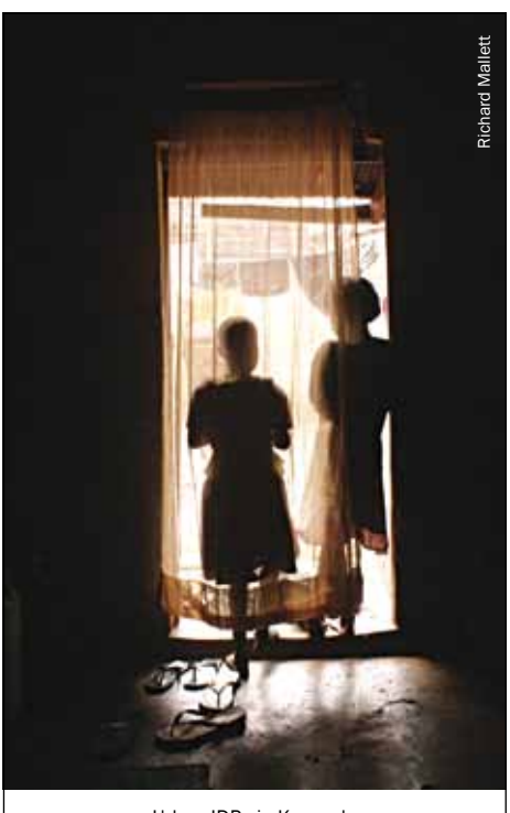
Urban IDPs in Kampala

However, while it is certainly appropriate to view Kampala as a site of transition, this should not always be framed negatively. Places of destination - and particularly urban ones – offer prospects not just of safety but also of opportunity. Many women and children in the Acholi Quarter engage in the BeadforLife project, making jewellery from recycled materials, for which there is an established market.1 Furthermore, the presence of displaced communities can also result in positive changes for the host population. In the Acholi Quarter, for example, Meeting Point International (MPI), a community-