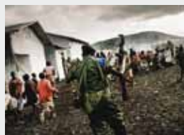
Kibati camp for displaced people, DRC.

People displaced in conflict (and on return home) often find themselves in contact with people carrying weapons in various guises. Equally, people carrying weapons are themselves generally mobile, whatever their relation to a conflict or its aftermath. In particular, members of security forces in situations of forced displacement can be agents of positive change in relation to HIV and AIDS – or part of the problem.