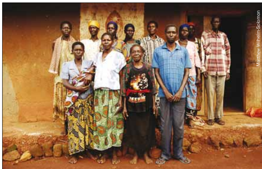
A newly formed HIV support group in a return area of Oyam district, Uganda.