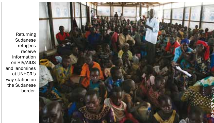
Returning Sudanese refugees receive information on HIV/AIDS and landmines at UNHCR's way-station on the Sudanese border.

The SPLA – the army of the Government of South Sudan (GoSS), previously the armed wing of the main southern Sudanese rebel movement (the SPLM) – is in the process of transforming from a guerrilla army to a professional military force. Challenges during the transition include ambiguity surrounding command structures, and increased cultural variation among soldiers (as all other armed groups, based on mainly tribal identity, had to be absorbed into the SPLA). The SPLA plans to downsize through the DDR process, which presents an opportunity for HIV interventions as soldiers make the transition to civilians.