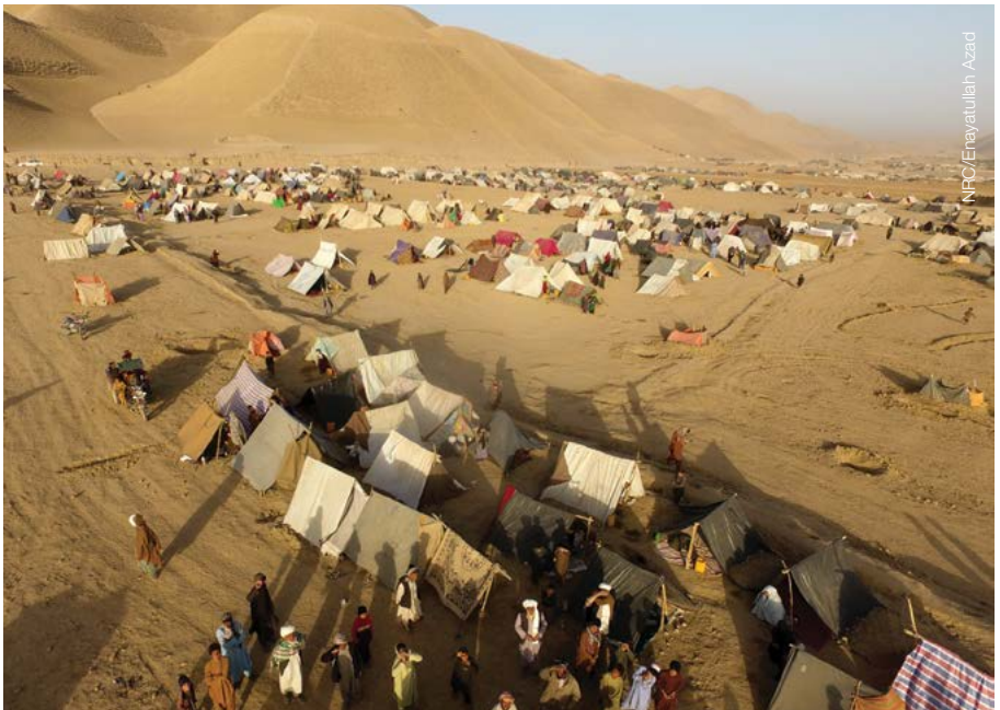
Kharestan IDP settlement, located some 6km from Qala-e-naw city, Afghanistan, September 2018.

www.fmreview.org/GuidingPrinciples20/bilak-shai