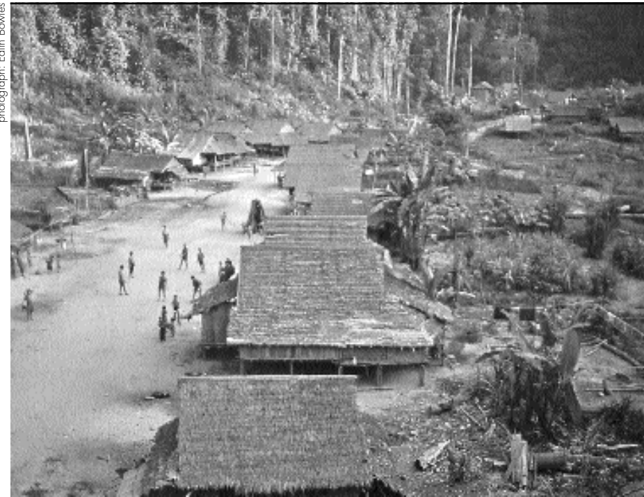
Pa Yaw refugee camp, Kanchanaburi province, 1994

'villages' by their size, density, dependence on external aid, and the level of control exercised over inhabitants by national or international authorities.