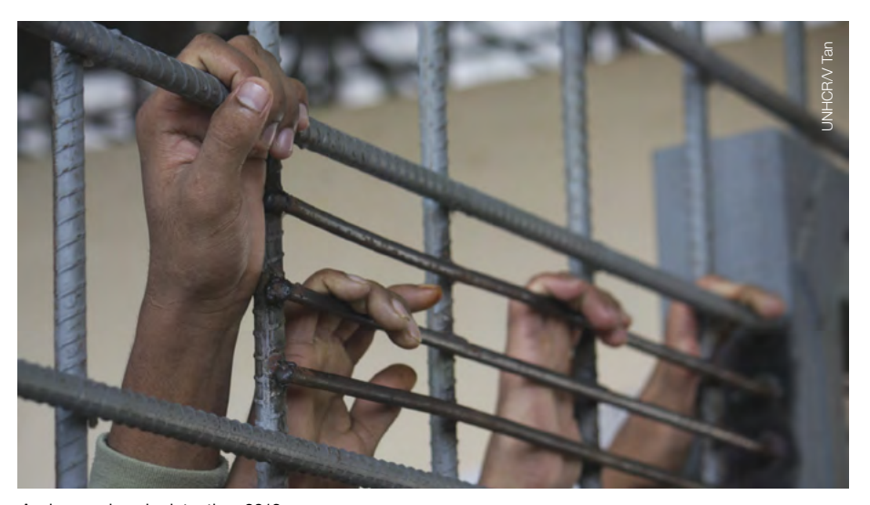
Asylum seekers in detention, 2013.

www.fmreview.org/cities/blouin-berganza-freier