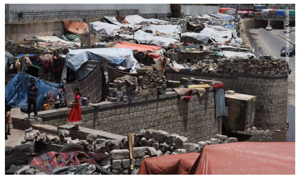
Children play at the Al Habbari informal camp for displaced people in Sana'a, Yemen, August 2018.