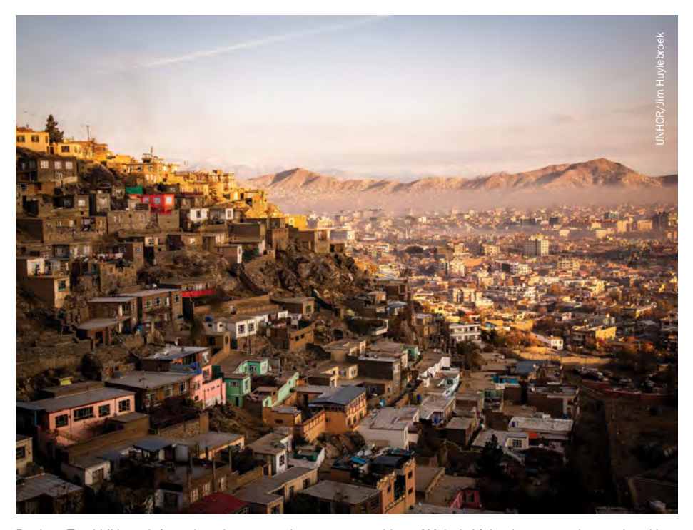
Dasht-e Tarakhil is an informal settlement on the eastern outskirts of Kabul, Afghanistan, mostly populated by Afghans who have returned from Pakistan. UNHCR and its partners are helping returnees gain access to basic services, land and jobs.

To access all FMR podcasts (arranged by issue), go to https://podcasts.ox.ac.uk/series and search for 'forced migration review'.