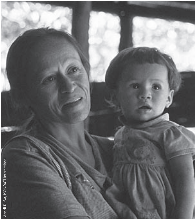
IDPs in Colombia.

and other key indicators so that the specific needs of particular groups of IDPs can be taken into account. Attention must be given to the different causes of displacement. Furthermore, information is needed not only on IDPs in emergency situations but also on those in protracted situations of displacement. It should be noted that data collection and registration processes must in no way put at risk the security of the displaced or affect their legal entitlement to enjoy the protection and assistance of their government.