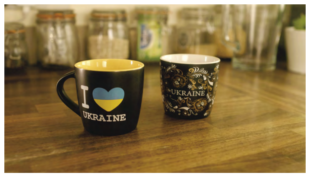
Gifts brought by Ukranian refugees for their hosts in the UK.