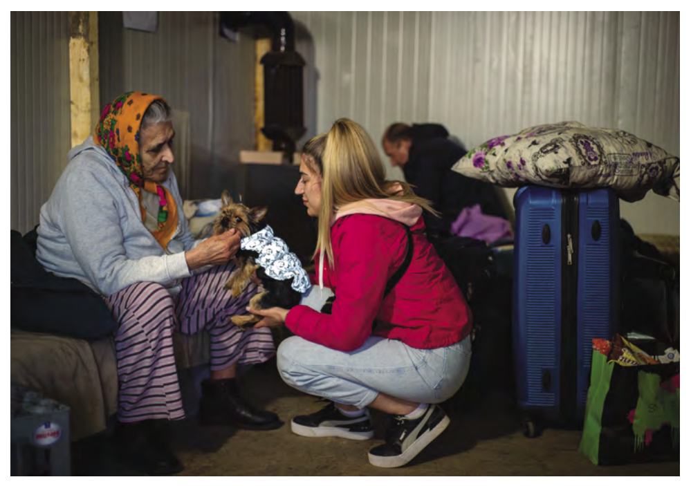
Ukrainian Refugees waiting at the Ukrainian-Romanian border checkpoint Porubne-Siret, March 2022.

The Temporary Protection Directive does not contribute to an effective integration process. Measures to facilitate refugee integration need to be put in place even if return is the preferred durable solution. www.fmreview.org/ukraine/bratanovavanharten