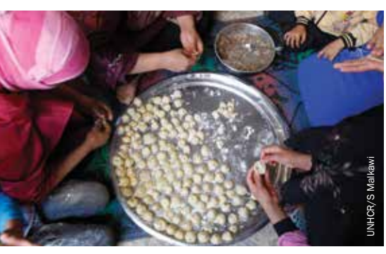
Syrian women cook together in a mosque converted to accommodate refugees in Arsal, northern Lebanon. 2012.

vouchers. People also run up small amounts of credit with local shopkeepers on a weekly basis. A system of job swapping is also evident amongst skilled manual workers and teachers. These small-scale bargains between refugees and their hosts are useful for both populations to get by and highlight both the importance of dignified 'autonomous' trade for the refugee, and the significance of the role of the host community in providing assistance by accepting the refugees into the informal economic life of the community.