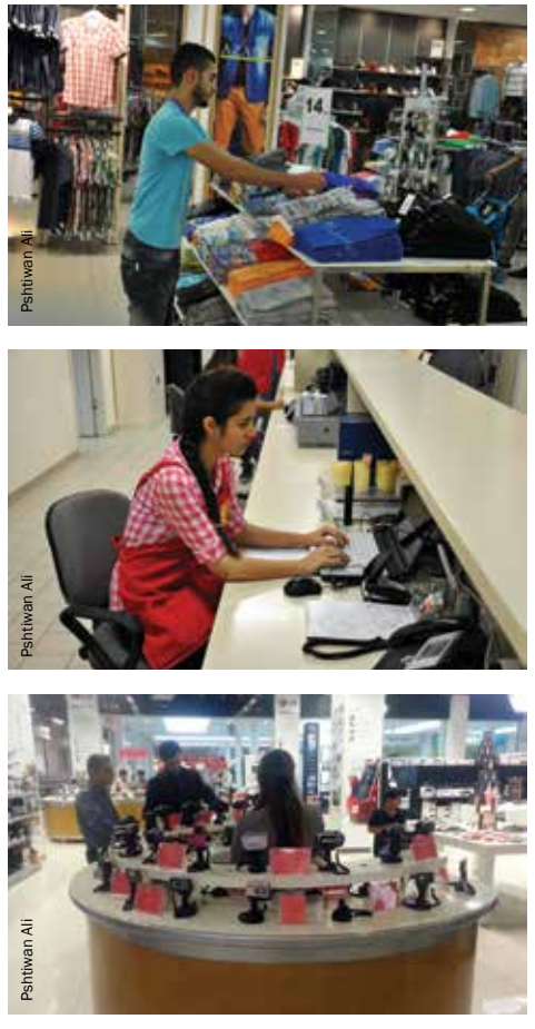
Young Syrians and Kurds on job placements.

Two months after the financial support from the project stopped, approximately 79% of the project beneficiaries were still working in the businesses where they were placed but now as regular company employees. Those who left did so because they found other employment or moved to another location. The jobs with the best retention rates were in the service industry – restaurant work, retail jobs and employment in shopping malls. DRC also observed that most of the young women benefitting from group job placement in big retail stores stayed on after the project ended; in their case, it seemed that group support and the relative prestige