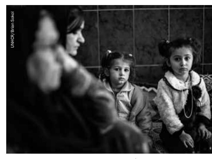
A Syrian refugee family in Erbil, Iraq. The girls' parents paid US$100 per person to be smuggled safely out of Syria after their neighbourhood came under prolonged heavy attack. "More than anything, what I want for my girls is that they are able to attend school in safety," their mother said.

In addition, let us also not forget that displacement is the manifestation of the ugly fact of impunity that rides rampant in Svria. If ever an armed conflict were characterised by the absence of proportionality and distinction, Syria's civil war must be so characterised. All sides are guilty and all wreak havoc with impunity but with the preponderance of force goes the preponderance of responsibility. It is a supreme irony that a regime that so blatantly disregards the obligations of sovereignty and its obligations under international humanitarian law so stridently insists on respect of its sovereign rights.