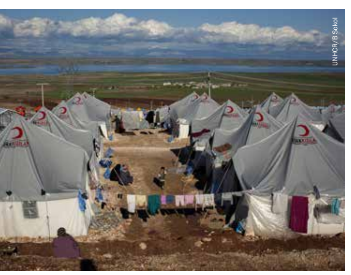
Adiyaman refugee camp, Turkey. 2013.

its third year, people's intentions and plans are changing and they are being forced to re-consider what the future holds. Some are moving on again, adding greater complexity to the profile of Syrian displacement and to the provision of humanitarian assistance.