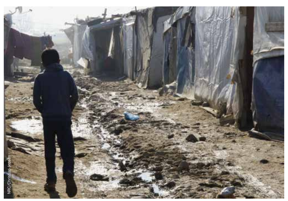
Syrian boy in an informal tented settlement in the Beka'a Valley, eastern Lebanon.

Limitations on their movement also impeded access to services, particularly health care.