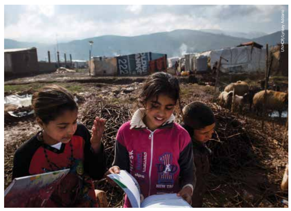
Syrian refugee girls try to study in their tented camp in Turbide, Beka'a Valley.

incidence of poverty and illiteracy rates in Jordan (along with Ma'an governorate).