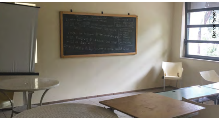
A CAS classroom, after an Italian language lesson. Italy, 2017.

By mid-2018, however, following national elections, the general sense among the CAS residents was that asylum officials were increasingly denying claims, regardless of nationality. 2 Multiple CAS residents whose applications had been rejected described feeling that these denials were also a rejection of the commitment they had made to integrating.