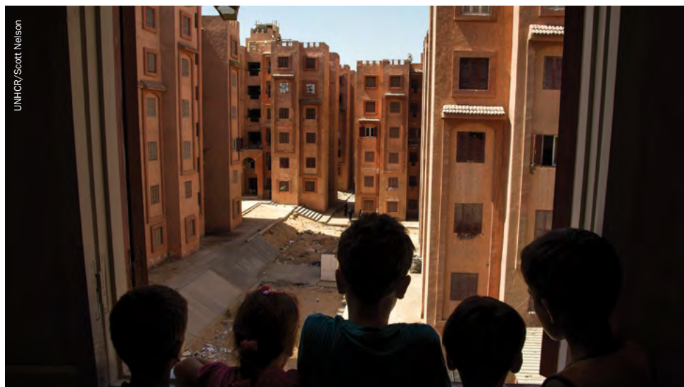
Syrian refugee children in Masaken Osman neighbourhood on the outskirts of Cairo, Egypt.

with relevant international guidelines; however, observations by stakeholders (including staff of Saint Andrew's Refugee Services, StARS, who subsequently assist children whose age has not been accepted by UNHCR) suggest otherwise.