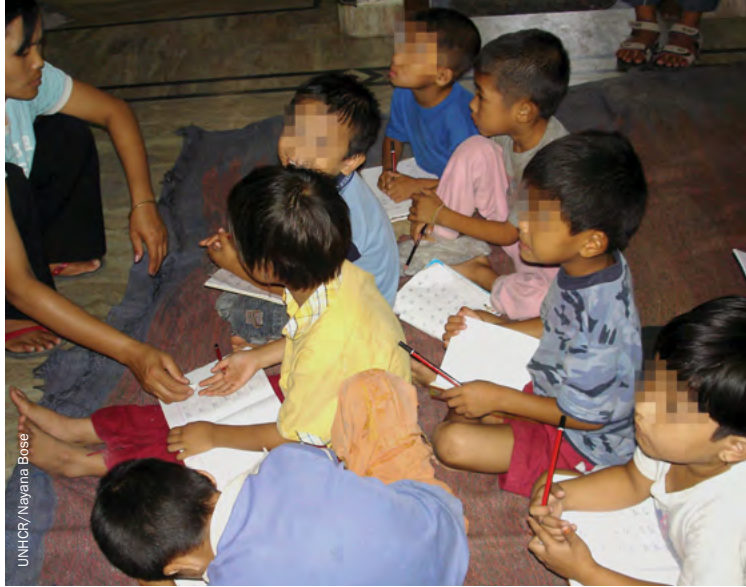
Refugee children from Myanmar learning English and Hindi at a UNHCR daycare centre, New Delhi, India. Why are their eyes pixellated? See FMR photo policy www.fmreview.org/photo-policy

to account. While it does not contain any specific provision for RSD, the GCR does explicitly mention the need to have mechanisms in place for identification and registration of refugees and for the fair and efficient determination of individual asylum claims. More concretely, it led to UNHCR