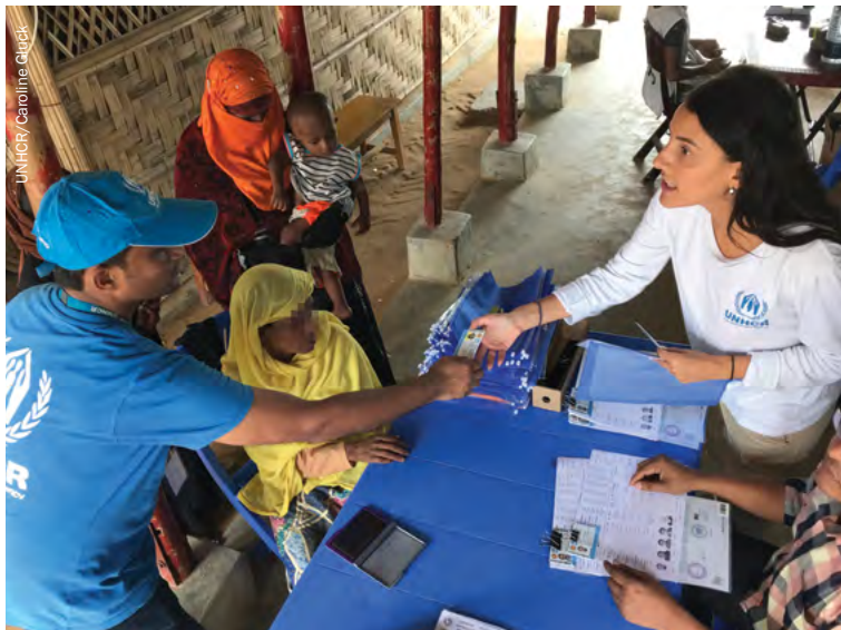
UNHCR team registers Rohingya refugees in Bangladesh.

One of the main challenges we have confronted is the difficulty in gathering data on the legal basis and processes underlying group recognition. Prima facie practices are widespread in Africa but there is no centralised source of information on these decisions, and in some instances records are difficult to locate, even though they effectively determine the status of millions of refugees. Notwithstanding deficits in official sources and transparency, it does seem that prima facie status is effective in terms of providing