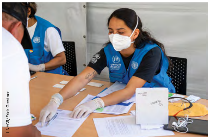
UNHCR staff explain the consent form for cash-based assistance for vulnerable asylum seekers during the COVID-19 crisis, San Jose, Costa Rica, March 2020.

For example, it is widely accepted that group ( prima facie ) recognition should only be used to recognise refugee status, whereas due