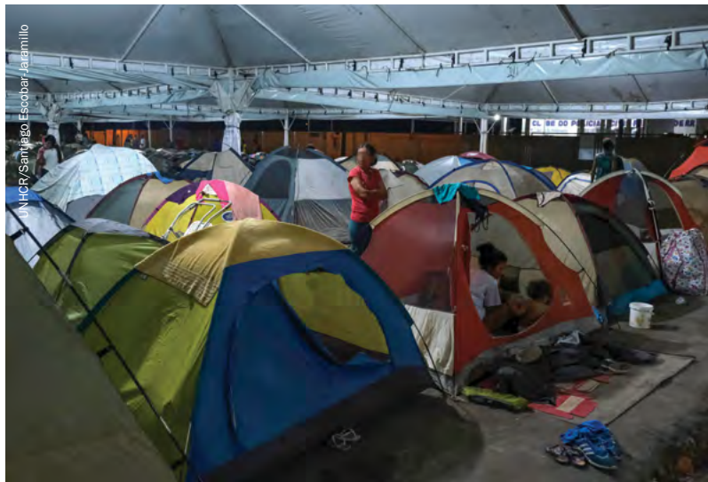
More than 1,000 Venezuelan refugees and migrants sleep in tents in Boa Vista's bus station, Brazil.

According to CONARE, 3 a business intelligence tool has been used to collect asylum seekers' fingerprints and then to map asylum claims. The technology has compared the information on Venezuelan asylum claims with over one million migratory movements, thousands of records of Venezuelans who are already resident in the country, and 350,000 claims relating to migration with the Ministry