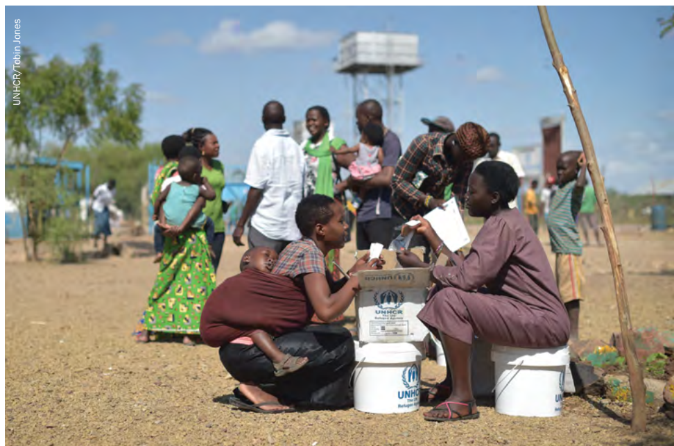
Newly arrived South Sudanese refugees being provided with non-food items, Kakuma camp, Kenya.

Lack of access to effective legal representation also affects asylum seekers' ability to launch appeals. Although they are permitted to instigate appeals to the Board without legal representation, asylum seekers who do so may lack the legal knowledge to first interpret the legal reasoning provided by the Commissioner in support of its decision. For instance, some level of legal knowledge is often required in order for an asylum seeker to decipher the meaning of refugee law concepts such as a well-founded fear of persecution or the reasonable possibility of suffering serious harm. Without this legal knowledge, it is difficult for asylum seekers to draft the points of appeal that are required to successfully instigate a review, and they may either present less effective, non-legal points of appeal, or be deterred from launching an appeal in the first place. 2 The lack of access to legal representation in Kenya therefore limits the ability of asylum seekers who wish to appeal against RSD decisions both to put forward an effective point or points of appeal, and to enable those appeals to proceed through the court process.