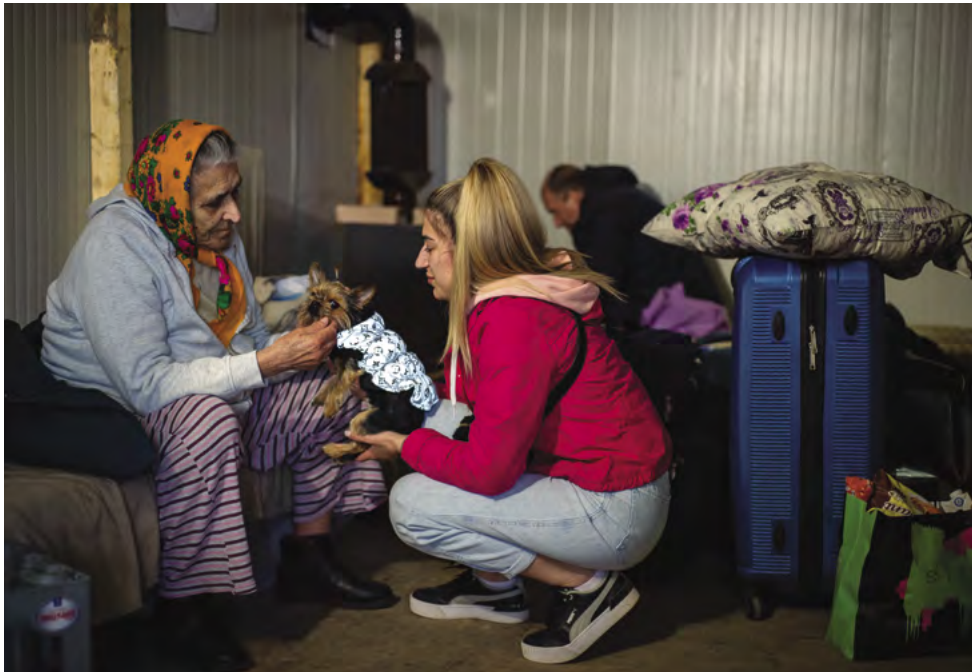
Ukrainian Refugees waiting at the Ukrainian-Romanian border checkpoint Porubne-Siret, March 2022.

www.fmreview.org/ukraine/bratanovavanharten