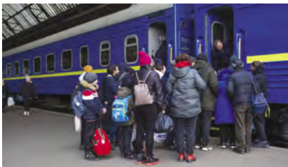
Front cover image: People fleeing the conflict in eastern Ukraine board a train at Lviv train station, March 2022.

Forced Migration Review Refugee Studies Centre Oxford Department of International Development University of Oxford 3 Mansfield Road, Oxford OX1 3TB, UK