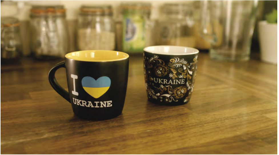
Gifts brought by Ukrainian refugees for their hosts in the UK.