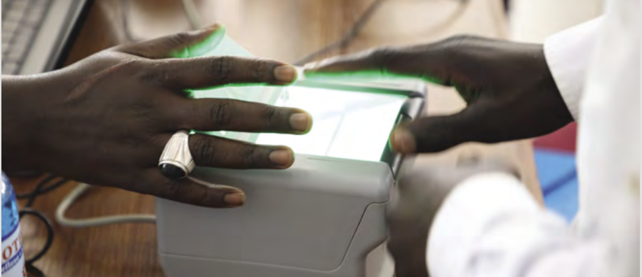
Taking fingerprints as part of a UNHCR organised registration process for refugees living in Senegal, March 2022.

This issue of FMR aims to explore the double-sided nature of digital technologies and their implications for displaced people across the globe. Submission deadline – 15 October 2023 Publication date – April/May 2024 • www.fmreview.org/digital-disruption