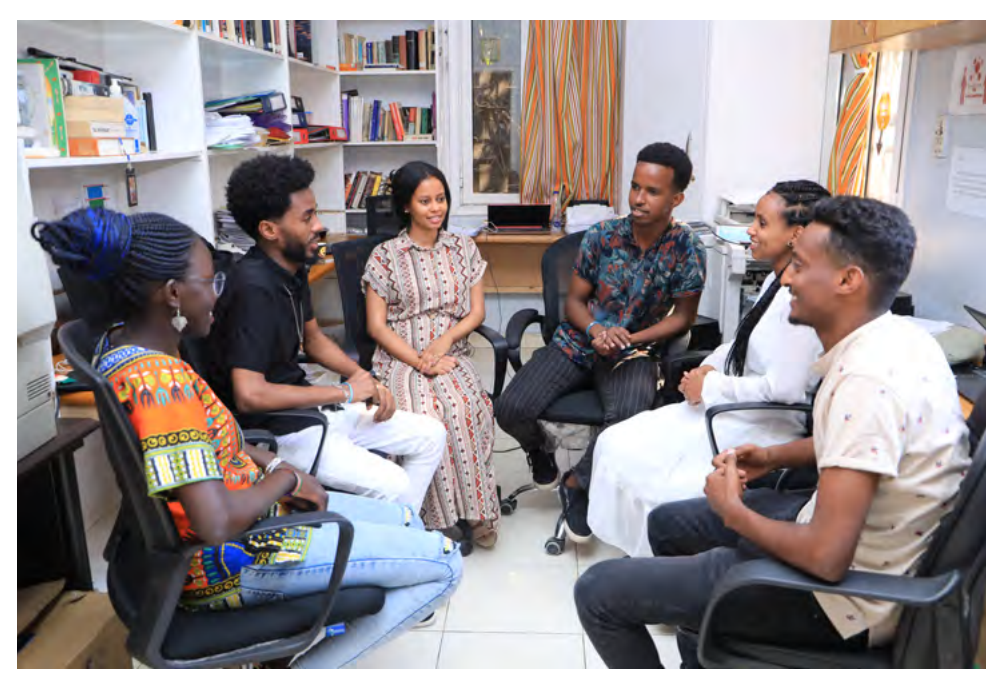
Current and former members of the Youth Advisory Board and refugee youth staff meet at StARS premises

In 2020, youth staff noticed that a lack of job opportunities, recreation activities and education put UCY at risk of alcohol and drug use in the streets. The YAB advocated to address this by opening a game centre at StARS so that UCY clients and UYBP students could spend more time in safe spaces.