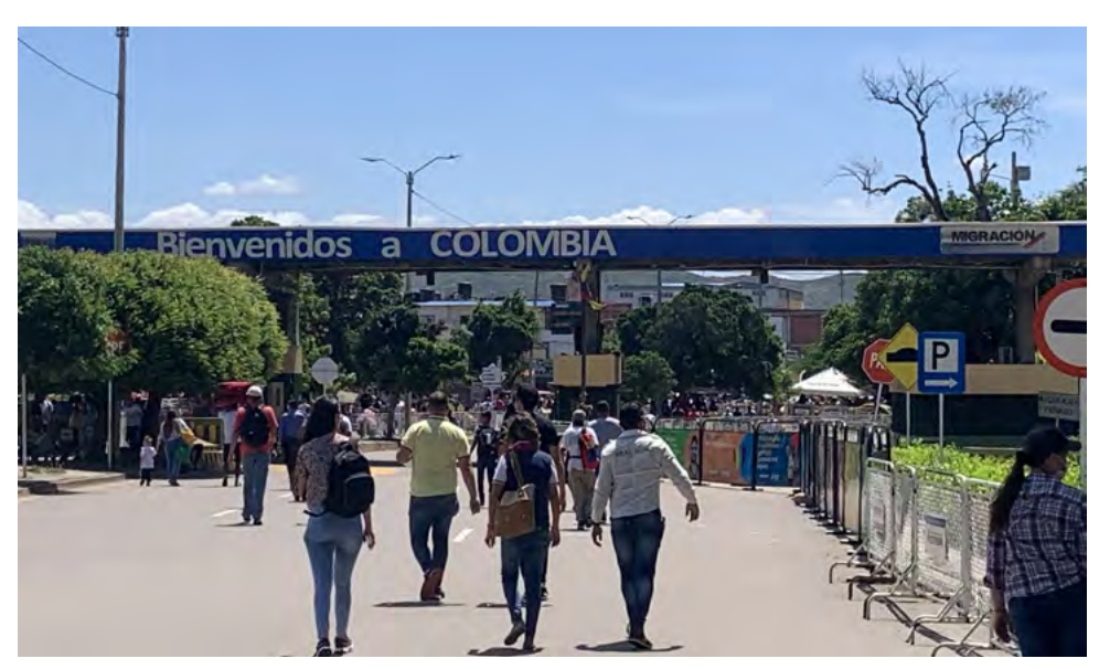
People crossing the Colombia-Venezuela border

hospital?" In this case, the researcher and his team did not proceed with this proposal as they considered the quantitative approach requested by the funding agency to overlook important factors related to prejudice and discrimination in health-care provision.