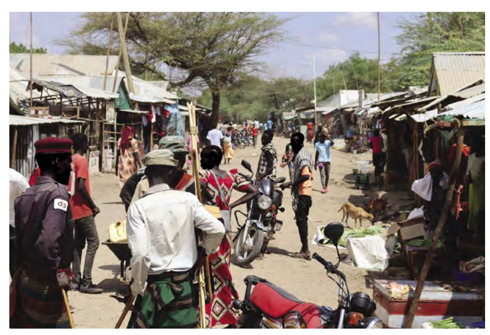
The markets in Kakuma refugee camp bustle with social interaction and economic exchange among refugees as well as Kenyans, but lack infrastructure due to the government's insistence that the camp remain temporary

Despite enforcing encampment, Kenya adopted the CRRF in 2017, pledging to incorporate refugee assistance into its national development plans and to ensure that refugees, returnees, hosts and others living in displacement-affected areas have equal opportunities to achieve self-reliance and well-being. CRRF implementation took centre-stage in the refugee-hosting counties of Garissa and Turkana, which have each established local socio-economic development plans.<sup>3</sup> Kenya has also been a leader in associated regional agreements such as the Djibouti Declaration on Refugee Education.