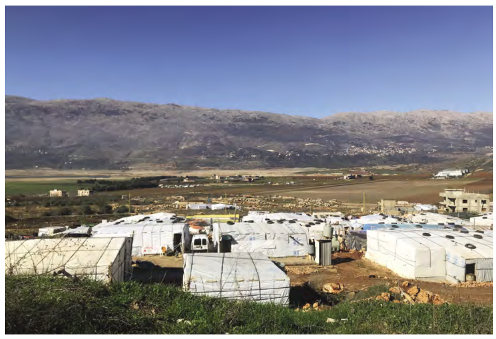
Across the Beqaa Valley in eastern Lebanon, tens of thousands of Syrians have taken up residence in tented settlements, just kilometres from the border with Syria

Increasingly cohesion and stability projects have attempted to address relations between displaced Syrians and Lebanese host communities. In 2015, actors including government ministries, national NGOs, and international organisations came together to form a 'Stability Sector' aimed at addressing these inter-communal tensions. Their activities included establishing a Tension Monitoring System administered by UNDP. Research by the 'Social Cohesion