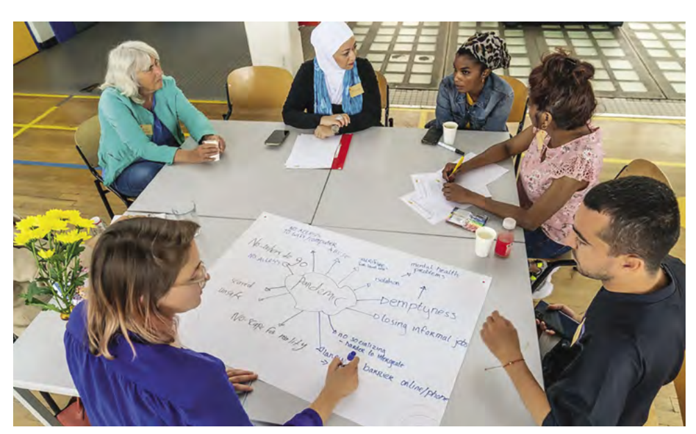
Participants discussing the impact of COVID-19 on the lives of newcomer women as part of a Diversity Dialogue Forum'

how most actors, despite their best intentions, create research, humanitarian or policy interventions which are based on the concept of 'doing to' – that is, where displaced people are passive recipients of an intervention – or perhaps 'doing for', where there is limited participation but no real agency or power. The goal of true, meaningful partnership requires 'doing with'.