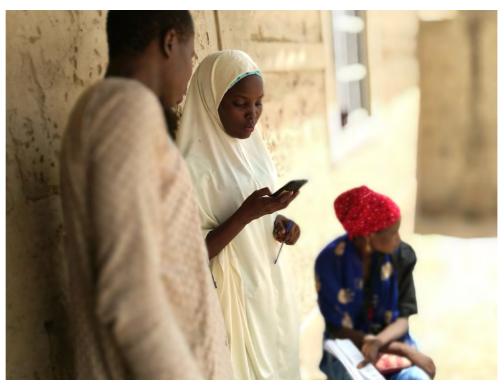
Enumerator conducting comprehension testing with a resident of Farm Centre IDP camp, Maiduguri, July 2017

This can help prevent people from being excluded or misunderstood because they do not speak the dominant language, and help reduce reliance on family members and neighbours who are not trained interpreters. When discussing topics like sexual exploitation and abuse, it may be better to have an enumerator and interpreter from outside the community in order to protect privacy.