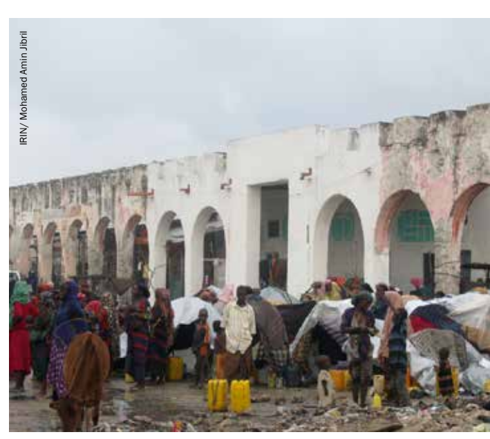
IDPs in Mogadishu, Somalia, 2011.

A frequent request from government, and humanitarian and development partners directed to the Special Rapporteur's Office is for help to 'operationalise' the text of the IASC Framework, in particular for help to use the eight criteria it lays out, in order to better analyse the displacement situation on the ground. In response, the Special Rapporteur's Office and the Joint IDP Profiling Service (JIPS) have teamed up to try to fill this gap by combining the IASC Framework's definition, principles and criteria for durable solutions with JIPS experience in facilitating collaborative profiling processes. The aim is to develop a global toolkit for analysing durable solutions and developing a strong baseline against which to monitor progress over time.